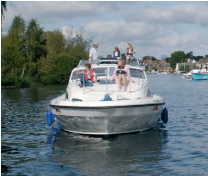
Boating on the Broads has been a hit with holiday-makers this summer

The future is looking brighter for some Broads pubs too. The Pleasure Boat Inn at Hickling reopened in July, the Maltsters at Ranworth is also trading again and Coldham Hall at Surlingham, currently undergoing refurbishment, is set to reopen its doors.