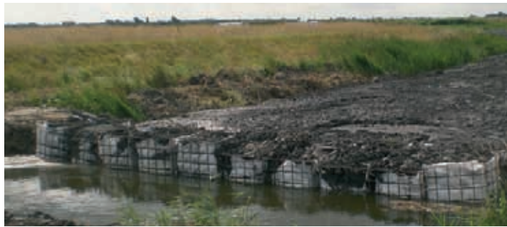
Steel cages being trialled for dredging disposal

In September three baskets were installed at between one and a half and two metres into the mud to test the ground bearing strength of the bed of the broad.