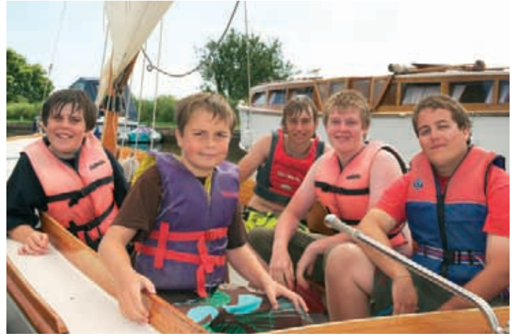
Some of the 7 million visitors who enjoyed the Broads this year

Tolls: For general inquiries about tolls contact our team on 01603 756080 or via email at tolls@broads-authority.gov.uk