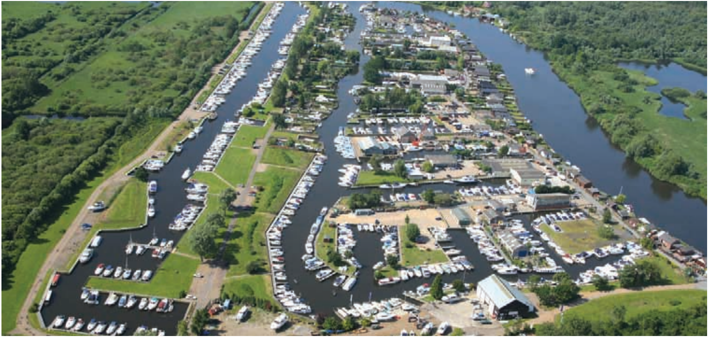
Boats moored in adjacent waters at Brundall