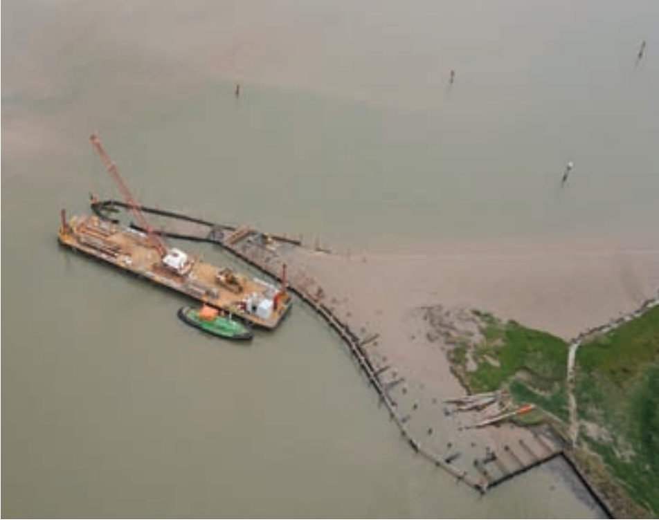
Turntide jetty restoration in progress