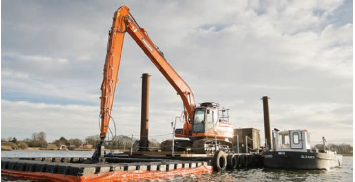
Broads Authority dredging team removing sediment from Hickling Broad