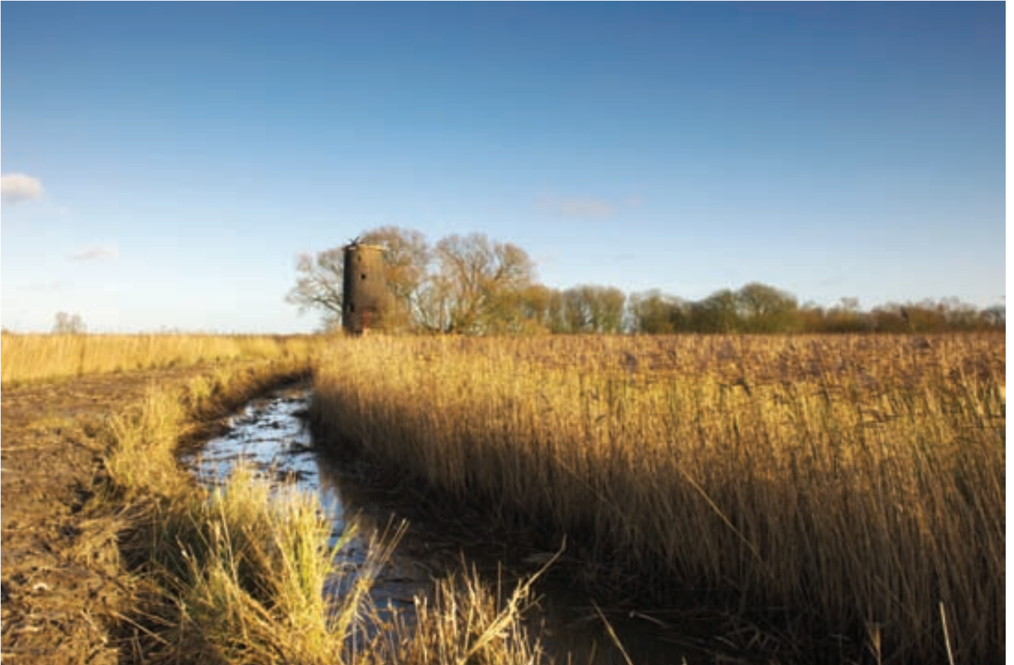
Stones Mill, one of the heritage assets within the project area - photo by Julian