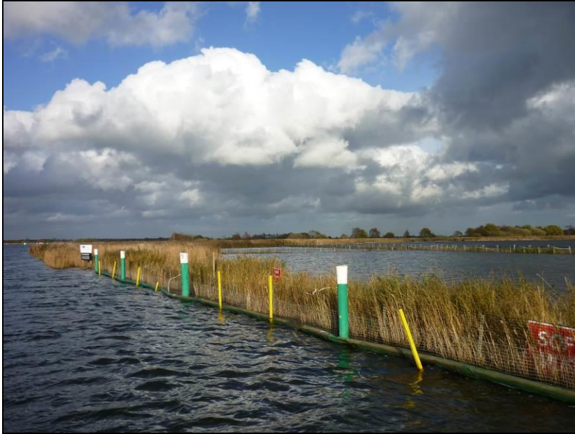
Photo 7: View of the perimeter baskets from the water with reed beginning to establish.