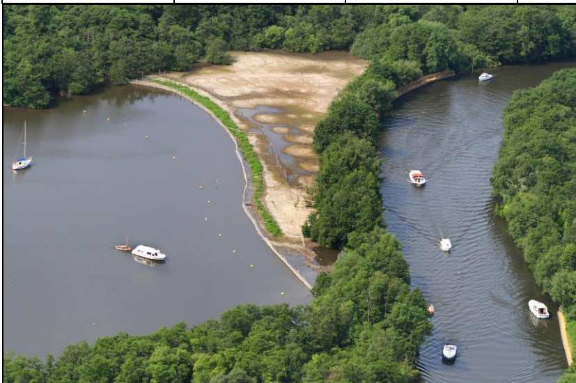
Photo 8: Newly restored reed swamp area retained by geotextile tube at Salhouse Broad.