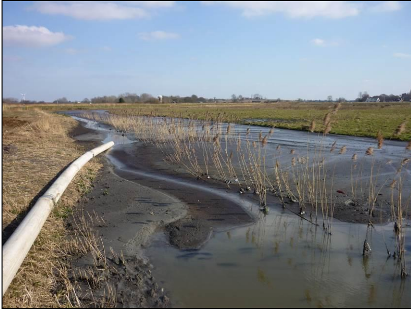
Photo 5: sediment pumped from Heigham Sound filling former soak dyke.