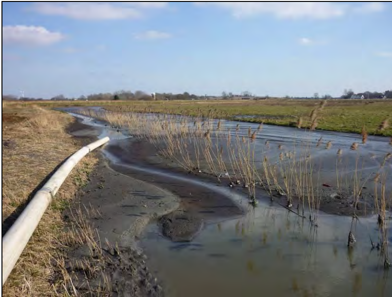
Photo 5: sediment pumped from Heigham Sound filling former soke dyke.