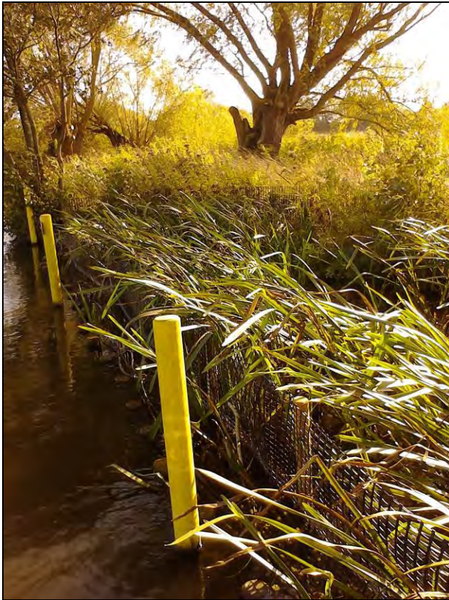
Photo 4: Nicospan erosion protection structure planted with bur-reed.