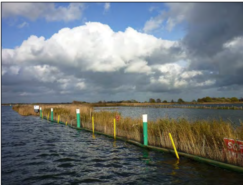
Photo 7: View of the perimeter baskets from the water with reed beginning to establish.