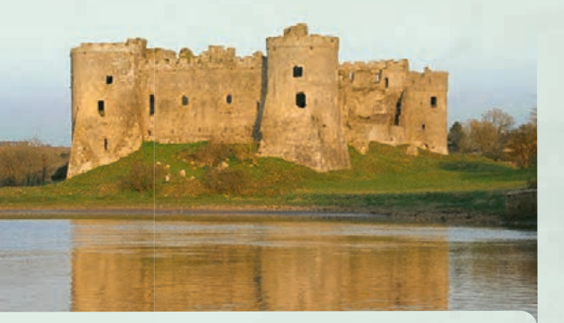
Carew Castle, Pembrokeshire Coast National Park

he United Kingdom's National Parks are amongst its finest and most treasured landscapes, rightly recognised for their tranquillity, special wildlife and unique habitats. They are also cultural landscapes, shaped by human activity over thousands of years. These living, working landscapes have, in turn, influenced local and national identity, inspiring writers, poets and artists and contributing significantly to the nation's rich cultural legacy.