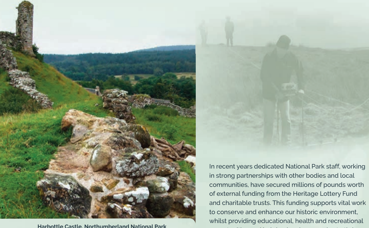
Harbottle Castle, Northumberland National Park

National Park Authorities also have a strong record of providing high-quality training and delivering apprenticeships, and have been involved in the design and development of several Trailblazer Apprenticeships, from historic environment investigation to traditional countryside management.