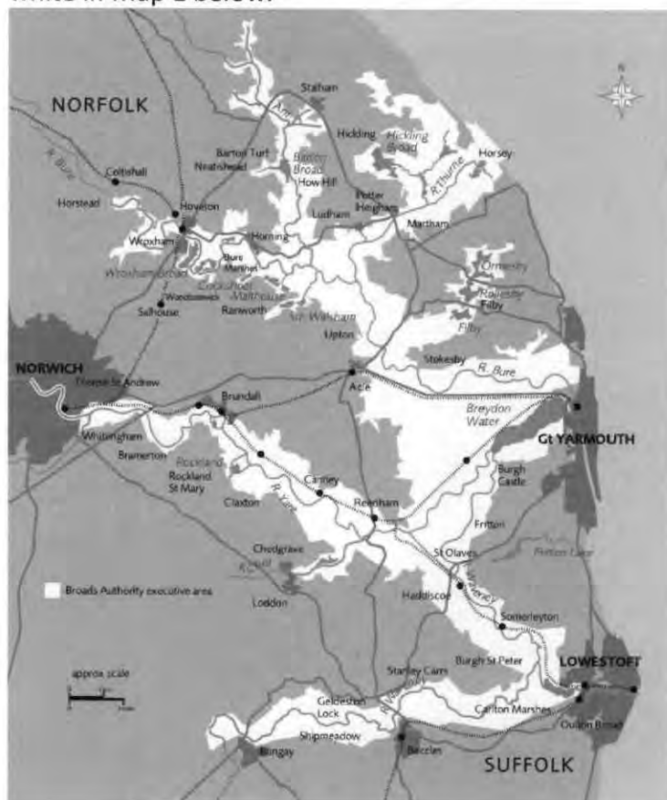
Map 1 - The designated Broads area (shown in white).

1.2.1 The Broads area is an internationally important wetland and a nationally designated protected landscape of the highest order, part of the family of UK National Parks. The designated Broads Executive area, which covers parts of Norfolk and Suffolk, is shown in white in Map 1 below.