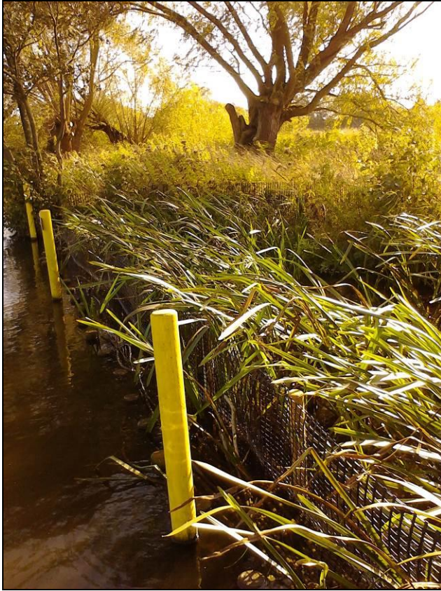
Photo 4: Nicospan erosion protection structure planted with bur-reed.