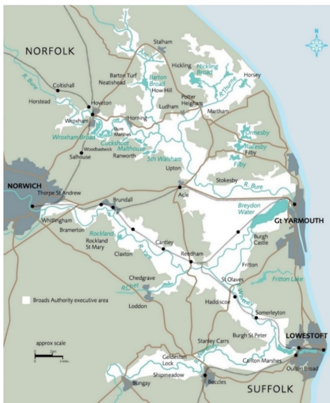
Map 1: Broads Authority Executive Area

The designated Broads Authority Executive Area covers parts of Norfolk and North Suffolk, as shown in white in Map 1 3 . The area includes parts of Broadland District, South Norfolk District, North Norfolk District, Great Yarmouth Borough, Norwich City, and East Suffolk Council area. The councils for those areas do not have planning powers in the Broads area, but retain all other local authority powers and responsibilities. Norfolk County Council and Suffolk County Council are the county planning authority for their respective part of the Broads, with responsibilities that include minerals and waste planning, and are also the Lead Local Flood Authority. The Broads does not sit in isolation; there are important linkages with neighbouring areas in terms of the community and economy – what happens outside the Broads affects the area, and vice versa.