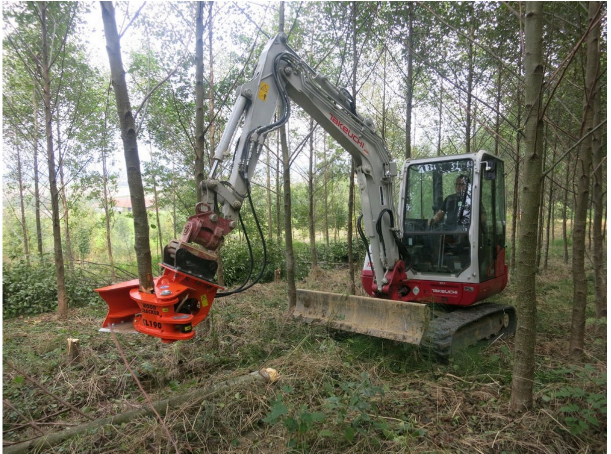
Picture 1 Example of hydraulic tree shears