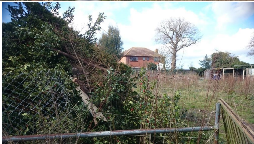
Potential access into the site, using the Private Lane