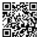
Figure 6: Consultation Poster

You can complete this questionnaire online at: https://www.smartsurvey.co.uk/s/Hemsby2022/