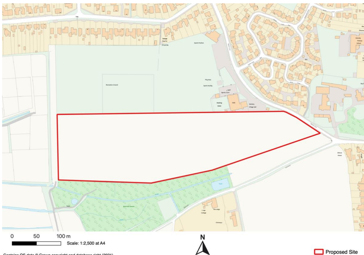
Figure 44: Red line plan of the site put forward as part of the call for sites