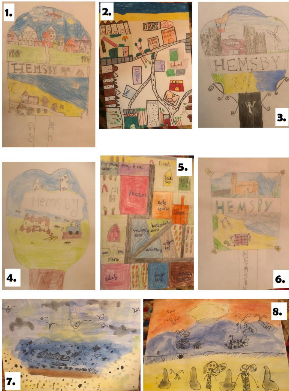
Figure 22: Example of the Hemsby Primary School Art Competition in September 2020 to design a poster for the future vision of Hemsby

18. During this consultation the parish council also contacted Hemsby primary school and asked if the children would like to design a poster of their future vision for the village. The finalists won a voucher in the school competition and examples of the poster can be shown in figure 3.