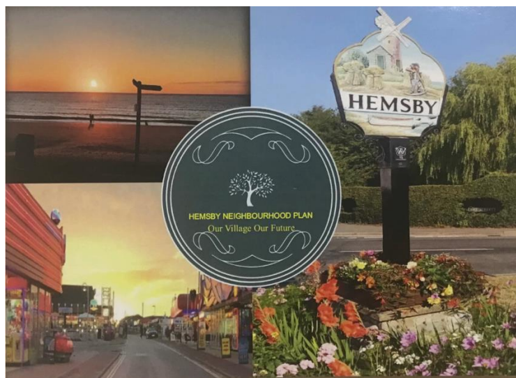
Figure 11: Example of the Hemsby Neighbourhood Plan Postcard used for advertising the survey in September 2020

15. In September 2020, a postcard was delivered to every household in the village, advertising the second survey which the parish council created. The consultation included a survey with 35 questions that asked the community about several themes which could be included in the neighbourhood plan as a policy. This survey was done to get a feel of which policies may be supported by the community moving forward. The survey was available online and as a hard copy for those who requested it. This was promoted extensively on social media using videos and links on various village Facebook pages.