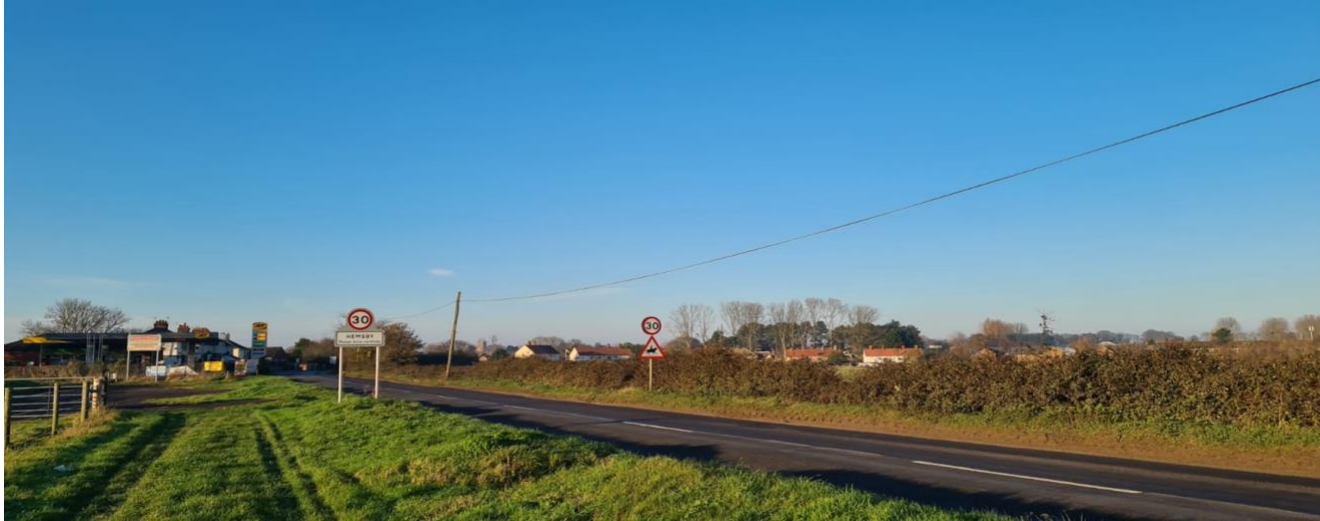
View 1: Coming into Hemsby from Scratby