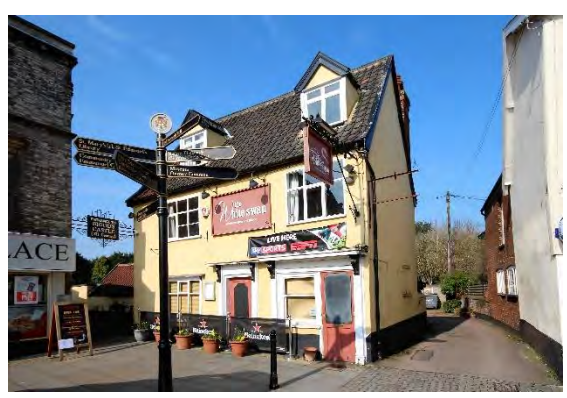
The White Swan, No.16 Market Place

No.14 Market Place (grade II) An early nineteenth century shop of three storeys, two, three-light casement windows at second floor level with flush frames. Two, three-light flush frame sash windows at first floor level. Stucco painted. Low pitched black pan tiled roof. Coupled mutules to eaves. Early nineteenth century shallow projecting splay ended wooden shop front running the full width of the ground floor, with central double doors and a mutular entablature. Red brick two storey rear range. Nos.2 to 16 (even) form a group. The rear section of the plot on which this building stands is within the scheduled area of the Castle complex.