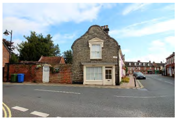
The Chaucer Street façade of No.22 Earsham Street

Nos.20-22 (even) Earsham Street and outbuilding to rear of No.22 (grade II). Part of the same structure as No 18. Probably of mid to late seventeenth century date, two storeys and an attic. Roof to No.22 covered with red plain tiles that to No.20 red pan tiles. These are separated by a partially rendered Dutch gable of possible seventeenth century date. Projecting eaves, and tall gault brick ridge stacks. No.20 with a single gabled dormer containing small pane casement windows. Painted stucco façade to Earsham Street. Six, twelve-light hornless sash windows at first floor level within flush frames. Mid to late nineteenth century horned plate-glass sashes to ground floor. Sixpanelled door to No.20, with semi-circular fanlight the radial bars of which have been removed (see No.18). Set within doorcase with open pediment supported on brackets.