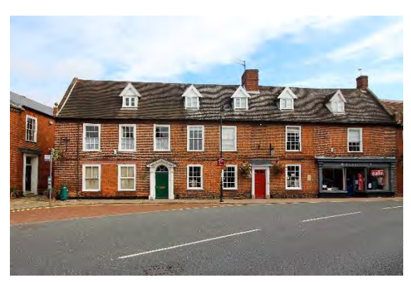
Nos. 4-8 (even) Earsham Street

No.4a Earsham Street. A structure of c1870 consisting of a shop with living accommodation above which replaced a timber-framed gabled building which is shown on early photographs. Of two storeys and two bays and faced in red brick with a red plain tile roof and terracotta ridge pieces. Southern gable with finials and dentilled cornice. Its present façade is radically different from that shown in Edwardian photographs, which show a central canted bay window at first floor level and a central doorway flanked by two small pane sashes below. Four light horned plate glass sashes at first floor level. Dentilled eaves cornice. Early to midtwentieth century shop facia, with late twentieth century partially glazed door inserted post 1977 within the original facia. Reeve C, Bungay Through Time (Stroud, 2009) p38.