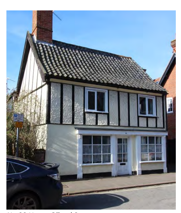
No.30 Upper Olland Street

No.28 Upper Olland Street. A purpose-built public house of c1913 on the site of an earlier inn. Formerly the Rose and Crown, it closed c1970 and is now a dwelling. Vernacular revival style, with unaltered façade. Red brick with a roughcast rendered first floor and applied decorative halftimbering. Plain tile roof with decorative pierced ridge pieces. Overhanging eaves and simple wooden bargeboards. Three substantial mullioned and transomed windows to ground floor in painted stone surrounds. Painted stone doorcase. Oriel window within gable at first floor level and two wooden casements with mullions. Plaster inn sign with a rose and a crown set within name panel. Honeywood F, Reeve C, & Reeve T, The Town Recorder, Five Centuries of Bungay at Play (Bungay, 2008) p100-101 & 156-7.