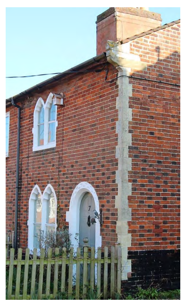
No.7 Southend Road

No.7 Southend Road. A mid-nineteenth century cottage which forms part of a semi-detached pair with the much altered No.5 (not included). Red and blue brick with painted stone dressings and quoins. Shallow pitched Welsh slate roof with deep overhang to eaves. Neo-Norman arched doorcase. Six-paneled door. Pointed arched windows divided by central splayed mullion.