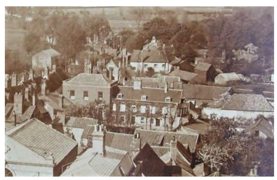
Bridge House from St Mary's Tower c1920

Bridge House No.34 Bridge Street (grade II). A substantial multi-phased townhouse of late sixteenth century origins with a large extension fronting Bridge Street of c1776. Further additions to rear. The house stands at a right-angle to the Street with a principal façade facing south. In 1688 it was occupied by Gregory Clarke who was rebuilding it at the time of the great fire, from which it was saved by the watchman. The western portion (fronting Bridge Street) is of red brick and of two high storeys. Its Bridge Street façade is of two bays with a blankwindow panel to right on each floor, with flat arches, and stone sills. Horned twelve-light sashes to left-hand bay. Cornice, below a parapet with a stone cope. Hipped roof. Entrance front to south of three bays, with hornless twelve-light sashes. Sixpanelled door with arched patterned radial fanlight above, set within a doorcase with panelled reveals, fluted Doric columns, triglyphs, and a dentilled pediment.