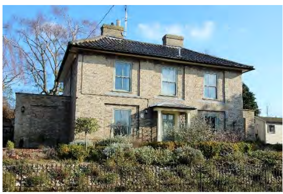
No.9 Flixton Road

roof and decorative tile ridge pieces. Entrance façade to north of three bays with central gabled porch and hornless sash windows. Flixton Road elevation with corner pilasters and pediment with a terracotta raking cornice. Hornless twelve-light sash windows with moulded brick surrounds with pilasters and stone corbels. No.7 of painted brick with a pan tiled roof. Casement windows to first floor. Wooden veranda with hipped pan tiled roof and fretwork frieze containing a canted bay window with sashes and shutters. Subsidiary Structures. Low nineteenth century red brick wall with a moulded gault brick cap and gault brick piers.