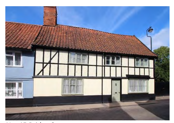
No. 45 Bridge Street

Nos.39-43 (odd) Bridge Street (grade II). A group of three seventeenth century cottages. Two storeys, with an attic which was formerly lit by dormers according to the statutory list. Red pan tiled roof and a centrally placed red brick ridge stack. Rendered brick ground floor, with a timber framed and plastered first floor. Continuous drip mould band at first floor level. Row of five casements in flush frames to the first floor, mostly of later twentieth century origin. Horned sash windows with margin lights to ground floor of Nos.41 & 43, No.39 with twentieth century casement windows in flush frames at ground floor level. Four-panelled front door to No.39. Nos.41 & 43 with panelled doors with glazed upper panels. Heavy flush door frames for Nos.39 and 43. Nos.29 to 45 (odd) form a group.