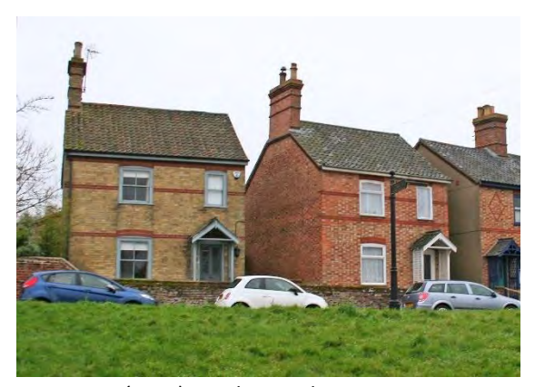
Nos.42-44 (even) Staithe Road

pan tiled roof and central ridge stack to spine wall. C1900 red brick boundary wall to Staithe Road. A relatively early use of Fletton brick.