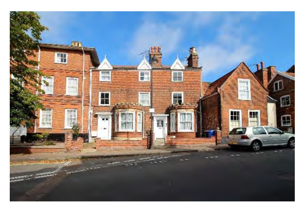
Nos.50-52 (even) Earsham Street

gable with tumbled foot. Flush frame sash window with glazing bars. Entrance at angle with fielded lower panel to door.