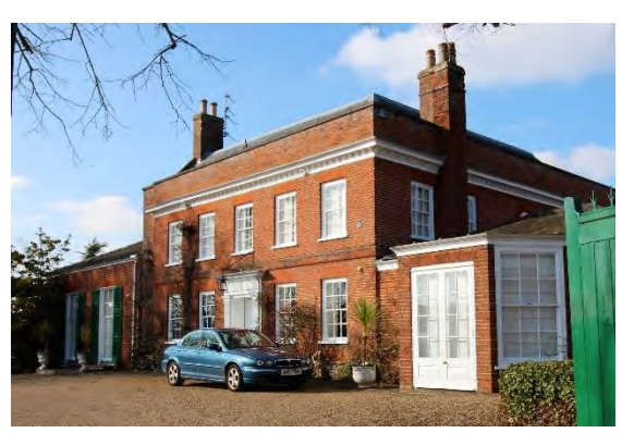
Rose Hall, No.52 Upper Olland Street

No.50 Upper Olland Street (grade II). Early eighteenth century, of two storeys, red brick, with a plinth. On the corner of Boyscott Lane. Black pan tiled roof covering to Upper Olland Street, red to Boyscott Lane. Upper Olland Street façade of three bays with a coved cornice. 2 windows, flush frame sash, with glazing bars, segmental arches at ground floor. Four-panelled door in wood case-with fanlight and fluted pilasters. Three bay return elevation with a hipped roof. Segmental arched lintels to sash windows. Central ground floor window a larger casement. Largely blind rear gable. Nos.30 to 34 (even), Emmanuel church and Nos.38 to 52 (even) form a group.