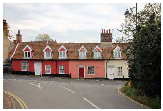
Nos.61, 65, & 67 Earsham Street from Outney Road.

Sashes with glazing bars and flush frames, cambered arches at first floor. Shop front, left, in wood case with reeded pilasters and enriched cornice. Return elevation to Nathan's Yard with decorative applied timber framing. Nos.39, 41, 49, 55 to 61 (odd) and Nos.65 to 73 (odd) form a group.