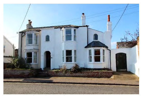
Nos.21-23 (Odd) Wingfield Street

Nos.21-23 (Odd) Wingfield Street and wall. A mid nineteenth century structure with the appearance, rendered brick with a Welsh slate roof. of once being a single villa, now two dwellings. No.21 retains much of its original appearance and has a canted bay with sash windows to Wingfield Street. The windows to No.23 have been replaced within the original openings. Central arched doorway with pronounced keystone within breakfront. Subsidiary Structures High nineteenth century painted brick wall with gate.