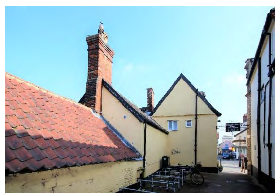
The White Swan, No.16 Market Place

roof. Honeywood F, Reeve C, & Reeve T, The Town Recorder, Five Centuries of Bungay at Play (Bungay, 2008) p146-147. . Honeywood F, Reeve C, & Reeve T, The Town Recorder, Five Centuries of Bungay at Play (Bungay, 2008) p95 & 143-147.