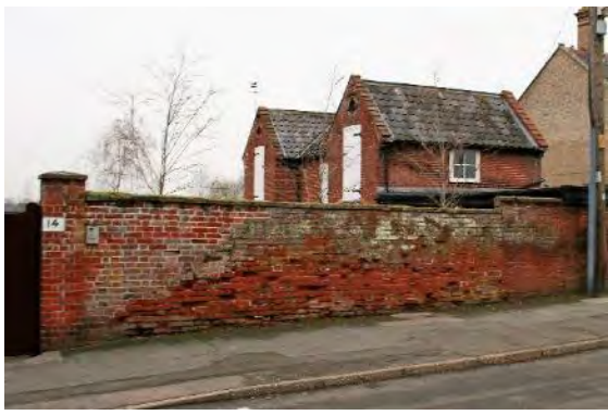
Stable at No.14 Flixton Road

The Red House, No.14 Flixton Road, stable and boundary walls. (grade II). Late-eighteenth century villa, facing south with return elevation to Flixton Road. Two storeys, red brick with an enriched wood cornice. First floor band, plinth, black pan tiles. Symmetrical three bay façade with sash windows beneath cambered flat arches. Louvred and panelled shutters. Sash windows, with glazing bars, set back in recesses to take shutters at first floor level with arches over the recesses. Three-light windows with glazing bars at ground floor level of the same width as the recesses over. Four-panelled door in wood case with panelled reveals. Formerly with porch. Subsidiary structures. Good nineteenth century stable range to rear. Red brick with a black pan tiled roof. Two storeys, the outer bays breaking forward and with gables. Boarded doors to ground and first floors and an oculus within each gable. Good red brick boundary wall to Flixton Road frontage of rear yard. The southern part of the wall fronting the garden appears to have been rebuilt. Nineteenth century red brick wall to northern return boundary.