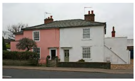
Nos.22 & 24 St John's Road

recently rebuilt. Stone rubble wall with red brick dressings separating Nos. 20 & 22, rear section of red brick. Late twentieth century garage to No.20 not included.