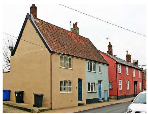
Nos.52 & 54 Lower Olland Street

No.48 Lower Olland Street. Four bay two storey house of possibly mid to late-eighteenth century date. Painted, and partially rendered red brick façades and a black pan tile roof. Dentilled eaves cornice. Doorcase with hood supported by decorative console brackets. Six-panelled door with rectangular fanlight above. Plinth. Late twentieth century uPVC windows in original openings. Cambered arched lintels to ground floor openings. Catslide roof over lower section to rear.