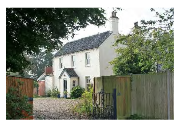
No.14 Wharton Street

garden wall to No.11a. Bettley, J, and Pevsner, N, The Buildings of England, Suffolk: East (London, 2015) p.157. Honeywood F, Morrow P & Reeve C, The Town Recorder, A History of Bungay in Photographs (Bungay, 1994) p109. Reeve C, Bungay Through Time (Stroud, 2009) p65.