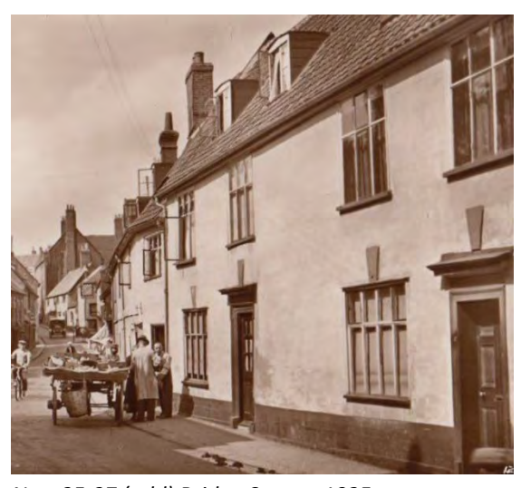
Nos. 35-37 (odd) Bridge Street c1925

Nos.35-37 (odd) Bridge Street (grade II) Early eighteenth century, of two storeys with an attic lit by four flat roofed dormers. Red pan tiled roof and substantial central red brick ridge stack rising from party wall. Stucco on brick, lined as ashlar. The first floor has early nineteenth century casements, of six lights, in flush frames. Flat heads formerly with keys to two eight-light ground floor windows. Inserted four-light casement to right of doorway within No.35. Part glazed door to No.35 eared architrave, pulvinate frieze and dentil cornice. Modern door to No.37 in wooden case with architrave frieze and cornice. Nos.29 to 45 (odd) form a group.