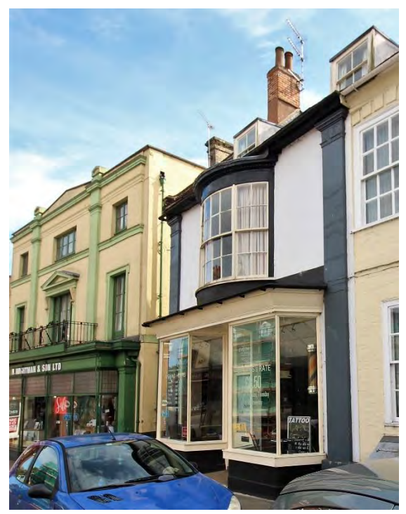
No.7 Market Place

No.7 Market Place (grade II). Early eighteenth century, of two storeys and an attic, two casement dormers within roof slope. Stucco. Market Place façade of two storeys flanked by pilasters. Red plain tile roof. Bowed oriel sash window at first floor level, with small pane sashes and a dentilled cornice. Mid nineteenth century wooden splayed bay shop front with a central entrance. Nos. 1 to 11 (odd), Nos. 11A, 13 and 17 to 21 (odd) form a group together with the Butter Cross.