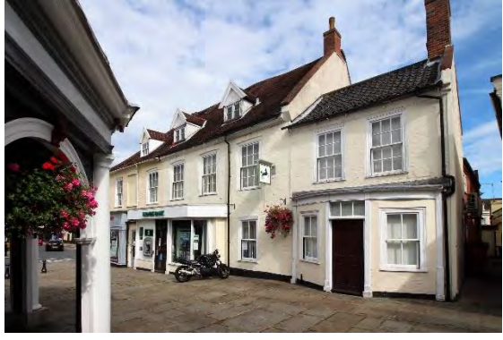
No.11a Market Place

Nos.9 & 11 Market Place (grade II). An early eighteenth century building on a prominent corner site. Of two storeys with attics which are lit by gabled sash dormers. Colour-washed brick. Red plain tile roof covering. Principal elevation of six bays and a return elevation of four. Flush framed twelve-light hornless sashes beneath rusticated cambered arches to first floor. Entrance door with fanlight and wood case. Mainly modern shop fronts. Originally one building. Essentially part of the old market. Nos.1 to 11 (odd), Nos.11A, 13 and Nos.17 to 21 (odd) form a group together with the Butter Cross.