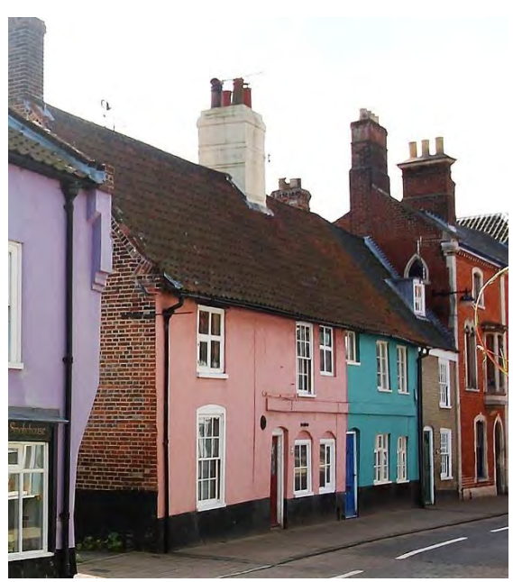
Nos.40-44 (even) Bridge Street

No.38 Bridge Street (local list). A substantial later nineteenth century red brick dwelling with stone dressings, dentilled eaves cornice and full height pilasters. Plate glass sashes and some later casements. Three storey, two bay principal façade. Arched doorcase with keystone and four panelled door. Simple semi-circular fanlight. Canted stone oriel window above. Substantial red brick chimneystack. Forms part of a semi-detached pair with No.36.