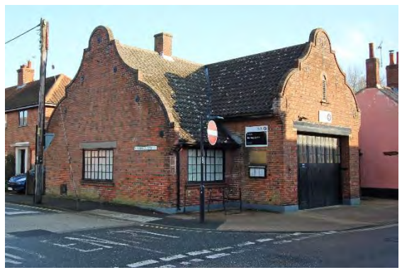
No.29 Lower Olland Street

Nos.1-3 (odd), Lower Olland Street (grade II). The former Angel public house, in use as such from the early nineteenth century, the pub closed in 2009. Seventeenth century timber-framed, now with a stuccoed, and largely early nineteenth century façade. lined and painted, coved cornice, black pan tiled roof covering. Four-bay principal façade with plate-glass sashes within flush frames. Two early nineteenth century six-panelled doors in wooden cases with mutular cornices. Former pub facia with small pane casements. Honeywood F, Reeve C, & Reeve T, The Town Recorder, Five Centuries of Bungay at Play (Bungay, 2008) p164.