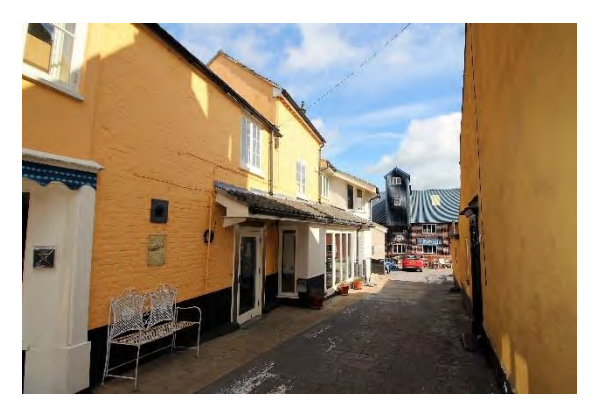
Fisher Theatre, return elevation

The Buildings of England, Suffolk: East (London, 2015) p.153-154.