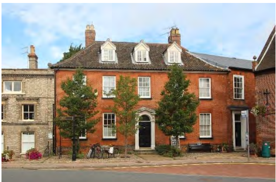
Earsham House, No.12, Earsham Street

Earsham House, No.12 Earsham Street including No.1a Broad Street (grade II). Eighteenth century two storey, attic, and basement, three pedimented dormers. Red brick, small wood cornice, modern tiles. Plinth. Five windows, sash, with glazing bars and flat arches. six-panel door in wood case with enriched pilasters, radial bar fanlight, consoles, and open pediment. Fine arts and crafts vernacular rear range of 1892 fronting onto Broad Street now part of the Council offices. Red brick with a hipped roof over wide projecting eaves. Fine oriel window at first floor level with mullions and a transom containing leaded lights. This housed a billiard room on the first floor and was designed by Bernard Smith with fittings by MFC Turpin and WB Simpson. The fine pargetted decoration is by Daymond and Son. Bettley, J, and Pevsner, N, The Buildings of England, Suffolk: East (London, 2015) p.154-155.