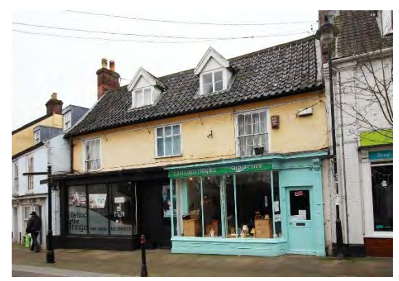
No.48 St Mary's Street

No.48 St Mary's Street (grade II). Eighteenth century, of two storeys and an attic. Black pan tiled roof with two gabled dormers. Painted brick. Three-bay rendered façade with sixteen-light flush-framed sashes to the outer bays and a casement window to the centre. Coved cornice. Midnineteenth century shop front with cornice and consoles. Nos.42 to 56 (even) form a group.