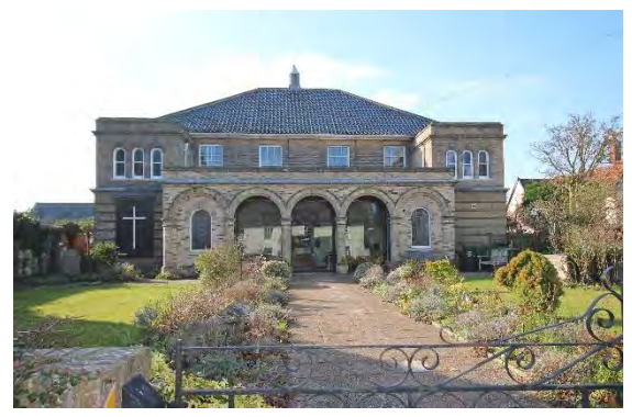
Emmanuel Church, Upper Olland Street

White House, No.32 Upper Olland Street (grade II). A detached late eighteenth century house with later nineteenth century alterations. Until c1885 the manse for the adjoining Congregational Chapel. Altered and extended for William Methuen late nineteenth century. Of two storeys with an attic lit by two casement dormers. Steeply pitched Welsh slate roof, tall red brick chimney stacks with drip bands to gables. Painted red brick with a stuccoed symmetrical three bay façade. Three mullioned and transomed casements at first floor level. Nineteenth century canted bays at ground floor level flanking a six-panelled door reset within a later nineteenth century wooden gabled porch with pilasters. Single storey wing to north. Pan tiled roof slope at rear. Nos.30 to 34 (even), Emmanuel church and Nos.38 to 52 (even) form a group. Honeywood F, Morrow P, & Reeve C, The Town Recorder, A History of Bungay in Photographs (Bungay, 1994) p24.