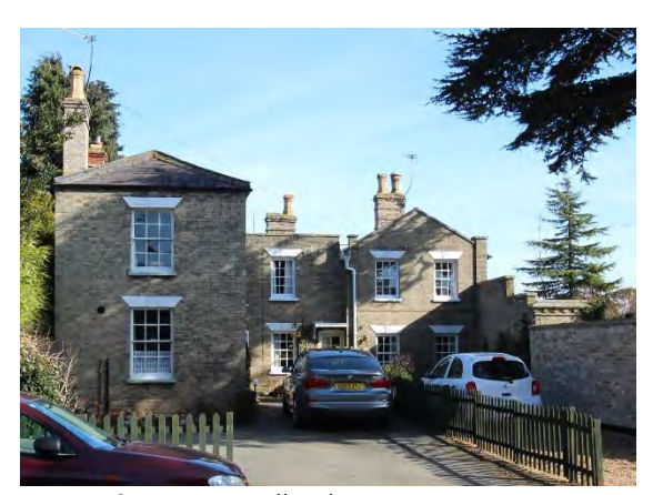
Nos.61 & 63 Lower Olland Street

Boundary wall to north of No.61 Lower Olland Street. A high gault brick mid nineteenth century boundary wall with panels and a stone cap. Curved sections flanking drive entrance at southern end.