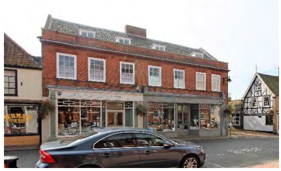
Nos.51-55 (Odd) Earsham Street

No.49 Earsham Street (grade II). Next to No 41. Probably of early eighteenth century date, and of two storeys and an attic. First floor stuccoed, lined and painted and containing two flush frame sash windows with glazing bars. Red pan tiled roof containing two gabled dormers with late twentieth century casement windows. Passage under left with a six-panelled door. Twin square bayed shop front. Nos.39, 41, 49, 55 to 61 (odd) and Nos.65 to 73 (odd) form a group. The rear section of the plot on which this building stands is within the scheduled area of the Castle complex.