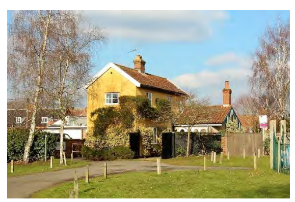
Castle, Cottage, Castle Yard, Castle Orchard

Originally the outer bailey comprised a substantial earthwork bank and external ditch which formed a rectangular enclosure extending to the south of the outer castle ditch. Buildings constructed on the eastern side of the outer bailey have obliterated any surface remains but on the west side the earthworks survive up to around 2.5m high. This area is known as Castle Hills and is an integral component of the early castle defences. Bettley, J, and Pevsner, N, The Buildings of England, Suffolk: East (London, 2015) p.151-153.