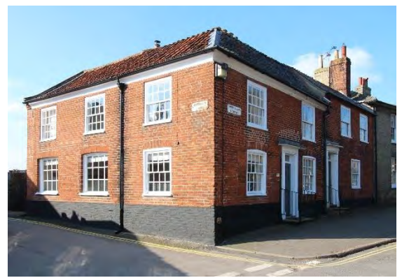
Nos.48 & 50 Upper Olland Street

The Old Maltings, No.46 Upper Olland Street (grade II). An eighteenth century house with a symmetrical early nineteenth century Suffolk white brick façade. Two storeys and three bays with a hipped Welsh slate roof and projecting eaves. White brick chimney stacks. Twelve-light hornless sashes with flat arched lintels. Six-panelled front door with Greek fluted Doric one quarter radius columns to the reveals, below an arched radial-bar fanlight. Return elevation of painted red brick with a single flush framed sash window to the first floor. Pan tiled portion at rear. Nos.30 to 34 (even), Emmanuel church and Nos.38 to 52 (even) form a group.