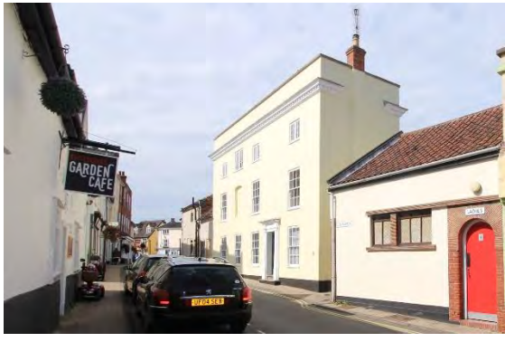
Nos.1-3 Cross Street

See also No.12 Market Place & 2a Trinity Street