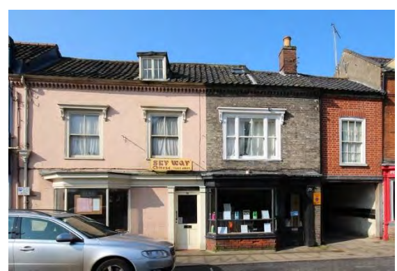
Nos.30-32 St Mary's Street

dormers. Red brick with a black pan tiled roof. No.20 has a shallow later nineteenth century canted splay bay at first floor level with centre glazing bars, and a cornice. Mid-twentieth century splayed shop front. No.22, two flush framed twelvelight sash windows at first floor level with glazing bars and cambered brick lintels. Early nineteenth century wooden shop front with pilasters. Rendered return gable with parapet. To the left a single-bay two storey wing with wide vehicle way under. Heavily repointed red brick. At first floor level a hornless twelve-light sash within a flush frame. Red brick single-storey outbuilding of possibly early nineteenth century date at rear of site close to Castle Orchard. Nos.2 to 22 (even) form a group.