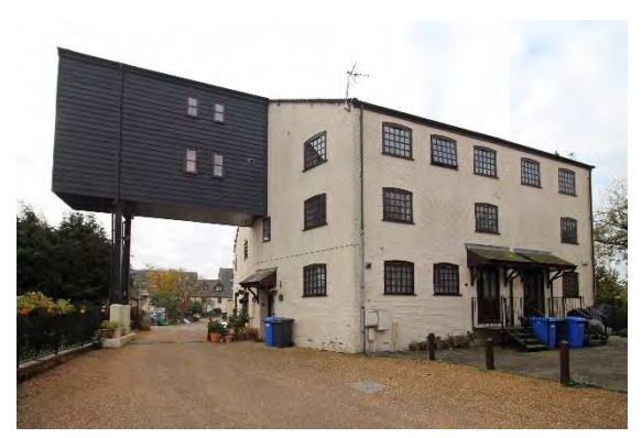
Nos.1-5 The Watermill, Staithe Road

Nos.51 & 53 Staithe Road. (grade II). Originally one early eighteenth century dwelling. Two storey, six bay façade, pebble dash on red brick. Platt band below first floor windows, plinth, and a coved cornice. Black pan tiled roof of steep pitch with overhanging eaves. Four-light sashes in flush frames, rendered flat arched lintels to ground floor windows. No.51, six-panelled door, with an eared architrave and a pediment. No.53, six-panelled door in a wood case with slender pilasters and a cornice. red brick chimney stacks. Subsidiary structures. Boundary walls appear to be later twentieth century red brick.