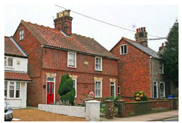
'Laurel Villas', Nos.38-40 Lower Olland Street

Subsidiary Structures Low red brick boundary wall to Lower Olland Street with square-section piers.