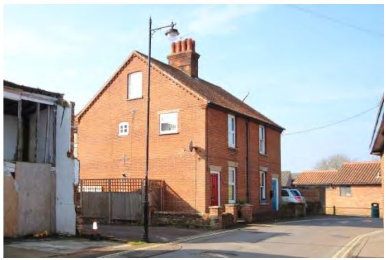
Nos.5-7 (odd) Priory Lane

Nos.24-28 (even) Priory Lane (grade II). A large, early-nineteenth century, detached house, which has been converted into three dwellings. In a sensitive location close to a scheduled ancient monument. Of three storeys, with a symmetrical Suffolk white brick façade of three bays. Return elevations red brick, black pan tiled roof. Sash windows with narrow margin lights and flush frames to first floor. Flatarched lintels. Twentieth century casements to second floor. Two storey one bay wing with side entrances with twentieth century gabled porch to left. Six-panelled door with arched radial-bar fanlight within a wooden doorcase with pilasters and an open pediment. Subsidiary structures Late twentieth century red brick boundary wall and gate piers to Priory Lane not included.