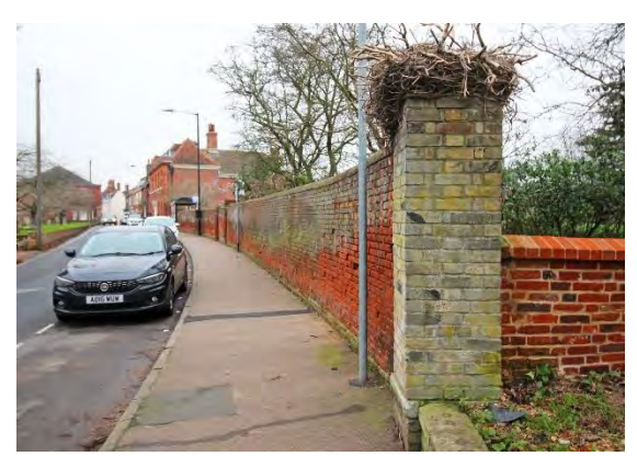
Wall of Garden to Trinity Hall, Trinity Street with pier of Holy Trinity Churchyard walls

No.19 Trinity Street (grade II) A later eighteenthcentury façade to a late seventeenth century structure. Two storeys with an attic lit by three hipped casement dormers, red plain tiles at front, pan tiles at back. Parapet with stone cope, and a moulded brick dentilled cornice. Symmetrical five bay façade to Trinity Street. To the first floor five twelve-light hornless sash windows with flat arched lintels. Central first floor window lintel with a shaped soffit. Five-panelled door, with an elliptical fanlight with curved bars, panelled pilasters, consoles, and an open pediment. Windows to older portion are either sashes in flush frames, or mullion transomed leaded casements. Coved cornice. Lower two-storey wing, two windows, corbelled brick cornice, pan tiles, cambered arches. Interior: some original mantels and wood arched panelled screen. Nos.1 to 19 (odd) form a group. A number of the subsidiary features at No.19 are separately listed. Bettley, J, and Pevsner, N, The Buildings of England, Suffolk: East (London, 2015) p.157.