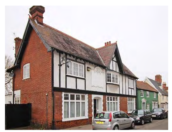
No.28 Upper Olland Street

No.26 Upper Olland Street. Probably of early nineteenth century date but much altered. Painted and rendered red brick. Red pan tiled roof. Three small pane casement windows to first floor. Late twentieth century pedimented doorcase and shop facia. Whilst much of the external joinery has been replaced the openings correspond to those shown on early twentieth century photographs. The building has significant group value with neighbouring properties.