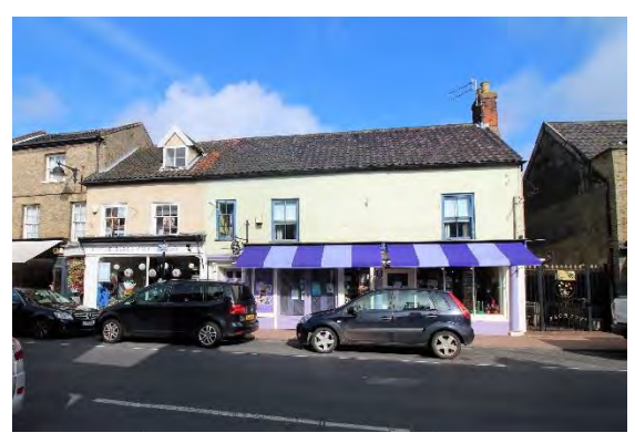
Nos.32-36 (even) Earsham Street

Nos.32-36 (even) Earsham Street (grade II). Eighteenth century two storey and attic, one gabled dormer. Stucco on brick, lined and painted. Pantiles. Five windows, sash, some with glazing bars and flush frames. Fine early nineteenth century wooden shop facia with three Doric columns and entablature, modern glass. Smaller modern shop front, left. Nos. 2-40 (even) form a group. Reeve C, Bungay Through Time (Stroud, 2009) p44.