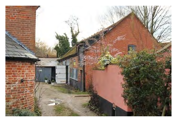
Outbuilding in Wharf Yard, Bridge Street

For the Smoke House located directly behind No.48 Bridge Street see No.48 Bridge Street.