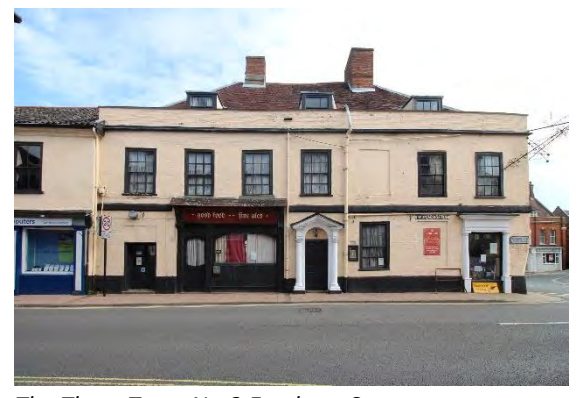
The Three Tuns, No.2 Earsham Street

The Three Tuns Inn, No.2 Earsham Street (grade II). A seventeenth century structure of two storeys and an attic, occupying an island site with façades to Earsham Street, Broad Street and Market Place. The large wing to the left was in retail use by early