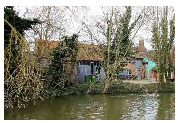
Outbuilding in Wharf Yard, Bridge Street

Outbuilding in Wharf Yard, Bridge Street Nineteenth century workshop range on the western side of Wharf Yard. Of one and a halfstoreys and built in red brick, the lower section tard, red pan tile roof. Boarded doors. Boarded taking-in door to loft space and large central doors to river. Gabled return elevation to Bridge Street with first floor casement window. Single storey projecting range at southern end with corrugated roof. Probably a curtilage structure to the grade II listed No.48 Bridge Street.