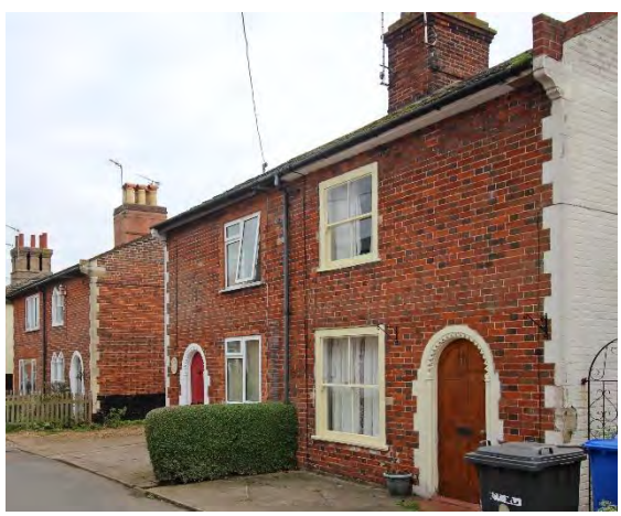
Nos.9 & 11 Southend Road

No.7 Southend Road. A mid-nineteenth century cottage which forms part of a semi-detached pair with the much altered No.5 (not included). Red and blue brick with painted stone dressings and quoins. Shallow pitched Welsh slate roof with deep overhang to eaves. Neo-Norman arched doorcase. Six-paneled door. Pointed arched windows divided by central splayed mullion.