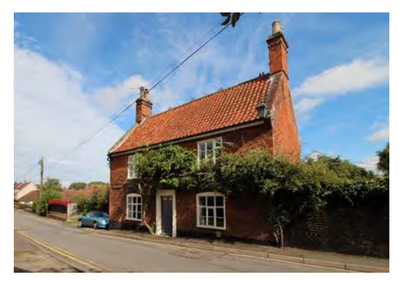
No. 18 Nethergate Street

No.16 Nethergate Street. A detached red brick dwelling of early nineteenth century date. Formerly two houses. Black pan tiled roof with decorative ridge pieces. Tall decorative ridge stacks. Late twentieth century six-panelled door and casement windows within original openings. Flat-arched brick lintels. Late twentieth century flat roofed addition to right and rear.