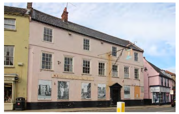
No.2 Market Place

No.2 Market Place and former Odd Fellows Hall to rear (grade II). An early eighteenth century former coaching inn which was until 2015 known as the Kings Head Hotel. It consists of two parallel ranges with a long rear wing facing a courtyard. The Market Place façade is of early eighteenth century date, and of three storeys and seven bays. Of red brick, with a plinth and a dentilled brick eaves cornice. Black pan tiles to roof and a single red brick ridge stack. Seven hornless twelve-light sash windows at first floor level with flush frames and flat arched lintels. Four similar windows to the second floor and six to the ground floor. Off-centre Six-panelled door in wooden Doric case with pilasters, a keyed architrave and a pediment. Return elevation with twin gables. Rear elevation with twelve-light hornless sashes to first and second floors.