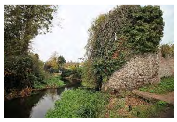
Folly tower, grounds of Scott House, Earsham Street

The extensive gardens of Scott House lay between Castle Lane and the River Waveney to the south and south-west of the house and onto the far bank of the river. The southern- most section beyond the bridleway from Castle Lane to the river has been developed for housing, fine garden walls and a folly tower however survive within the northern section. The gardens are open to the river with a low retaining wall separating the lawn from the water. On the Castle Lane side of the garden is a high boundary wall. The Buildings of England mentions a rockery created in 1844 by John Scott from stones taken from Bungay Priory. Within the gardens a later twentieth century wooden footbridge crosses the river to a wooded section of the house's grounds.