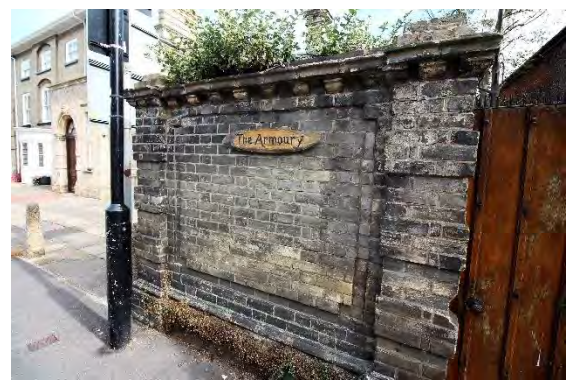
Boundary wall to The Armoury, Broad Street

Boundary wall to The Armoury. Mid nineteenth century gault brick wall with decorative panels between rusticated pilasters. Dentilled cornice and projecting plinth. Flanks the Broad Street garden entrance to The Armoury. For 'The Armoury' itself, see No.10a Nethergate Street.