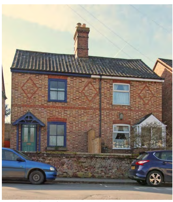
Nos.38-40 (even) Staithe Road

Alexandra Cottages, Nos.34-36 (even) Staithe Road. A semi-detached pair of houses of 1901. Alternate Fletton and red brick façade with elaborate red brick dressings. Black pan tiled roof and central ridge stack to spine wall. Replacement windows in original openings. Twentieth century porches. A relatively early use of Fletton brick. Nineteenth century red brick boundary wall to Staithe Rd.