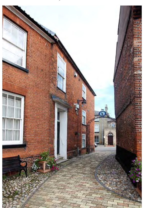
No.10 Earsham Street

No.10 Earsham Street. A red brick two and three storey structure of mid to late eighteenth century date formerly part of the service range of the grade II listed No.12 Earsham Street. Simple wooden doorcase and hornless sash windows. The listed status of this range is not clear.