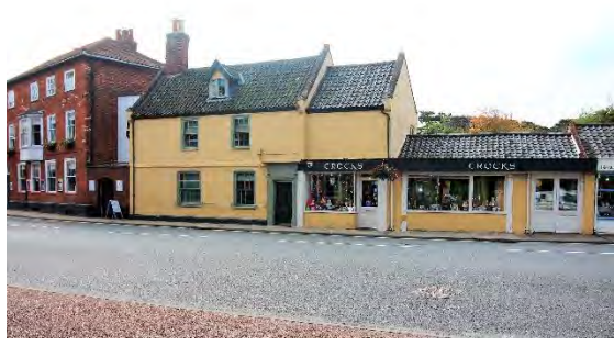
No.7-9 Earsham Street

No.5 Earsham Street (grade II). An early nineteenth century red brick structure with a hipped pan tile roof. Slightly projecting plinth. Brick toothed cornice. Four windows sash with flush frames and flat arches. Three-light sashed wooden canted bay to the first floor flanked by four-pane plate-glass sashes. Nine-light sashes to second floor windows. Modified plate-glass sashes to ground floor. Later twentieth century panelled door with fanlight and flat arch. Former garden entrance to right now leading into a c2010 top-lit single storey addition. Nos.1 to 19 (odd) form a group. The rear section of the plot on which this building stands is within the scheduled area of the Castle complex.