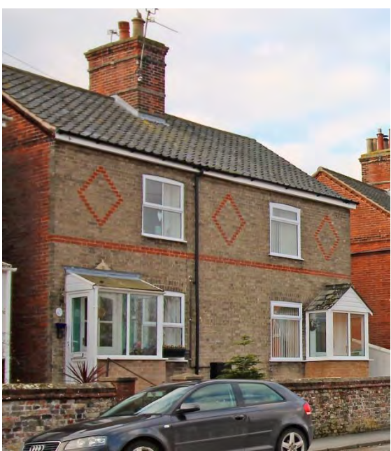
Nos.30-32 (even) Staite Road

Kimberley Terrace Nos.12-28 (even) Staithe Road . Two terraces of red brick cottages of c1902. Gault brick cambered lintels to ground floor windows. Black pan tiled roof. Most external joinery replaced but original openings preserved. Contemporary red brick boundary wall to Staithe Road.