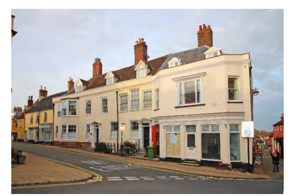
Nos.2 & 4 Broad Street with No.1 Market Place

For the former maltings adjacent to the Fisher Theatre see Nethergate Street