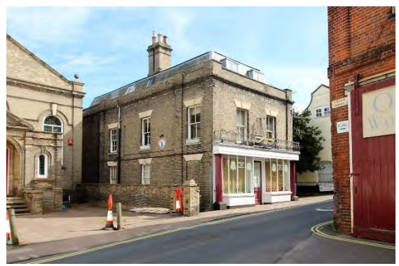
No.7 Trinity Street

Former Wesleyan Methodist Chapel, Trinity Street and boundary wall to Borough Well Lane. Former Wesleyan Methodist Chapel with basement schoolrooms built 1836, re-fronted and refitted 1904. Repaired after 1940 bomb damage, in 1948. Closed 1976, when some fittings were removed to Emmanuel Church. Façades to Trinity Street and Borough Well Lane which are well preserved and retain the bulk of their original joinery and stained glass. Its Trinity Street façade terminates views along Cross Street. Pedimented gault brick façade to Trinity Street of three bays with corner pilasters capped by ball finials. Three arched casement windows with pronounced keystones. Pedimented projecting single storey porch. Elevation to Borough Well Lane of an additional storey and faced in red brick. Tall nineteenth century gault brick boundary wall to Borough Well Lane of considerable townscape value. Red brick retaining walls to rear of lesser interest. Honeywood F, Morrow P, & Reeve C, The Town Recorder, A History of Bungay in Photographs (Bungay, 1994) p17 & 27. Bettley, J, and Pevsner, N, The Buildings of England, Suffolk: East (London, 2015) p.157.