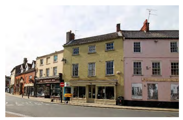
No.4 Market Place

No.4 Market Place (grade II). Early nineteenth century, with a Market Place façade of three storeys and three bays. Hornless sash windows to first and second floors with flat arched lintels. Slightly projecting wooden shop facia with a central entrance Glazing bars to shop facia shown on early twentieth century photos now removed. Brick, limewashed. Wide passage under, left, with a fourpanelled door. Pan tiled roof, brick toothed eaves band. Nos, 2 to 16 (even) form a group. The rear section of the plot is within the scheduled area of the Castle complex. Reeve C, Bungay Through Time (Stroud, 2009) p14.