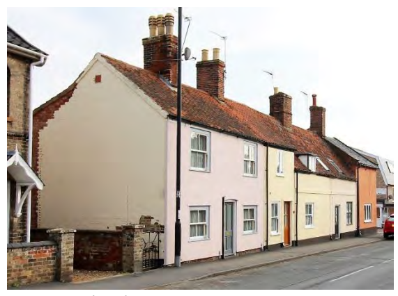
Nos.23-25 (odd) Staithe Road

Pretoria Villas, Nos.19-21 (odd) Staithe Road. Semidetached pair of dwellings faced in white brick dated 1901. Canted wooden bay windows to the ground floor. Tripartite casement sash to first floor of No.19, first floor window to No.21 recently replaced. Dentilled plat band. Black pan tiled roof with substantial ridge stack to spine wall. No.21 has a gabled porch with bargeboards and a spear finial. Subsidiary Structures low nineteenth century wall to front and to side of No.21 the front wall being of gault brick the side wall of red.