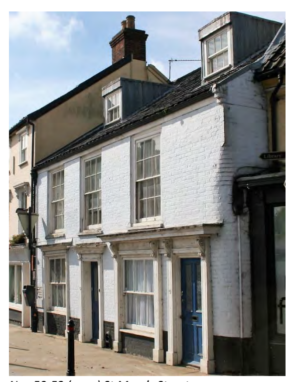
Nos.50-52 (even) St Mary's Street

No.48 St Mary's Street (grade II). Eighteenth century, of two storeys and an attic. Black pan tiled roof with two gabled dormers. Painted brick. Three-bay rendered façade with sixteen-light flush-framed sashes to the outer bays and a casement window to the centre. Coved cornice. Midnineteenth century shop front with cornice and consoles. Nos.42 to 56 (even) form a group.