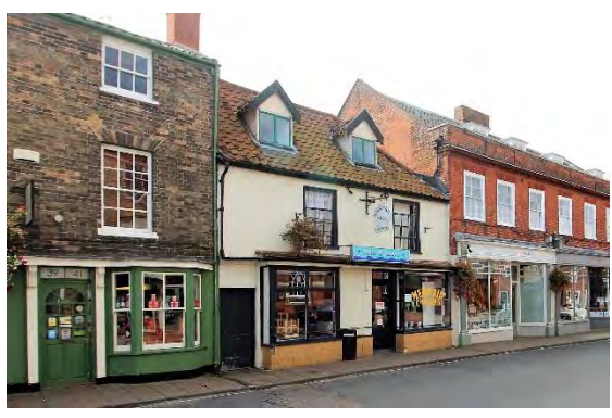
No.49 Earsham Street

The Folly, No.47 Earsham Street. Nineteenth century single storey structure of painted brick set well back from Earsham Street. Twentieth century additions not of interest. Close to the site of the Castle and within the scheduled area of the Castle complex.