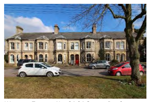
Waveney Terrace, Nos.24-34 Outney Road

Waveney Terrace, Nos.24-34 (even). Outney Road with boundary walls. A terrace of six substantial houses in three mirrored pairs of c1881. Shown on the 1885 1:2,500 Ordnance Survey map. Red brick with a gault brick façade and stone dressings. Welsh slate roof and corbelled eaves cornice. Each house is of two bays, one with a full height canted bay window. The other containing an arched porch with a pronounced key stone. Four-light plate glass sash above. Four panelled doors with glazed arched upper lights. Horned plate glass sashes. Late nineteenth century low gault brick boundary wall with square section gault brick gate piers. Decorative iron railings and gates now removed. Glazed tile paths to front doors of a geometric design. Red brick rear boundary walls and rear elevation. A good example of a speculatively built later nineteenth century terrace retaining the bulk of its original features and joinery. Honeywood F, Morrow P & Reeve C, The Town Recorder, A History of Bungay in Photographs (Bungay, 1994) p143.