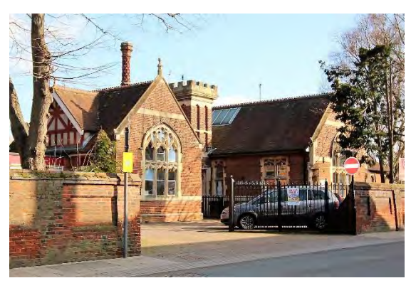
St Edmund's Roman Catholic Primary School

St Edmund's Churchyard Wall, St Mary's Street (grade II) Probably mediaeval, about 8ft high and up to 3ft thick, uncut flint.