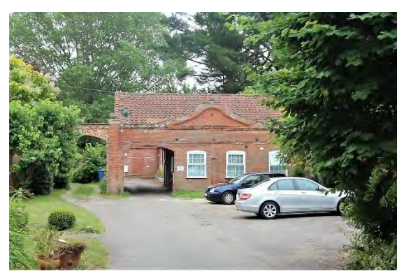
Former outbuildings Bridge House, Bridge Street

Earlier portion at rear, of two storeys and an attic, three dormers with segmental pediments. Brick, rendered. Tiles. Five flush-frame sash windows with glazing bars, and a canted oriel. four-panelled central door in wooden case with consoles. Second door, right, with six flush panels and a pedimented hood. Chateaubriand resided here in 1795 when the house was occupied by the Reverend J Clement Ives. Nos. 2, 4, 6a & 6b, 12 to 20 (even), 24 to 34 (even) 40 to 44 (even), 48 and 50 form a group. Bettley, J, and Pevsner, N, The Buildings of England, Suffolk: East (London, 2015) p.156-157.