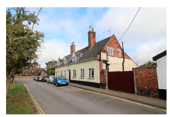
Cherry Tree House, Outney Road

Cherry Tree House, No.4 Outney Road and red brick boundary wall. A former public house, which was in use as such from at least the beginning of the nineteenth century, it closed in the mid twentieth century. Probably of mid eighteenth century date altered c1930. Single storey with attics, rendered red brick façade with quoins and a black pan tile roof. Eight bay street frontage with two doorways and six small paned metal casement windows set back beneath flat lintels. The window openings to the right of the central doorway are not shown on late nineteenth century photographs. Three gabled dormers with late twentieth century casements. Two substantial red brick ridge stacks. Good red brick wall to Outney Road frontage. Reeve C, Bungay Through Time (Stroud, 2009) p49.