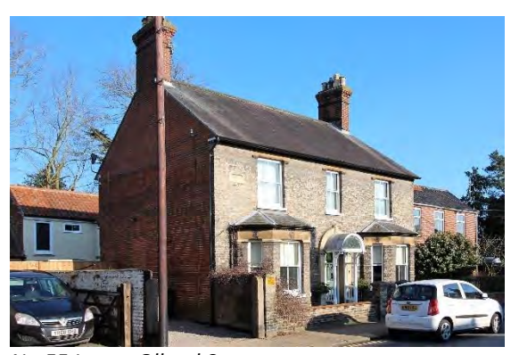
No.55 Lower Olland Street

No.53 Lower Olland Street. The former Ship Inn. A public house from 1791 or earlier, renovated and rendered 1923 when the fenestration was also altered. Closed 1980s. Red pan tiled gambrel roof with a single flat roofed dormer. Roughcast façades with leaded casement windows to first floor. Ground floor windows have had the leaded panes removed. Central partially glazed front door. Lower rear range possibly of early nineteenth century date. Red pan tiled roof. Casement windows. Honeywood F, Reeve C, & Reeve T, The Town Recorder, Five Centuries of Bungay at Play (Bungay, 2008) p166-167.