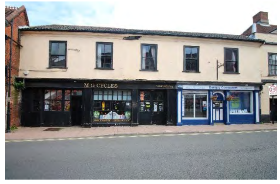
Nos.2a & 2b Earsham Street

Nineteenth and early twentieth century photographs show this flanked by three twelve pane sashes to each side, similar to those surviving above. Mid twentieth century pub facias now partially occupy the ground floor. Three bay Market Place façade with remodelled ground floor. This formerly had a central entrance door in a surround with fluted ionic columns flanked by windows with carved surrounds with pilasters. Interior: barrel vaulted ceiling with original plaster enrichments and cornice, well with date 1540 and old cellars dating from the earlier building which was destroyed in the 1688 fire. Nos.2 to 40 (even) form a group. Bettley, J, and Pevsner, N, The Buildings of England, Suffolk: East (London, 2015) p.154. Honeywood F, Morrow P & Reeve C, The Town Recorder, A History of Bungay in Photographs (Bungay, 1994) p62& 201. Reeve C, Bungay Through Time (Stroud, 2009) p18.