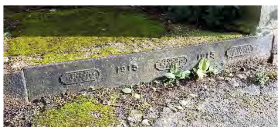
Stair to Nathan's Yard, Castle Lane

No.4 Castle Lane. Two storey red brick with pan tiled roof of both red and black pan tiles. Probably early to mid-nineteenth century but with late twentieth century casement windows. The central two bays probably represent the earliest surviving phase and have a single bay, two storey addition at either end. Ridge stack on former gable end. Forms part of the setting of a section of the scheduled Castle wall.