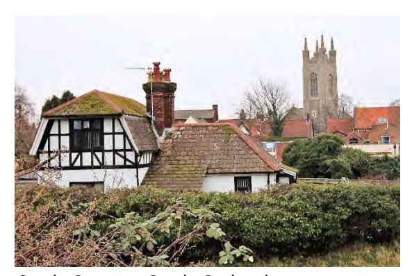
Castle Cottage, Castle Orchard

Outbuilding, The Keep, Castle Orchard. A small red brick and rubble outbuilding with a weatherboarded gable and a black and red pan tiled roof. Probably of mid nineteenth century date. Prominently located within the setting of the scheduled ancient monument.