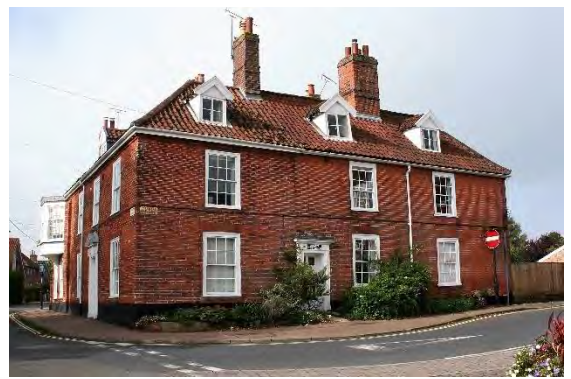
Nos.16 &18 Trinity Street

Wharton Street. Altered first floor sash windows. No.10 and Nos.14 to 18 (even) form a group. Nos.14 to 18 (even) form a group with Nos.9, 11A, 11 Wharton Street.