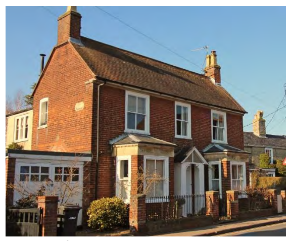
No.3 Wingfield Street

No.1 Wingfield Street. Detached villa of c1900. Red brick with a black glazed pan tiled roof. Stone dressings. Horned sash windows and partially glazed four-panelled door. Twentieth century wooden porch. Canted bay window to western bay of ground floor.