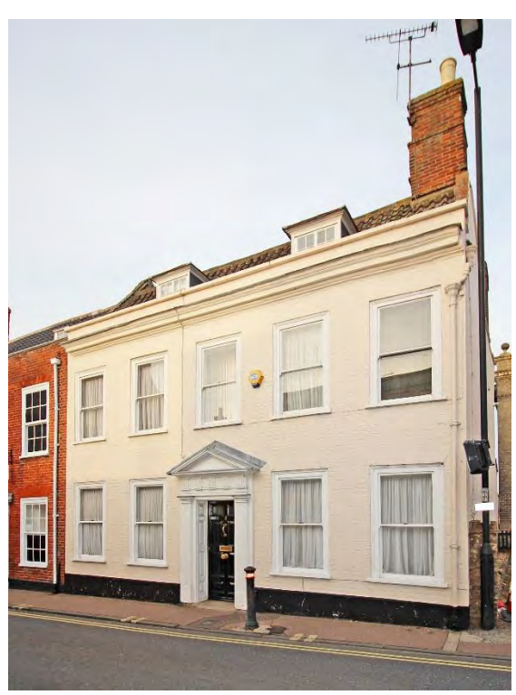
No.5 Trinity Street

Nos.1&3 Trinity Street (grade II). A pair of eighteenth-century houses with a unified seven bay two storey red brick façade to Trinity Street. Attic floor lit by dormers largely hidden behind parapet with a rendered cope. Pan tiled roof. Two false windows painted to look likes sashes. Twelve-light hornless sash windows within flush frames, and beneath flat arches. Where windows have been replaced the replacements have horns. Lead rainwater heads. No.1 has a six-panelled door in wooden Doric case. No.3 with a six-panelled door, panelled reveals, fluted pilasters, frieze with swag enrichment and centre medallion head. Nos.1 to 19 (odd) form a group.