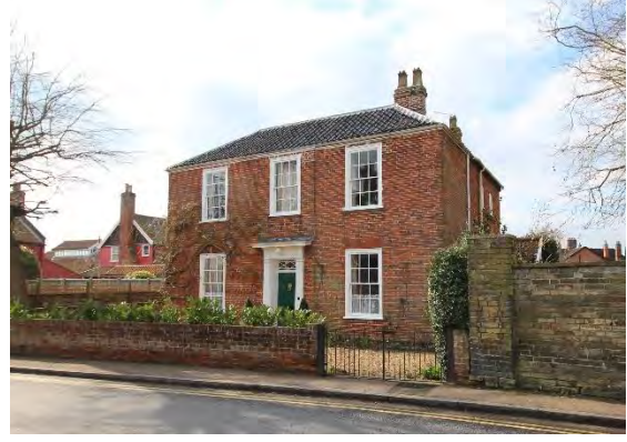
No.10 Trinity Street

Trinity House, No.8 Trinity Street and boundary wall to front. (grade II). An early to mid-nineteenth century villa of two storeys. Faced in Suffolk white brick. Hipped roof with a wide eave's soffit, now covered in late twentieth century machine tiles. Entrance façade of three bays with wide pilasters close to the outer corners. The central bay projects slightly and the windows of the outer bays set in shallow panels. Three hornless sash windows with narrow margin lights to first floor. Flat arched lintels and painted stone sills. Six-panelled door with arched radial-bar fanlight. Doric porch with exaggerated entasis to columns, and an enriched entablature. Porch enclosed at later date with glazed screen and doors. Subsidiary Structures include a nineteenth century Low white brick wall to Trinity Street with twentieth century railings. Four square- section gate piers.