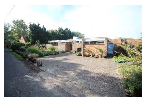
Willow Fen, Castle Lane

See Scott House, Earsham Street (Market Character Area) for garden walls, outbuildings, and folly tower on southern side of Castle Lane. See Market Character Area for Nos. 1-4 and the steps to Nathan's Yard. For No.1 Castle Lane see rear wing of Nos.69-71 (Odd) Earsham Street