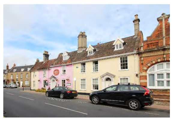
No.18 Earsham Street

No.18a Earsham Street. Former bank c1890, now a dwelling. Built for the London and Provincial Bank Limited. Faced in red brick with elaborate stone dressings and decorative terracotta panels, much original joinery. Of a single storey and two bays, doorway to right in arched opening with fine radial fanlight and panelled door. Large casement window in arched opening to left hand bay. Parapet and Dutch gable. Welsh slate roof. Many late nineteenth century features preserved within. Bettley, J, and Pevsner, N, The Buildings of England, Suffolk: East (London, 2015) p.154.