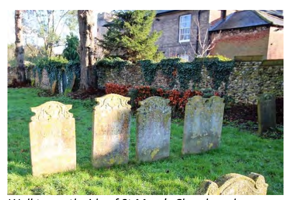
Wall to south side of St Mary's Churchyard