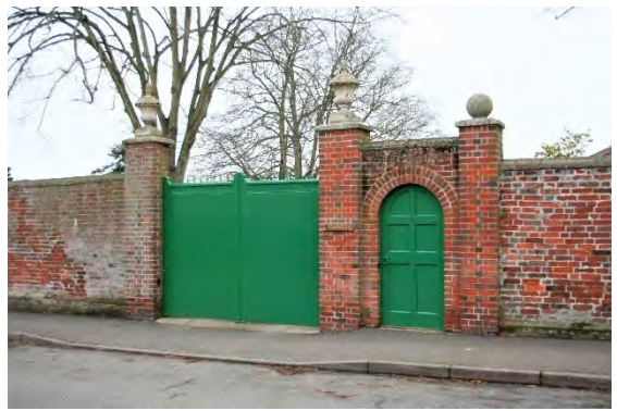
Front Wall of garden to Rose Hall

Front Wall of garden to Rose Hall, No.52 Upper Olland Street (grade II). A later eighteenth century, 7 ft high wall of red brick, with a moulded cope of terra cotta rising to 10 ft on return, with tall square brick piers, one with stone ball on cap, and a pair of stone gadrooned vases on caps, north. Nos.30 to 34 (even), Emmanuel Church and Nos.38 to 52 (even) form a group.