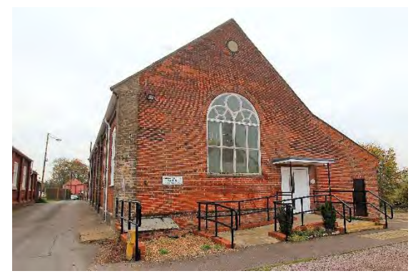
Former Sunday School, Rose Lane

Former Sunday School and lecture Hall, Rose Lane. Sunday School associated with Upper Olland Street Congregational Church built. 1867-69 to the designs of R.M. Marsden for Charles Stokes Carey. Red brick with gault brick dressings and pilasters. Traceried window in north gable and Twentieth century doorway. Return elevations with twelve-light hornless sashes and gault brick pilasters. Black pan tiled roof. Rear addition with wooden glazed roof and leaded coloured lights. Lecture rooms to rear of c1898 designed by JO Rees. Red brick with stone dressings. A prominently located structure at the junction with Rose Lane. Bettley, J, and Pevsner, N, The Buildings of England, Suffolk: East (London, 2015) p.151. Honeywood F, Morrow P, & Reeve C, The Town Recorder, A History of Bungay in Photographs (Bungay, 1994) p15 & p23.