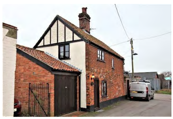
The Bakery, Rose Lane

Boundary wall to Santallen, Rose Lane. A red brick and stone rubble boundary wall of nineteenth century date fronting Rose Lane. Santallen itself is a late twentieth century house which does not contribute positively to the Conservation Area.