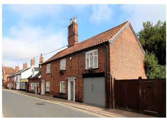
Nos.2 & 4 (even) Chaucer Street

See also No.22 Earsham Street its walls and outbuildings