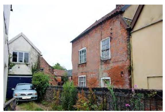
Rear range and outbuildings at No26 Bridge Street

shop windows described in the listing description now replaced by small pane sashes. No.26, stuccoed, with a nineteenth century wooden shop facia with pilasters retaining small glazed panelled windows. Panelled door. A single sixteen-light hornless sash above within a flush frame. Blocked doorway in gabled return elevation.