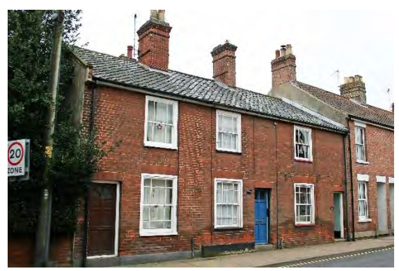
Nos.30-34 (even) Lower Olland Street.

Nos.18 &20 (even) Lower Olland Street. A semidetached pair of early nineteenth century cottages. Red brick with a black pan tiled roof. Three bays wide with, at first floor level, a blind central panel flanked by sash windows. Twelve-light hornless sash window to first floor of No.18 probably the only original survival. The other windows are late twentieth century ones of varying designs. Six panelled front doors.