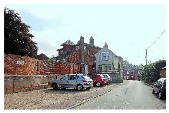
Outney Road elevation and serpentine wall of St Mary's House, No.54, Earsham Street

Eight-panelled door in wooden case with fluted Doric pilasters triglyphs and fret dentil cornice. Wing, to left partly seventeenth century. House built by Giles Borrett. Good early nineteenth century red brick serpentine wall fronting Outney Road. Nos. 54, 56, wing adjoining, walls, and ancillary building together with the bridge over the river Waveney form a group. Bettley, J, and Pevsner, N, The Buildings of England, Suffolk: East (London, 2015) p.154. Reeve C, Bungay Through Time (Stroud, 2009) p41.