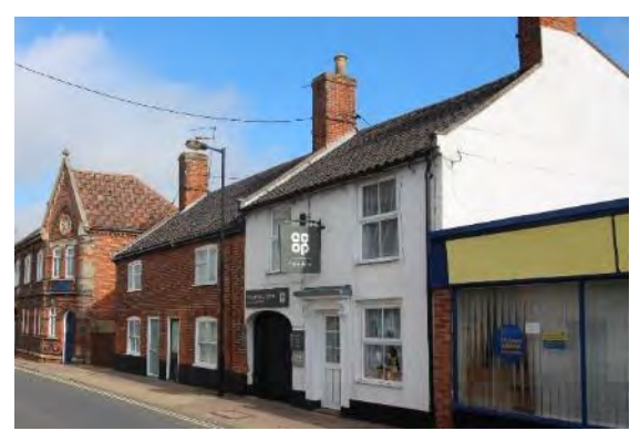
No.12 Chaucer Street

No.6 Chaucer Street. A small red brick structure externally of early to mid-nineteenth century appearance but possibly a re-casing of an earlier structure. Red brick with painted stone dressings and a black pan tile roof. Street frontage range of a single storey and attics, substantial largely nineteenth century rear range of two storeys. Hood moulds to window and door openings, gabled dormer to attic with elaborate bargeboards. External joinery largely replaced. Tall brick chimneystack to left-hand gable. In the nineteenth century the Two Brewers Public House.