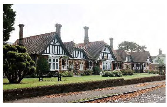
St Edmund's Homes, Outney Road

well-designed late twentieth century iron railings. Twentieth century flat roofed garage facing Webster Street not included.