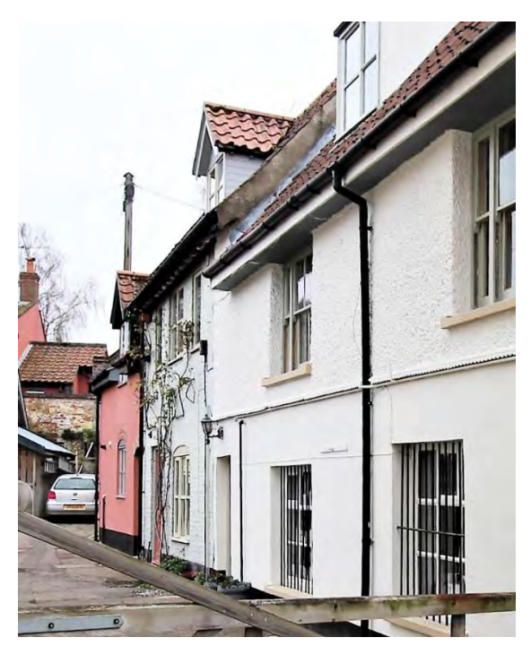
Nos.23-27 (odd) Earsham Street

Nos.23-25 Odd Earsham Street. A pair of altered c1800 cottages standing in a private courtyard to the rear of No.29. No.23 rendered and of a single storey with an attic lit by a gabled dormer. Late twentieth century window joinery. No.25, two storeys of painted brick with casement windows and a weatherboarded gabled dormer. The rear section of the plot on which this building stands is within the scheduled area of the Castle complex.