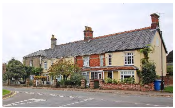
Nos.2-6 (even) Flixton Road

Nos.2-6 (even) Flixton Road and boundary walls. Terrace of three substantial houses c1900, attached to the rear of the larger and slightly earlier No.8. Red brick with stone dressings. Black pan tile roof