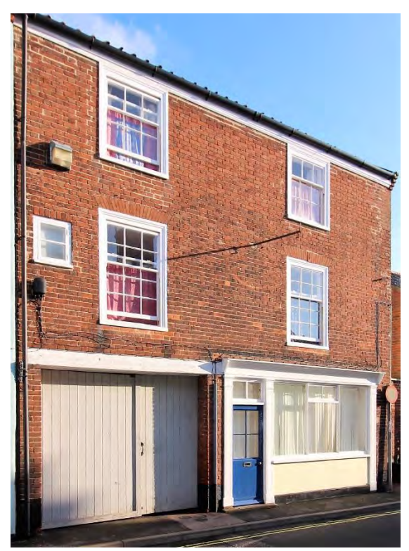
No.11 Upper Olland Street

Ground floor openings beneath segmental arched lintels. Large chimneystack to right-hand gable. Small rebuilt stack to left-hand gable.