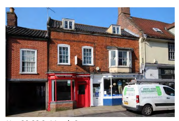
Nos.20-22 St Mary's Street

Nos.20-22 St Mary's Street and outbuilding to rear (grade II). Eighteenth century, of two storeys and an attic which is lit by two flat-roofed casement