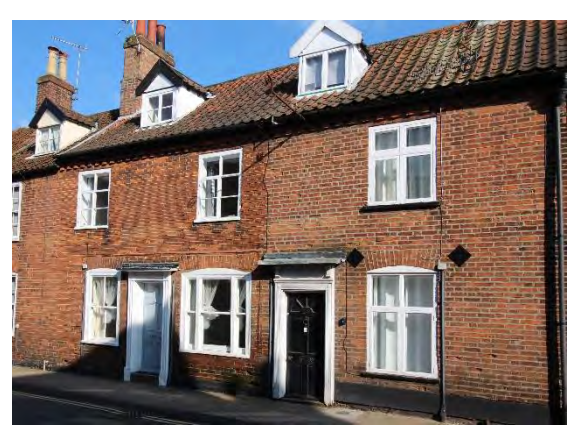
Nos.25 & 25a Upper Olland Street

Nos.21 & 23 Upper Olland Street (grade II) Eighteenth century double fronted structure. No.21 having its entrance in the north elevation. No.21 rendered with a pedimented doorcase and semicircular radial fanlight. Partially glazed fourpanelled door. Two dormers with shallow curved pediments and casement windows. Hornless twelve-light sashes. No.23 in the western or Upper Olland Street elevation. Eighteenth century. No.23 of two storeys and an attic with a single gabled dormer. Red brick with a red pan tiled roof. A single flush framed hornless twelve-light sash to each floor and a six-panelled door within wooden case with a mutular cornice. Nos.21 to 37 (odd) form a group. Subsidiary Structures No.21 has early twentieth century red brick boundary walls to its garden with square section piers.