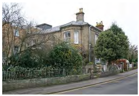
No.8 Flixton Road

with decorative ridge pieces. Mullioned and transomed timber casements with stone hood moulds. Bay window to ground floor f each house with a tile roof continued over door to form a porch. Wooden pillars flanking doors. Subsidiary Structures . Good boundary wall and gate piers of alternate gault and red brick layers c1900. Nos. 4 & 6 with decorative iron railings. The wall to No.2 has been rebuilt but the original piers are preserved. No.2 has a good red brick boundary wall to Rose Hall Gardens. The terrace occupies the site of the medieval chapel of St Mary Magdalene and is thus likely to be of archaeological value.