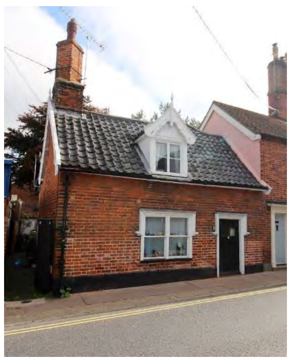
No.6 Chaucer Street

No.6 Chaucer Street. A small red brick structure externally of early to mid-nineteenth century appearance but possibly a re-casing of an earlier structure. Red brick with painted stone dressings and a black pan tile roof. Street frontage range of a single storey and attics, substantial largely nineteenth century rear range of two storeys. Hood moulds to window and door openings, gabled dormer to attic with elaborate bargeboards. External joinery largely replaced. Tall brick chimneystack to left-hand gable. In the nineteenth century the Two Brewers Public House.