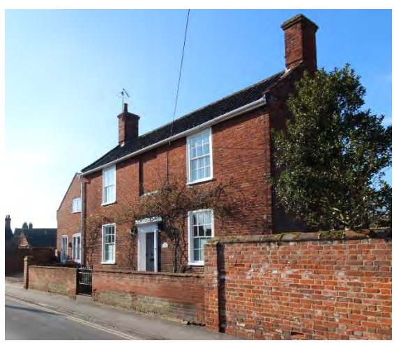
No.9 Wharton Street

Former Fire Station – see Lower Olland Street