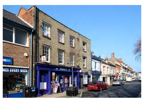
Nos.36-38 (even) St Mary's Street

twentieth century shop front. Red pan tiled roof with casement dormer.