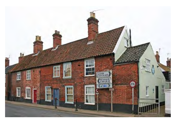
Nos.10-16 (even) Lower Olland Street

Nos.6&8 Lower Olland Street. A semi-detached early to mid-nineteenth century pair of houses with a gault brick façade and rendered red brick return elevations. Black pan tiled roof. Red brick chimney stacks. Three bay façade, with central blind panel flanked by twelve-light hornless sashes at first floor level. Paired four panelled front doors beneath a continuous flat-arched lintel. Wide tripartite hornless sashes to outer bays.