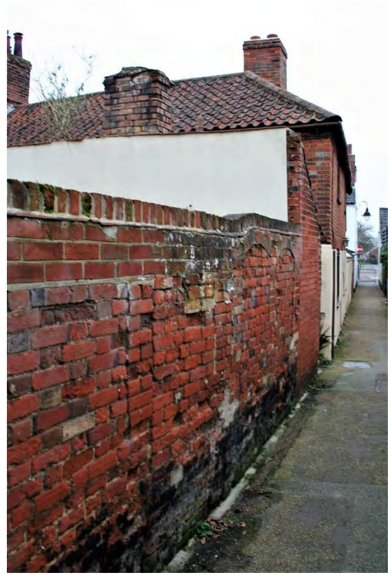
Wall to west of No.8

Outbuilding and Wall to west of No.8. Red brick boundary wall on the north side of Turnstile Lane, incorporating the remains of a partially demolished former cottage. Probably of early nineteenth century date. The structure was partially demolished after the publication of the 1970 Ordnance Survey map.