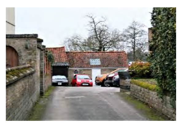
Outbuilding at No.8 Flixton Road