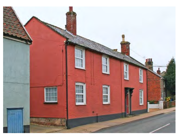
No.48 Lower Olland Street

'Laurel Villas', Nos.38-40 (even), Lower Olland Street. A semi-detached pair of cottages of 1893 built of red brick with blue brick embellishments and stone dressings. red pan tiled roof wit central ridge stack rising from the spine wall. Four- pane horned plate-glass sash windows and partially glazed front doors. Dentilled eaves cornice, string course, and tile panel to centre. Single storey twentieth century additions to rear. Subsidiary Structures Contemporary low red brick boundary wall with square-section piers to Lower Olland Street and northern boundary.