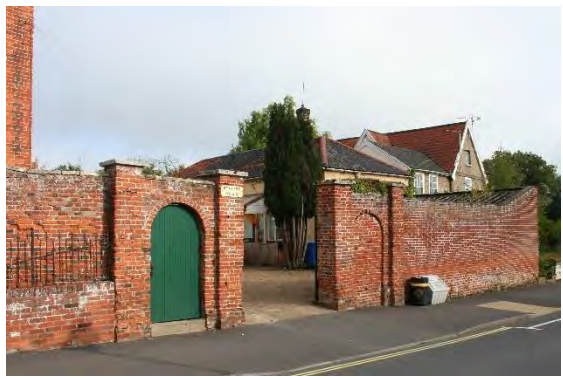
Front wall of courtyard, Trinity Hall, Staithe Rd

Entrance piers of front garden of Trinity Hall Staithe Rd (grade II). A later eighteenth-century pair of red brick piers, flanking the central entrance of the house. Stone caps and ball finials and pedestrian Gate of wrought iron with scroll ornament.