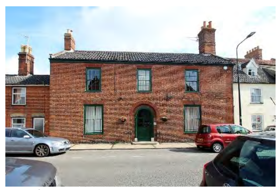
Cransford, No.20 Broad Street

No.18a Broad Street. Probably an early to midnineteenth century reworking of an earlier dwelling. Its Broad Street façade is rendered with a steeply pitched black pan tile roof. A single horned sash window to each floor with margin lights. Six panelled front door, with glazed upper panels. Gabled dormer with casement window and bargeboards. No.18a forms an important part of the setting of the grade II listed Nos.18 & 20 Broad Street.