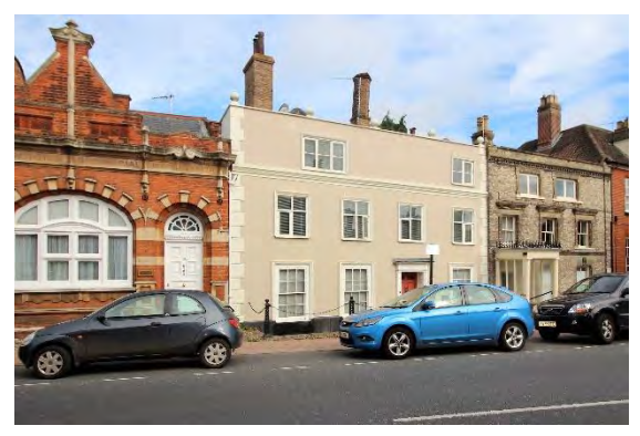
No.16 Earsham Street

No.16 Earsham Street (grade II). A substantial seventeenth century townhouse, which is reputed to have been built in 1620. Three-storey, four-bay, stuccoed façade to Earsham Street with rusticated quoins and a parapet capped by ball finials. Moulded plaster plat band beneath second floor windows, moulded cope to parapet. Four original mullioned and transomed casements with stucco architraves at first floor level. Eight-panelled door, right of centre, in wood case with panelled reveals, pilasters and entablature flanked by twelve-light sashes. Black pan tile roof with gault brick stacks. Some original interior doors. Nb. C1900 photos show the house without the present second floor and parapet but with dormers set within the roof this part of the façade is however evident in c1930 views. Nos. 2 to 40 (even) form a group. Honeywood F, Morrow P & Reeve C, The Town Recorder, A History of Bungay in Photographs (Bungay, 1994) p148.