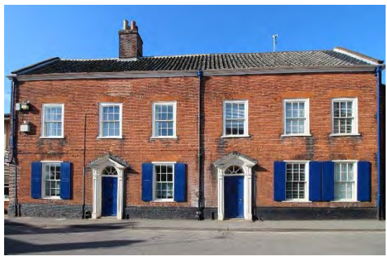
Nos.8-10 (even) Upper Olland Street

No.6 Upper Olland Street (grade II). Early eighteenth century, two storey, red brick. Black pan tiled roof, tumbled gables, and a coved cornice. Full height corner pilasters with moulded caps. Two bay street façade with hornless twelve-light sash windows to the first floor within flush frames. Late twentieth century shop front. Nos.2 to 10 (even) Nos.14, 16 and Nos.20 to 24 (even) form a group