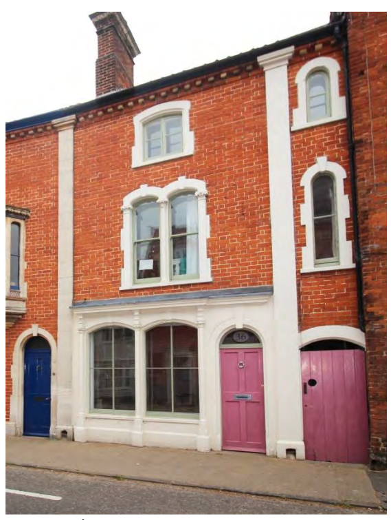
No.36 Bridge Street

No.36 Bridge Street (local list). A substantial later nineteenth century red brick former shop and dwelling with painted stone dressings, dentilled eaves cornice and full height pilasters. Plate glass sash windows. Three storey, two bay principal façade. Arched doorcase with keystone and four panelled door within rendered later nineteenth century former shop facia. Simple semi-circular fanlight. Twin shallow arched windows to left with keystones beneath a corbelled cornice. Passage way with boarded door within shallow arched opening to right. Substantial red brick chimneystack. Forms part of a semi-detached pair with No.36.