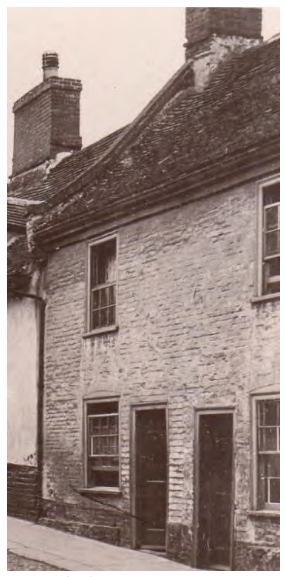
Nos.69-71 (odd), Earsham Street c1910

Nos.69-71 (odd), Earsham Street (grade II). House, formerly three cottages of eighteenth century date, two storey with a lime washed brick façade. Standing on the corner of Castle Lane. Considerably altered since present listing description drafted. Front range facing Earsham Street formerly two cottages with a third in the rear outshot. Earsham Street façade formerly with two small pane sash windows to each floor with flush frames cambered arched lintels to ground floor. Six panelled door in a flush frame, formerly with a similar door to its immediate left. Inserted window immediately above. Roof formerly plain tiled but now covered with red pan tiles. Gabled return elevation to Castle Lane with two sashes. Rear elevation and two storey gabled rear outshot (formerly a separate small cottage No.1 Castle Lane) also visible from Castle Lane. Nos 39, 41, 49, 5l, 61 (odd) and Nos.65 to 73 (odd) form a group.