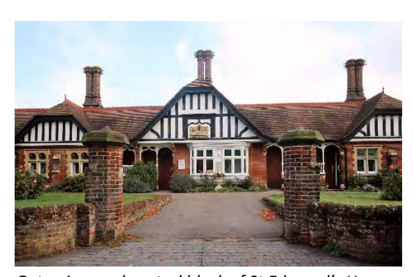
Gate piers and central block of St Edmund's Homes, Outney Road

St Edmund's Homes, gate piers and boundary walls, Nos.8-22 (even) Outney Road. Alms houses of 1895 designed by F.E. Banham and donated by Frederic Smith. Set back from the road within mature landscaped grounds. Symmetrical, vernacular revival style with applied timber framing to the otherwise red brick shell. Of a single story with a plain tile roof and tall paired octagonal shafts to the red brick chimney stacks. Five barge-boarded gables the middle three half-hipped. Windows either two-light stone hood moulded mullions, with casements within, or mullioned and transomed wooden frames. Individual front doors set back within decorative painted wooden verandas with balustrades. Stone quoins to corners. Gabled return elevation of a single bay to Webster Street. Rear elevations significantly altered c1960 possibly by Raymond Erith. Low red brick wall to Outney Road and Webster Street with octagonal gate piers and semi-circular cap. Tall red brick wall to the rear. Bettley, J, and Pevsner, N, The Buildings of England, Suffolk: East (London, 2015) p.155. Archer L, Raymond Erith Architect (Burford, 1985) p151.