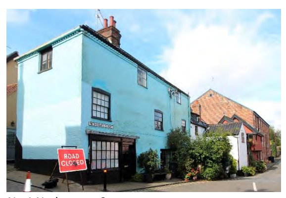
No.1 Nethergate Street

Nos.1 & 3 Nethergate Street. (grade II) On the corner of Bridge Street. No.1 is an eighteenthcentury brick structure of three storeys. Limewashed with a black pan tiled roof which is hipped at its eastern end. Diagonal toothed eaves cornice. Casement windows to second floor with original leaded lights. Sixteen light hornless sashes to first floor beneath cambered lintels. Casement windows to ground floor. Good quality wooden former shop facia with pilasters, glazing bars, and a six-panelled door near the corner with Bridge Street. No.3 (the lower section to the right). Black pan tiled roof with a single small flat roofed dormer. Projecting gabled wing and windows. Nos.1 & 3 form a group with Nos.1 to 5 (odd) Bridge Street