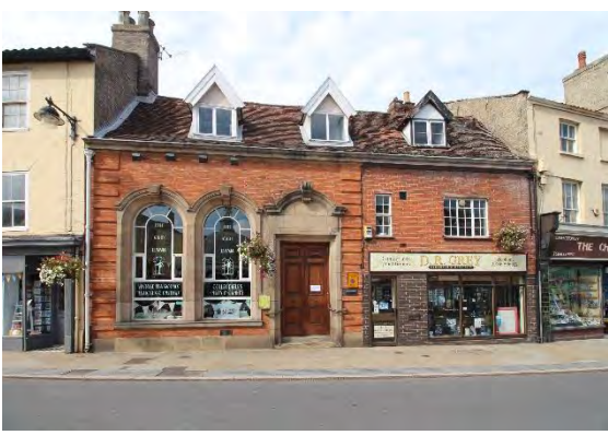
No.8 Market Place

No.6 Market Place. A mid nineteenth century shop with domestic accommodation above. Three storeys and three bays. Faced in gault brick with a painted façade. Nine light hornless sash windows to first and second floors. Second floor with blind central recess. Notable early twentieth century glazed tile shop facia with deep green and chocolate coloured tiles and carved wooden brackets. Decorative brass pilasters to entrance. The rear section of the plot on which this building stands is within the scheduled area of the Castle complex. Honeywood F, Morrow P, & Reeve C The Town Recorder, A History of Bungay in Photographs (Bungay, 1994) p135.