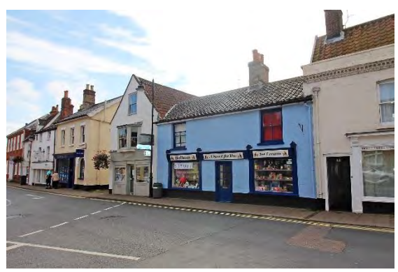
No.31 Earsham Street

No.31 Earsham Street. A mid nineteenth century symmetrical painted brick façade with two, horned, plate-glass sashes at first floor level. Black pan tile roof with gault brick ridge stack. Central partially glazed door flanked by shop facias. Historic photos show the building with small pane sashes to the first floor and ground floor left, the ground floor window having a wedge-shaped lintel. The rear section of the plot on which this building stands is within the scheduled area of the Castle complex.