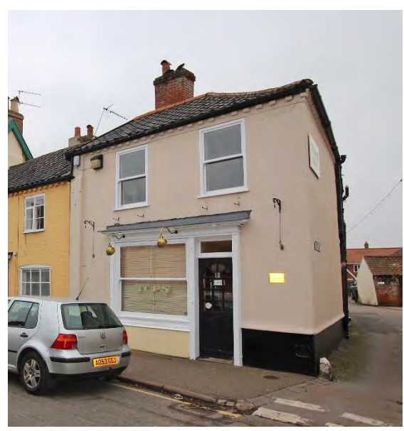
No.18 Upper Olland Street

Nos.14-16 (even) Upper Olland Street (grade II). An early eighteenth century block of two storeys and an attic. Five identical gabled dormers with bargeboards and casement windows. Six-bay façade of painted stucco over a plinth; red pan tiled roof. Twelve-light hornless sashes within flush frames at first floor level. No.14, six-panelled door in wooden case with pilasters, mid-twentieth century wooden shop front right. No.16, small early nineteenth century shop window with cornice. Nos.2 to 10 (even), 14, 16, and Nos.20 to 24 (even) form a group.