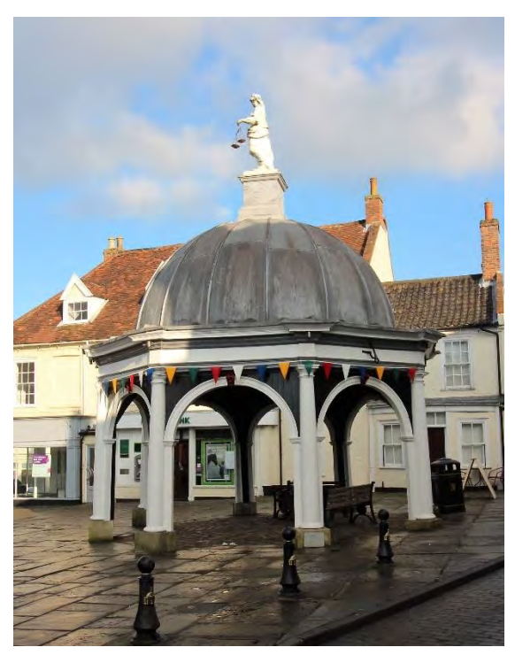
The Butter Cross, Market Place

For Aldeby House, No.1 Market Place see Nos.2-4 Broad Street