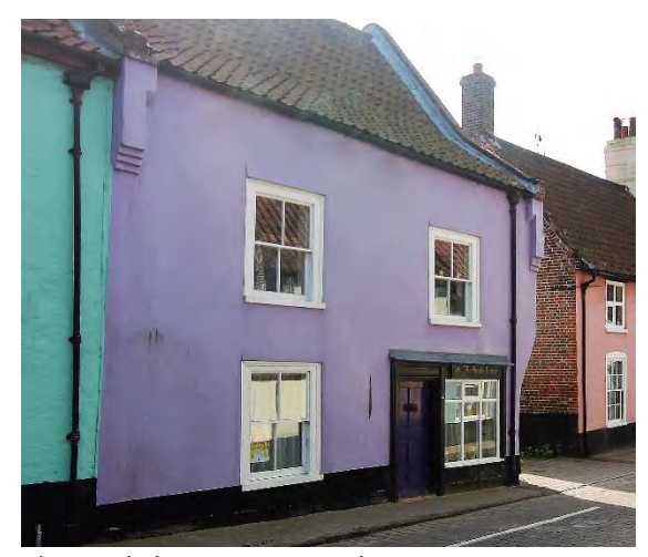
The Smokehouse, No.48 Bridge Street

Nos.40-44 (even) Bridge Street (grade II). A row of three cottages, Nos.42-44 the former Kings Arms Inn and recorded as such in the seventeenth century (closed c1910). Seventeenth century with later alterations, partially re-fronted. Of two storeys and attics. No.40 with black pan tile roof covering, Nos.42-44 red. No.40, is of two storeys and attics and has an early nineteenth century white brick façade with gauged flat arched lintels. A single, late twentieth century flush frame sash window with glazing bars to each floor and late twentieth century front door with original cambered lintel. Flat roofed dormer in roof slope above. Nos.42 and 44 rendered. No.42 with flush frame casement windows. Ground floor openings to No.44 recessed beneath cambered brick arched lintels. One four-light sash and one casement. Twelve-light hornless sash and small casement above. No. 42 has a later twentieth century sixpanelled door, No.44 a partially glazed fourpanelled door. Nos. 2, 4, 6A, 12 to 20 (even), 24 to 34 (even) 40 to 44 (even), 48 and 50 form a group. Honeywood F, Reeve C, & Reeve T, The Town Recorder, Five Centuries of Bungay at Play (Bungay, 2008) p136-137.