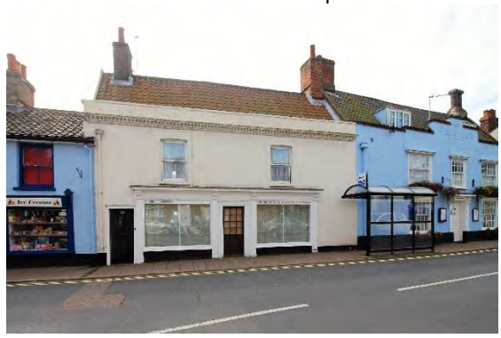
No.33 Earsham Street

No.31 Earsham Street. A mid nineteenth century symmetrical painted brick façade with two, horned, plate-glass sashes at first floor level. Black pan tile roof with gault brick ridge stack. Central partially glazed door flanked by shop facias. Historic photos show the building with small pane sashes to the first floor and ground floor left, the ground floor window having a wedge-shaped lintel. The rear section of the plot on which this building stands is within the scheduled area of the Castle complex.