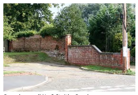
Boundary wall No.3 Staithe Road

No.3 Staithe Road (grade II). A detached house of later eighteenth, or early nineteenth century date. Of two storeys with a gabled attic lit by later windows. Suffolk yellow brick. Black pan tiled roof. Of three bays, the right-hand bay projecting slightly and having a gable. Twelve-light hornless flushframed sash windows. Those to the ground floor having segmental arched lintels. Five-sided canted bay window with casements to ground floor of gabled bay. Six-panelled door with wooden case. Elliptical fanlight Side door in wing wall with elliptical arch. Subsidiary structures to the right, now separated from No.3 by the entrance to a housing development, a red brick boundary wall of nineteenth century date with stone capped squaresection piers. Lower twentieth century section directly by street. Low painted brick retaining wall to front.