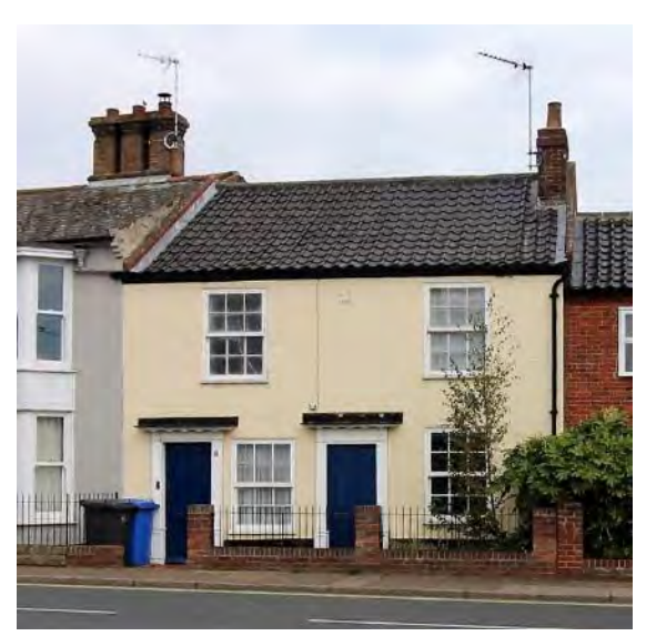
No.11 St John's Road

No.9 St John's Road. House of early to midnineteenth century date. Of painted red brick. Black pan tiled roof. Red brick stack of three linked grouped shafts to ridge. Two storey wooden canted bay window with four-pane plate-glass sashes. Doorcase with corbels. Twentieth century partially glazed door. Window above door with corbelled hood and pilastered frame.