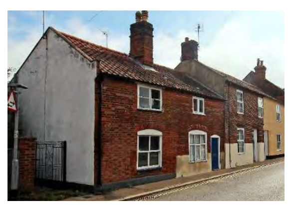
No.28 Chaucer Street

stack on return elevation of a highly decorative design. Left hand bay has cart entrance into a central courtyard. Lower late twentieth century rear range faced in red brick with a weatherboarded first floor. Bettley, J, and Pevsner, N, The Buildings of England, Suffolk: East (London, 2015) p.155. Honeywood F, Morrow P & Reeve C, The Town Recorder, A History of Bungay in Photographs (Bungay, 1994) p149.