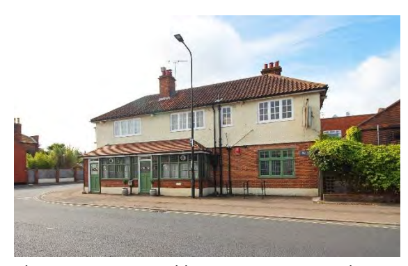
The Green Dragon Public House, No.29 Broad Street

No.21 Broad Street. Formerly a pair of early nineteenth century cottages, now a single dwelling. Red brick with a dentilled eaves cornice and a black pan tiled roof. Boarded door at northern end and a blocked door opening at the southern end. Twentieth century casement windows. Despite alteration this dwelling contributes positively to the adjoining grade II listed Nos.15-19 (odd).