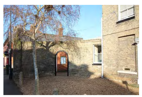
Forecourt Wall to No.16 Broad Street

Forecourt Wall to No.16 Broad Street (grade II). Early nineteenth century, curved on plan, yellow brick screen wall about eight feet high with stone cope and arched doorway, and with square pier with damaged stone finials.