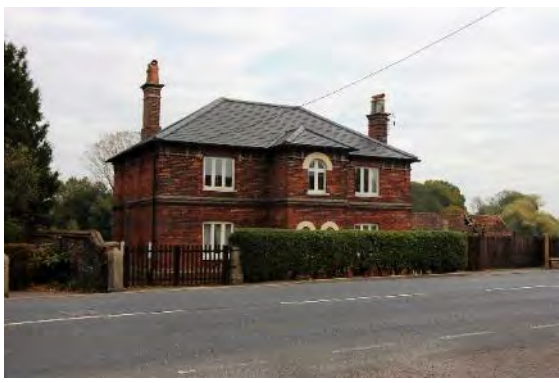
No.55 St John's Road

floor. The full height gabled and jettied porch projection has a similar first floor window and a small sash in the gable. The oak door is in original condition, divided into ten panels by moulded battens, in heavy moulded frame with enriched stop-chamfer. Original wooden case lock, bolts and fittings remain. Twentieth century multiple splayed bay window to ground floor, right. The stair is a fine example of the period in oak with turned balusters, moulded rail, strings, and newels. No. 53, has its entrance on the south-eastern face, it is of two storeys and an attic which is lit by a window within the gable. Timber-framed and plastered, mullioned and transomed casements, (one blocked but showing frame). The St John's Road façade has hornless sash windows in flush frames in the gabled wing. Six-panelled door with an arched radial bar fanlight. Twentieth century bay window ground floor. Good Adam type mantel. Bettley, J, and Pevsner, N, The Buildings of England, Suffolk: East (London, 2015) p.158.