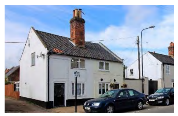
Nos.11-13 (odd) Broad Street

No.1a Broad Street see Earsham House No.12 Earsham Street.