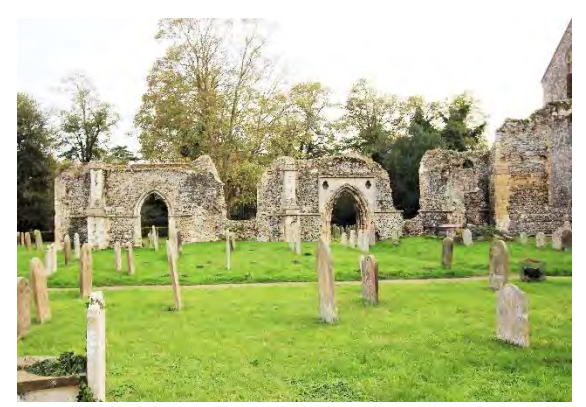
Benedictine Abbey Ruins, St Mary's Street