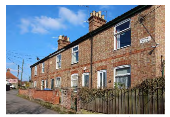
Sunnyside Cottages, Nos.55-63 (odd) Southend Road

with centrally placed doors flanked by casement windows. Doors set back beneath flat arched lintels. Nos. 51 & 53 appear to retain their original casement windows. Shown on the 1885 1:2,500 Ordnance Survey map. No.47 has a later twentieth century flat roofed garage addition.