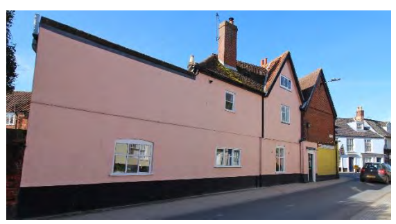
No.2 Lower Olland Street

No.2 Lower Olland Street (grade II). Early seventeenth century. This building interlocks with Nos.1 and 3 Upper Olland Street, qv, and incorporates part of a sixteenth century structure. Of two storeys and an attic. Tiles and pan tiles. Mock half timberwork painted on cement rendering. three-light casement window within gable, two-light casement at first floor level, mullioned and transomed casement to ground floor. Six-panelled door (entrance under left of No.56 St Mary's Street) with architrave convex frieze and cornice. 2'storey wing, left, brick, painted, includes small casement at each floor. No.2 forms part of a group with No.56 St Mary's Street and Nos. 1, 3 & 3a Upper Olland Street. Subsidiary structures. Fine panelled red brick garden wall to south fronting onto Lower Olland Street. Dentilled cornice beneath semi-circular brick cap. Blue brick embellishments.