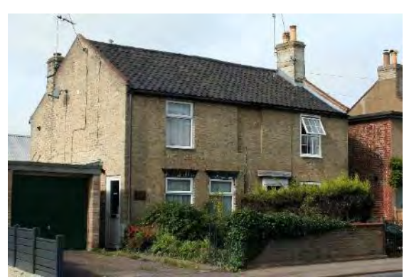
Nos.14 & 16 St John's Road

crenelated early twentieth century red brick boundary wall to the street. All other walls appear to be of late twentieth century date.