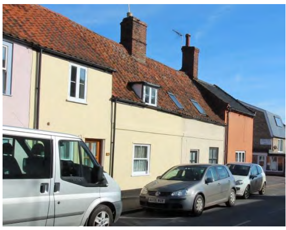
Nos.27 -29 (odd) Staithe Road

Nos.23-25 (odd) Staithe Road. Small rendered pair of cottages of c1800 forming an important part of the setting of the grade II listed. No.23 with central four-panelled door flanked by horned sashes. No.25. Horned sash to ground floor and twentieth century top-lit boarded front door. Twentieth century casement above in earlier opening. Red pan tiled roof. No.23 extended to rear.