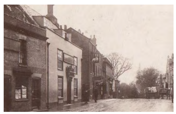
The Castle Inn, No.35 Earsham Street c1910

Small pane horned sash windows to the ground floor with similar hornless windows above. Sixpanelled door, set within simple wooden doorcase with console brackets. Window above inserted in early to mid-twentieth century. Black pan tile roof with two large flat roofed dormers. Twin gabled return elevation, the front gable crowned by massive gault brick stack with two octagonal flues. Two, small late-twentieth century horned sashes to the front range, and three casements to lower rear range. Further red brick ridge stack of late nineteenth or early twentieth century date. A refronting of an early eighteenth century but much altered building. At the rear facing the Castle is a lower parallel range with a red pan tiled roof and nine light casement windows which dates from c1800.