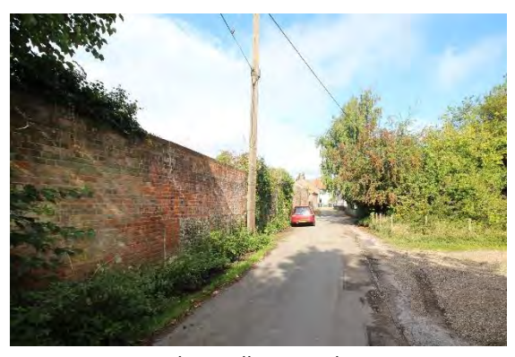
Scott House, garden walls to Castle Lane

Fronting onto Castle Lane the walls are largely of red brick and probably of mid nineteenth century date.