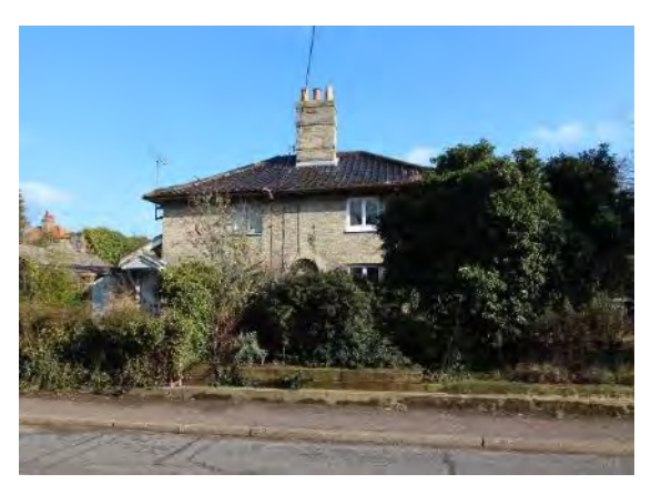
Autumn Cottage, No.13 Flixton Road

No.11 Flixton Road (grade II). An early nineteenth century two storey, Suffolk yellow brick, villa, greywashed. Hipped black pan tiled roof and wide eaves. Two sixteen-light hornless sash windows with flush frames, at first floor level. Two canted and sashed bays to ground floor. Small wings with blank arched panels. Six-panelled door. Wooden Doric porch. Nos.9 to 13 (odd) form a group.