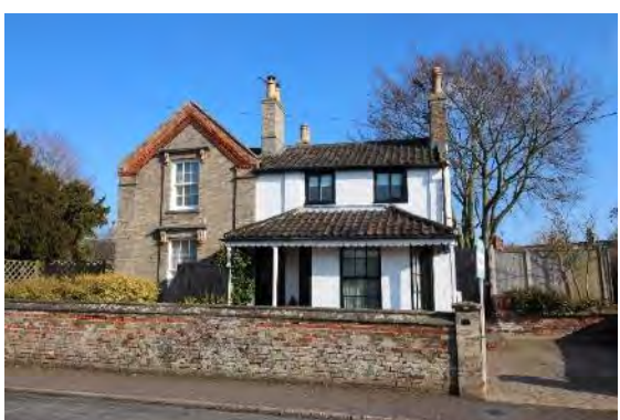
No.5-7 Flixton Road

Nos.1 & 3 Flixton Road, walls and gate piers. A semidetached pair of houses prominently located at the junction of Bardolph and Flixton Roads. Also visible from Laburnum Road. Shown on the 1885 Ordnance survey map and probably dating from c1870. Gault brick with a Welsh slate roof. Decorative corbelled eaves cornice, pilasters, and two storey canted bay windows. Original plate glass sashes largely preserved. Subsidiary Structures Good contemporary gault brick gate piers and low boundary wall. Tall nineteenth century red brick wall to Laburnum Road.