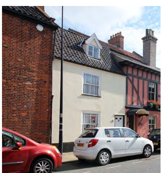
No.18a Broad Street

Long range of attached outbuildings backing onto Brandy Lane which are probably of early eighteenth century or earlier origins, although at least partially rebuilt. Painted red brick with red pan tile roofs. Range nearest Broad Street of two storeys with boarded taking-in door at first floor level. Twentieth century dormers. Central range of narrow red bricks with a steeply pitched red pan tile roof. Single storey with attic and elaborate tumble or diaper work to gable ends. Blocked taking-in door to gable facing Nethergate Street at attic level. Lean-to addition to garden side. At the Nethergate Street end is an extensive rebuilt structure now with a flat roof and blocked door and window openings to Brandy Lane and a large garage opening to Nethergate Street.