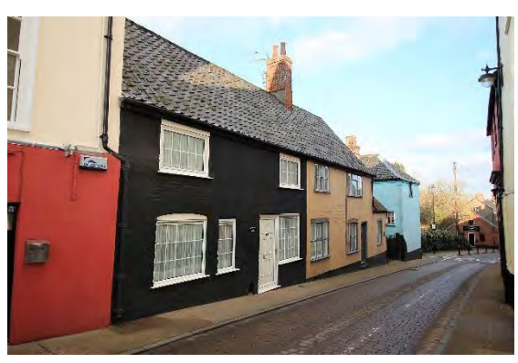
Nos.1 & 7 (Odd), Bridge Street

For Aldeby House, No.1 Market Place see Nos.2-4 Broad Street