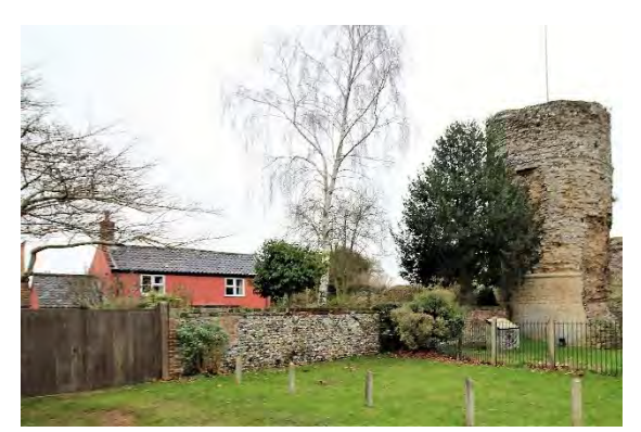
Keeper's Cottage, Castle Orchard

Keeper's Cottage and boundary wall, Castle Orchard (standing on scheduled land). A nineteenth century cottage with extensive later twentieth century alterations and additions, built within the remains of the Castle complex and within the scheduled ancient monument. Its rear retaining wall is part of the Castle wall. Original cottage has rendered walls and a black pan tiled roof. Red brick ridge stack. Two storeys with a single storey wing. Twentieth century flat roofed porch. Return gable with twentieth century timber oriel window to first floor. Lower red pan tile roofed range to rear. Twentieth century casement features. windows. Subsidiary Good nineteenth century flint wall.