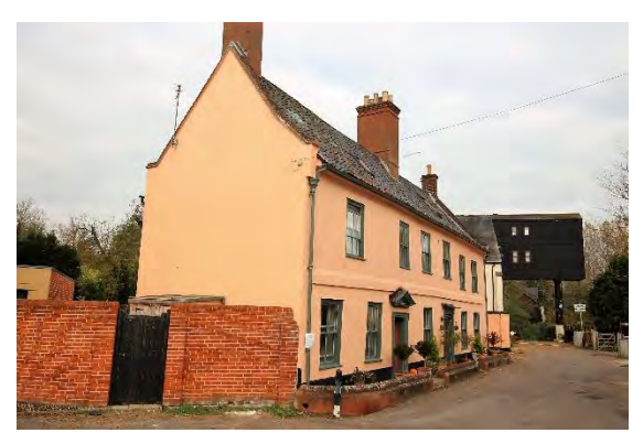
Nos.51 & 53 Staithe Road

Nos.51 & 53 Staithe Road. (grade II). Originally one early eighteenth century dwelling. Two storey, six bay façade, pebble dash on red brick. Platt band below first floor windows, plinth, and a coved cornice. Black pan tiled roof of steep pitch with overhanging eaves. Four-light sashes in flush frames, rendered flat arched lintels to ground floor windows. No.51, six-panelled door, with an eared architrave and a pediment. No.53, six-panelled door in a wood case with slender pilasters and a cornice. red brick chimney stacks. Subsidiary structures. Boundary walls appear to be later twentieth century red brick.