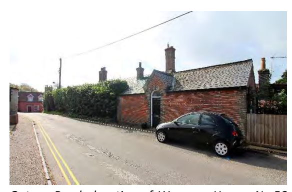
Outney Road elevation of Waveney House, No.56 Earsham Street

Early eighteenth century red brick walled garden fronting onto Outney Road, 14 to 18 feet high with brick on end sloping cope, and with panels formed by brick pier buttresses and stepped plinth or splayed base widening. Cope rounded on outer side above band with toothing. Nos. 54, 56, wing adjoining, walls and ancillary building together with the bridge over the river Waveney form a group.