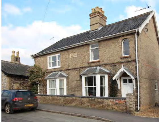
Pretoria Villas, Nos.19-21 (odd) Staithe Road

Dreyers Almshouses, Nos.9-17 (odd) Staithe Road (grade II). Single storey alms house block of 1848 faced in square knapped flint with gault brick dressings. Endowed by Eliza Dreyer for the widows of poor tradesmen. Seven-bay façade with gabled porches, outer bays gabled and slightly projecting. Gothick casement windows with three pointed lights. Octagonal shafts to chimneys with capping and drip moulded bases. Plinth. Near-flush-frame doors with cambered arches. Inscribed stone tablets in flank gables with date. Roof of octagonal Welsh slates, bargeboards with spear finials. Further gabled porches to return elevations.