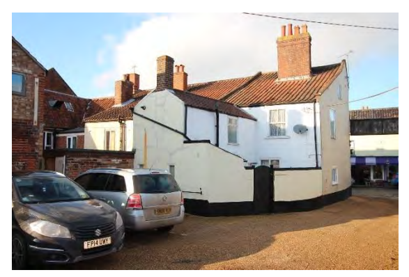
Rear elevation of No.37 Earsham Street