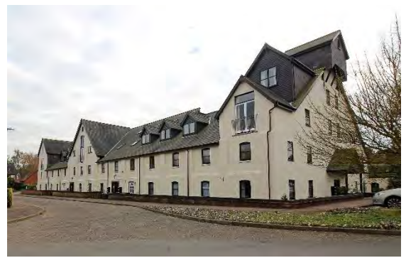
Nos.1-23 (cons) The Maltings, Staithe Road

Nos.1-5 The Watermill, Staithe Road). Former provinder (or animal feed) mill of 1902 built for the Marston family, closed c1956 and now converted to apartments. Wheel and machinery removed. Its watercourses have been partially filled in and turfed over. Painted brick and weatherboarding. Twentieth century wooden casement windows. The site has long been occupied by water powered mills, the previous one being destroyed by fire c1900.