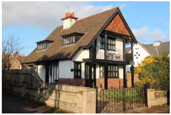
No.14 Scales Street

No.12 Scales Street. Former drill hall now car repair workshop. Probably designed and built by John Doe architect and builder of Bungay and dated 1906. Used primarily by the 2nd Volunteer Battalion Norfolk and 5<sup>th</sup> Battalion Suffolk Regiments. Single storey red brick with Welsh slate roof formerly with tall leaded ventilator on ridge. Iron roof with tie rods. Gabled elevation to Scales Street with central circular former window with stone decoration in the form of four keystones. Mullioned and transomed wooden casement windows.