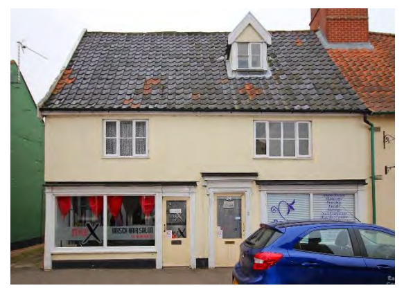
No.24 Upper Olland Street

Nos.22-24 (even) Upper Olland Street (grade II). A seventeenth century structure of two storeys and an attic. Steeply pitched red pan tiled roof containing a single gabled dormer to No.22, No.24 with a black pan tiled roof and a similar dormer. Rendered red brick to timber framed core, plinth. Massive red brick ridge stack rising from spine wall. No.22 with twentieth century casement windows and shop facia. Dentilled eaves cornice. No.24 has casement windows at first floor level. Central late twentieth century glazed door within a wooden doorcase with an eared architrave. Good shop fronts to either side which are possibly of early nineteenth century date. Nos.2 to 10 (even), 14, 16, and Nos.20 to 24 (even) form a group.