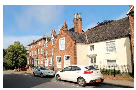
No.48 Earsham Street

No.44 Earsham Street. An early nineteenth century terraced house formerly attached to the hall of Bungay Grammar School but now free standing. Red brick, which was formerly rendered, with external joinery sympathetically replaced late twentieth century. Edwardian photographs show that the first-floor window was formerly of three lights with small leaded panes within. The door had glazed upper panels as today.