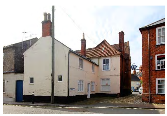
No.8 Earsham Street from Broad Street

fanlight, 3/4 columns triglyphs and open pediment. The rear range of No.8 is painted and is visible from both Broad Street and Cork Bricks. It is slightly lower in height and has a symmetrical façade to Cork Bricks with a central doorway. Black pan tiled roof, dentilled brick eaves cornice and casement windows. Nos.2 to 40 (even) form a group. Bettley, J, and Pevsner, N, The Buildings of England, Suffolk: East (London, 2015) p.154.