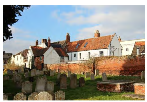
Churchyard elevation of Nos.2 & 4 Cross Street

Nos.2 & 4 Cross Street (grade II). Of later seventeenth century date with nineteenth century alterations. Of two storeys, with an attic lit by three gabled dormers. Roughcast on brick, with a coved cornice. Black pan tiled roof slope to Cross Street façade and red to the churchyard. Five mullioned and transomed casement windows at first floor level, and a near flush framed hornless sash window with glazing bars. No.2, has a late nineteenth century former pub facia of wood with pilasters to the right-hand bay (former Crown Inn), its other shop facia is probably a later twentieth century copy. No. 4, also has a late twentieth century shop front in the style of that of No.2. At the rear of No.2 a two-storey red brick eighteenth century range with a red pan tile roof and a single casement window at first floor level which abuts No.15 Market Place. The rear elevation which is visible from Saint Mary's Churchyard forms an important part of the setting of the grade I listed church. Honeywood F, Morrow P & Reeve C, The Town Recorder, A History of Bungay in Photographs (Bungay, 1994) p158. Honeywood F, Reeve C, & Reeve T, The Town Recorder, Five Centuries of Bungay at Play (Bungay, 2008) p141.