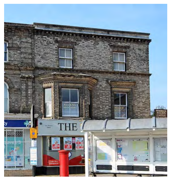
No.2 St Mary's Street

No.2 St Mary's Street. A red brick house and shop of c1800, re-fronted and partially rebuilt in Suffolk white brick c1870 probably to the designs of William Oldham Chambers of Lowestoft who designed the adjacent façade to the south. Three storey white brick façade of two bays, with canted bay to first-floor left. Horned plate-glass sashes. Parapet with dentilled cornice. Late twentieth century shop facia. Early nineteenth century red brick range to rear with hornless sashes. Some windows with glazing bars removed. Taller two bay mid-nineteenth century red brick addition with plate-glass sashes. Flat-arched lintels and stone sills. Hipped roof with overhanging eaves. Return elevation rendered.