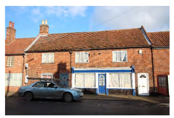
No.30 and 30a Broad Street

Nos.22-24 (even) Broad Street. A terrace of three two storey cottages, now two. Faced in red brick with gault brick lintels to door and window openings. Late twentieth century black pan tile roof covering. Red brick ridge stack to spine wall between cottages. A further ridge stack has probably been removed. No.22 has metal casements within original window openings and a glazed metal door. No.24 with four light horned sashes in heavy moulded frames. Return elevation has red brick lintels to openings and plain bargeboards. This short terrace forms an important part of the setting of the grade II listed Nos.20 and No.18.