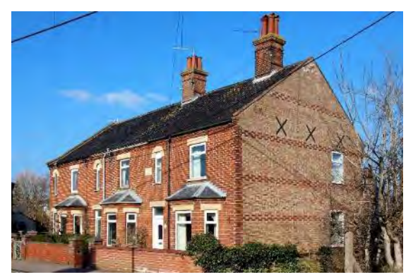
Nos.17-21 odd St John's Road

brick wall with square-section piers and decorative early twentieth century railings.