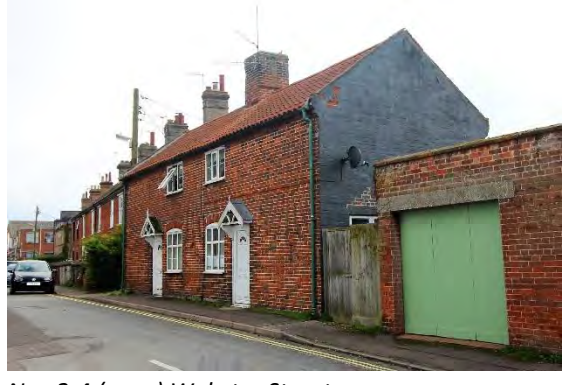
Nos.2-4 (even) Webster Street

St Edmunds Homes see Outney Road and No.6 Outney Road