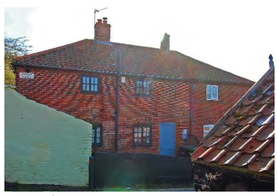
Nos.11 & 15 Quaves Lane

See also No.54 St Mary's Street and No.2 Upper Olland Street.