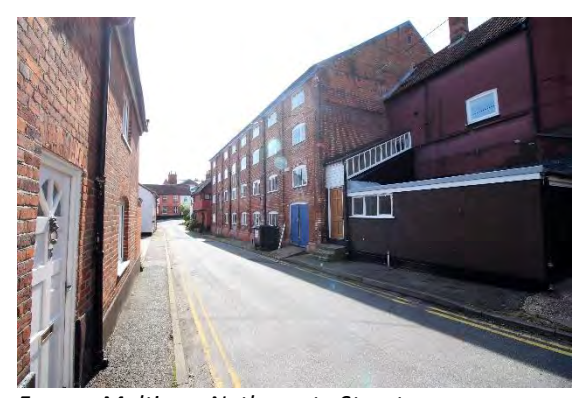
Former Maltings, Nethergate Street

Former Maltings, Nethergate Street. A former maltings of c1900 date, with elevations to Nethergate Street and a courtyard off Broad Street. A rebuilding of an earlier maltings complex. The present structure postdates the 1885 Ordnance Survey map but is shown on that of 1905. Four storeys to Nethergate Street and two to Broad Street. Red brick with a blue corrugated metal roof. Nethergate Street façade of seven bays divided by pilasters. Casement windows and boarded doors beneath cambered brick lintels. The Broad Street façade has similar casements and is also divided by pilasters.