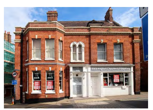
No.3 Market Place

No.3 Market Place (grade II). Former Queen's Head Inn, altered to form bank and manager's house in the late nineteenth century, now shops. Late seventeenth or early eighteenth century with a later nineteenth century red brick façade. The Buildings of England suggests an original building date of 1698. Of two storeys and attics. Market Place façade of three bays with corner pilasters and a parapet. Left hand bay with a two-storey canted bay window. Plate-glass sashes with gauged flat arches and ornamental keystones. Hipped machine tile roof, with two hipped dormer casements. Former bank entrance to ground floor right (records from 1871) Central entrance to former residence, six-panelled door with stucco case with consoles. Foliate cornice below parapet with stone cope. Western return elevation to Bridge Street, is of eighteenth century date, stuccoed and painted. Two flush framed sash windows at ground and first floors with glazing bars. Casement window in gable. Nos. 1 to 11 (odd), Nos. 11A, 13 and 17 to 21 (odd) form a group together with the butter cross. Bettley, J, and Pevsner, N, The Buildings of