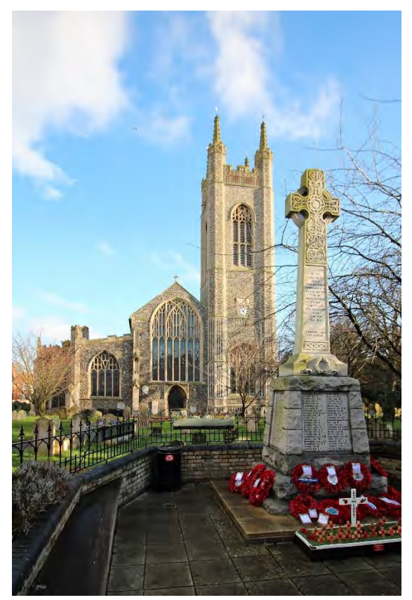
St Mary' Church, St Mary's Street

St Mary' Church and Benedictine Abbey Ruins, St Mary's Street (grade I). A former parish church, closed 1977, and now redundant. Originally this was the Church of the Holy Cross, attached to a Benedictine nunnery, the ruins of which partially survive to the east side of the church. The nunnery was dissolved and partially dismantled at The Reformation and then badly damaged in the fire of 1688. Nave, aisle and porch primarily fifteenth century. The late fifteenth century tower is arguably the dominant feature in the townscape. Its parapet and battlements are of 1702. Octagonal buttresses carried above the parapet as pinnacles. Fire damaged 1688, internally refitted and south aisle re-roofed, as dated on a rafter, in 1699. Church