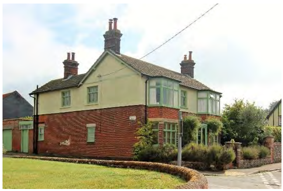
No.6 Outney Road

Cherry Tree House, No.4 Outney Road and red brick boundary wall. A former public house, which was in use as such from at least the beginning of the nineteenth century, it closed in the mid twentieth century. Probably of mid eighteenth century date altered c1930. Single storey with attics, rendered red brick façade with quoins and a black pan tile roof. Eight bay street frontage with two doorways and six small paned metal casement windows set back beneath flat lintels. The window openings to the right of the central doorway are not shown on late nineteenth century photographs. Three gabled dormers with late twentieth century casements. Two substantial red brick ridge stacks. Good red brick wall to Outney Road frontage. Reeve C, Bungay Through Time (Stroud, 2009) p49.