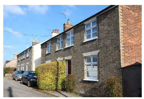
Nos.47-53 (Odd) Southend Road

Windsor Terrace Nos.33-41 (Odd) Southend Road. A terrace of 1896 faced in gault brick with black pan tiles to the front roof slope and red to the rear. Decorative eaves cornice. The central section, a former shop, breaks forward slightly and is gabled; it terminates views along Laburnum Road. The original shop windows to either side of the entrance have been partially preserved. Late twentieth century glazed porch added between former shop windows. Within the flanking wings are mirrored pairs of cottages. Many of the sash windows to these have been replaced with casements. Honeywood F, Morrow P, & Reeve C, The Town Recorder, A History of Bungay in Photographs (Bungay, 1994) p180.