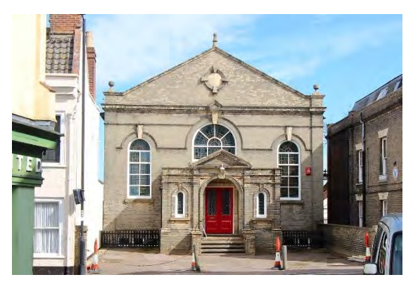
Former Wesleyan Methodist Chapel, Trinity Street

Moulded cornice and parapet. Black pan tiled roof. Symmetrical façade of five bays. Windows now later nineteenth century horned plate-glass sashes. Original flush frames with flat-arched lintels. Eight-panelled front door in a wooden case with fluted Doric pilasters, panelled reveals, triglyphs and a fret dentilled pediment. Gabled cross-wing containing fine staircase to rear. Twentieth century flat-roofed addition. Nos.1 to 19 (odd) form a group.