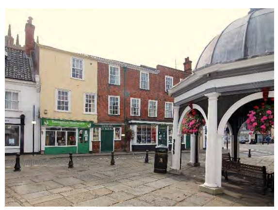
Nos.15-19 (odd) Market Place

No.13 Market Place. A mid-nineteenth century painted red brick structure with a parapeted gable to the Market Place. Four bay return elevation to Cross Street. Single horned plate-glass sash to first floor and shop facia with pilasters below. Cross Street elevation of four narrow bays with a dentilled brick eaves cornice and a single central casement window with a shallow arched brick lintel to the first floor. Blocked doorway and window to ground floor left, and two twentieth century casement windows. All with shallow arched brick lintels. Single storey rear outshot containing a door and a casement window. Red pan tile roof. Forms an important part of the setting of neighbouring listed structures.