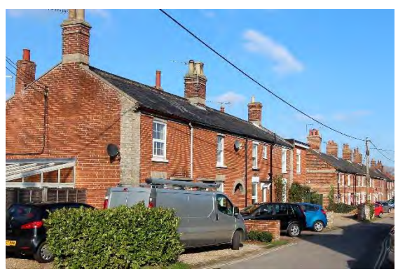
Nos.22-28 (even) Southend Road

bands below. Dentilled gault brick frieze above doorcase lintels. External joinery largely replaced but original openings preserved.