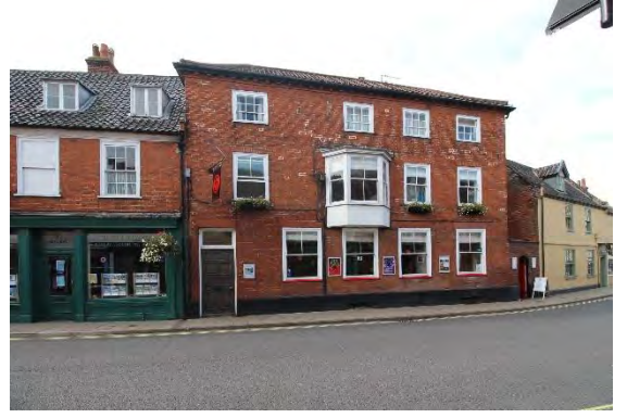
No.5 Earsham Street

Castle complex. Reeve C, Bungay Through Time (Stroud, 2009) p34.