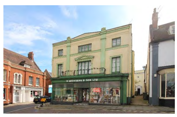
No.5 Market Place

England, Suffolk: East (London, 2015) p.157. Honeywood F, Reeve C, & Reeve T, The Town Recorder, Five Centuries of Bungay at Play (Bungay, 2008) p131.