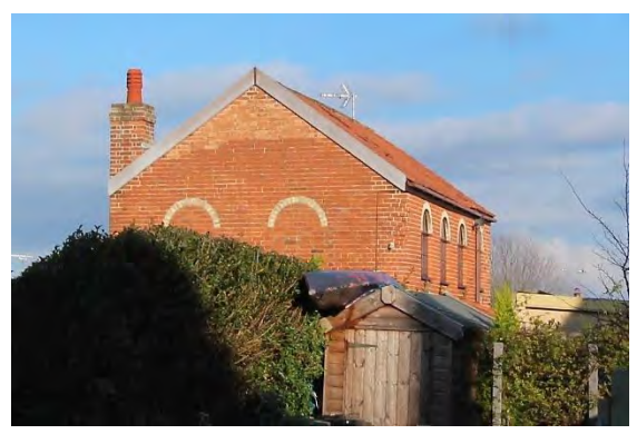
No.38 Broad Street

No.30 and 30A Broad Street (grade II). Eighteenth century house with nineteenth century shop facia. Of two storeys, with a fairly steep red plain tile roof. Red brick, toothed eaves band. Red brick chimney stacks with drip-bands and capping to gable ends. At first floor level there are three, flush-framed, three-light wooden casement windows. A plinth and diaper of dark headers survive on the left-hand section. A single window opening with a twentieth century horned sash and a wedge- shaped lintel survives at ground floor level and a twentieth century six panelled door to No.30. No.30a has a partially glazed door of c1990. Late nineteenth century wide former shop front with pilasters and a central entrance. Door again of c1990. Two iron scroll brackets of former hanging signs at first floor level. Honeywood F, Morrow P & Reeve C, The Town Recorder, A History of Bungay in Photographs (Bungay, 1994) p152.