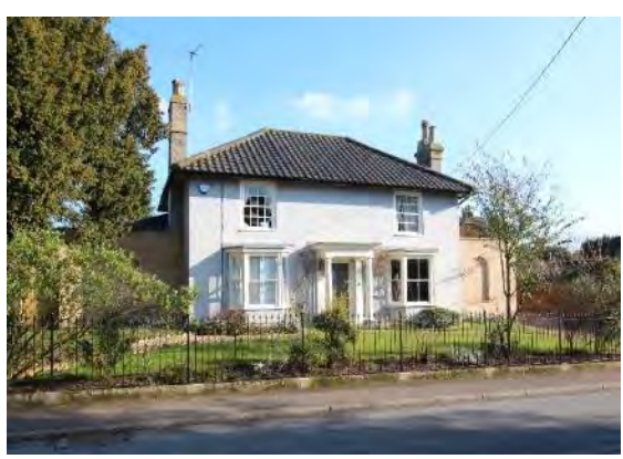
No.11 Flixton Road

No.9 Flixton Road (grade II). Early nineteenth century villa of two storeys. Faced in Suffolk yellow brick, with a hipped black pan tiled roof with wide overhanging eaves. Symmetrical façade divided into three bays with wide shallow brick panels and with wide connecting horizontal band at first floor level. Each panel has a horned plate-glass sash at its centre with a margin to take louvred and panelled shutters, now removed. Sashes, in flush frames, with glazing bars and small border panes at sides, flat arches. Single storey wings with blank panels. Six-panelled door with frieze and cornice, Wooden porch with square-section panelled columns, trellis screen either side. Nos.9 to 13 (odd) form a group.