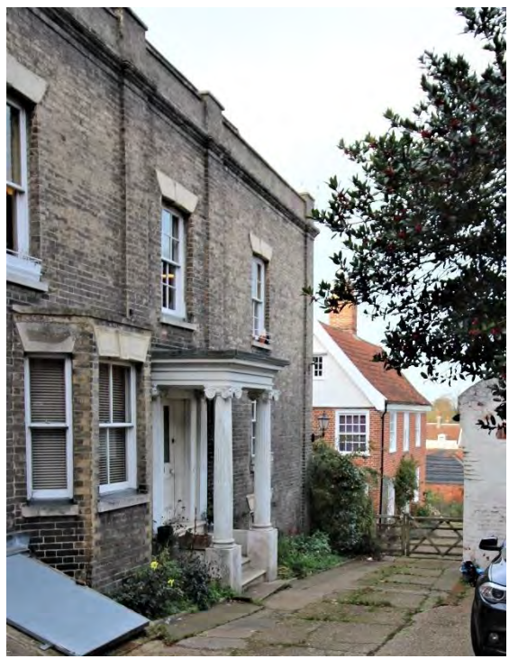
Nos. 7 & 9 Trinity Street

No.7 Trinity Street and outbuilding (grade II). House and shop of c1830-40. Two storeys and an attic, with a slate mansard roof containing two dormers. Faced in gault brick with moulded a cornice, and a parapet with cope. Original shop front to Trinity Street façade with modern glazing, flanked by fluted Greek Doric columns, and entablature over which is "crinoline" balcony railing. Two plate-glass sashes above. Return elevation with house entrance. Central Ionic porch with twelve-light sash above flanked by pilasters. Canted single storey bay to left. Further pilasters to corners and twelve light sashes to outer bays. Rear elevation to Borough Well Lane with pilasters and twelve light sash windows. Nos.1 to 19 (odd) form a group. Subsidiary features include a single storey painted red brick outbuilding with replaced red pan tile roof covering. Elevation to Trinity Street heavily altered in mid twentieth century. Bettley, J, and Pevsner,