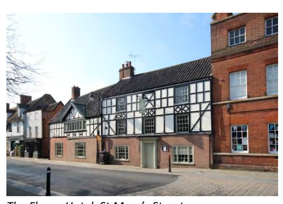
The Fleece Hotel, St Mary's Street

No.6 St Mary's Street and garden walls to rear (grade II). A substantial late eighteenth century townhouse. Of three storeys. Five-bay symmetrical principal façade of red brick with stone dressings. Central breakfront of a single bay, plinth, ground and first floor sill bands. The central breakfront has an open pediment at second floor level above a Venetian window with sashes. Open-pedimented doorcase with Doric 34 radius columns, triglyphs, and an arched fanlight. Six-panelled door. Twelvelight hornless sashes to ground and first floors, sixlight to second floor. Flat-arched lintels. Stone mouldings to cornice at second floor level. Stone cope with four stone ball finials. Fine midnineteenth century wooden office window to ground floor right of classical design, with consoles and an entablature. Central glazed entrance with arched door. Rendered rear range with twelve-light sashes. Subsidiary Structures. Good late eighteenth century red brick walls surrounding former rear garden. Nos.2 to 22 (even) form a group. Bettley, J, and Pevsner, N, The Buildings of England, Suffolk: East (London, 2015) p.157.