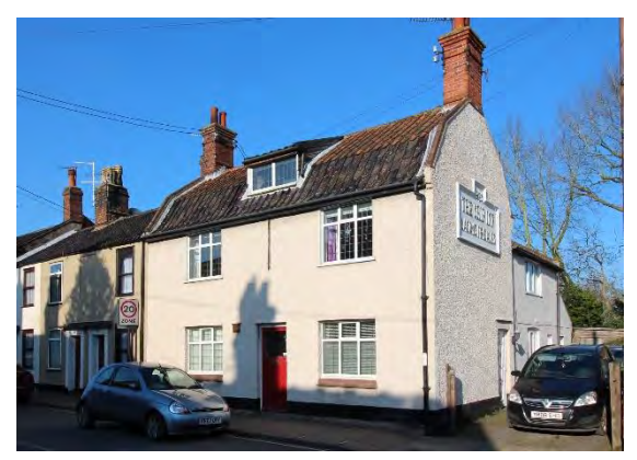
No.53 Lower Olland Street

Nos.47-51 (Odd) Lower Olland Street. Terrace of three early nineteenth century terraced houses of red brick, the façades now rendered and painted. Black pan tiled roof. Doorcases with pilasters identical to Nos.41-45. Window joinery now of late twentieth century date but original openings preserved.