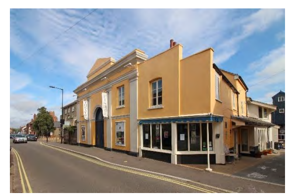
Fisher Theatre No.10 Broad Street

Nos. 6, 8 & 8a Broad Street (grade II). Of eighteenth-century date, No.8a is possibly a later addition. Two storey rendered street frontage, Nos. 6 & 8 having a black pan tile roof, the lower No.8a red pan tiles. Nos. 6 & 8 with three, twelve-light hornless sash windows at first floor level in flush frames with later lugged surrounds. No.8a has one casement at first floor level in a similar lugged surround. No.6 is flanked by two storey pilasters; square bay shop front. Smaller shop window to No.8 and partially glazed door in simple wooden surround. No.8A has an entrance with a modern glazed door in a narrow wooden case and a catslide roof to the rear.