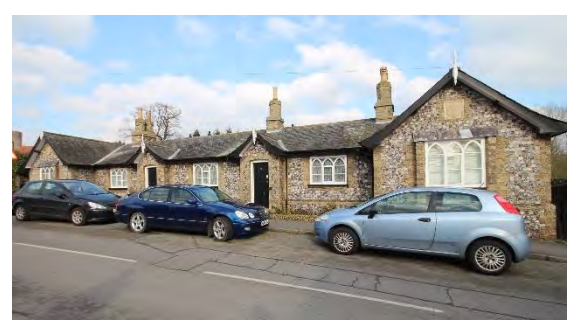
Dreyers Almshouses, Nos.9-17 (odd) Staithe Road

Dreyers Almshouses, Nos.9-17 (odd) Staithe Road (grade II). Single storey alms house block of 1848 faced in square knapped flint with gault brick dressings. Endowed by Eliza Dreyer for the widows of poor tradesmen. Seven-bay façade with gabled porches, outer bays gabled and slightly projecting. Gothick casement windows with three pointed lights. Octagonal shafts to chimneys with capping and drip moulded bases. Plinth. Near-flush-frame doors with cambered arches. Inscribed stone tablets in flank gables with date. Roof of octagonal Welsh slates, bargeboards with spear finials. Further gabled porches to return elevations.