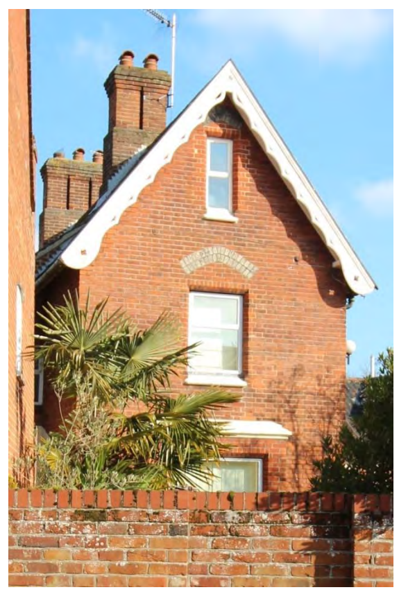
No.15 Upper Olland Street

No.13 Upper Olland Street. Detached villa of later nineteenth century date. Red brick with a black pan tiled roof. Two bay two storey façade with four pane plate-glass sashes to the first floor. Canted bay window to ground floor and partially glazed front door within doorcase with pilasters.