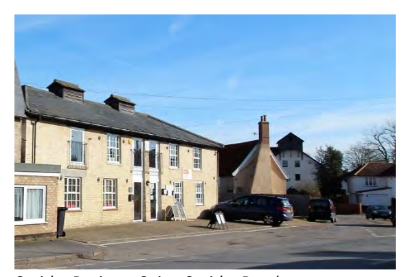
Staithe Business Suite, Staithe Road

setting of the grade II listed No.27. Subsidiary Structures Twentieth century garage not included.