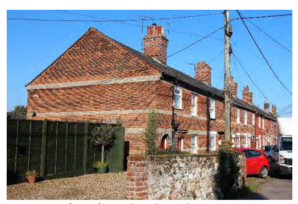
Nos.12-20 (even) Southend Road

Nos.6-10 (even) Southend Road. Mid to late nineteenth century red brick terrace with a black pan tiled roof. Central arched entrance to rear gardens. Nos.6 and 8 retain original horned sashes with margin lights. No.8 also retains a four-paneled front door. Other external joinery replaced but original openings preserved.