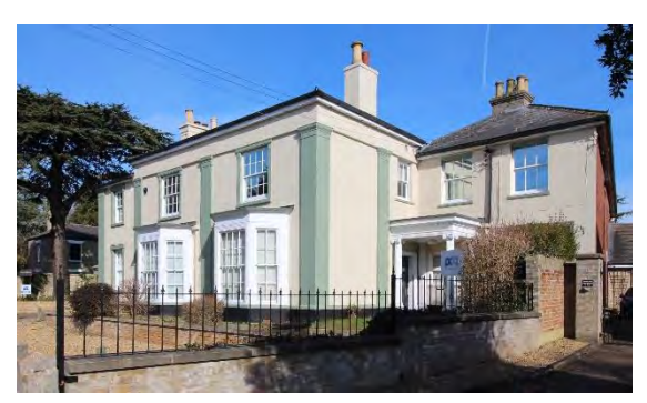
Dunelm House, No.65 Lower Olland Street

Nos.61 & 63 Lower Olland Street. A semi-detached pair of houses of mid nineteenth century date. Possibly originally one villa but map evidence suggests it has been divided since at least 1905. Two storeys. L-shaped, No.61 within projecting range at northern end with a hipped Welsh slate roof. Good Doric doorcase. Twelve-light hornless sashes beneath painted stone flat-arched lintels with rusticated panels. No.63 has parapet hiding roof and gable to southern bays. Twelve-light hornless sashes. Subsidiary Structures. Tall mid nineteenth century gault brick wall springing from entrance façade of No.63.