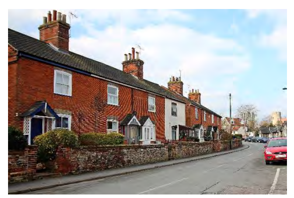
Nos.12-28 (even) Staithe Road

Kimberley Terrace Nos.12-28 (even) Staithe Road . Two terraces of red brick cottages of c1902. Gault brick cambered lintels to ground floor windows. Black pan tiled roof. Most external joinery replaced but original openings preserved. Contemporary red brick boundary wall to Staithe Road.