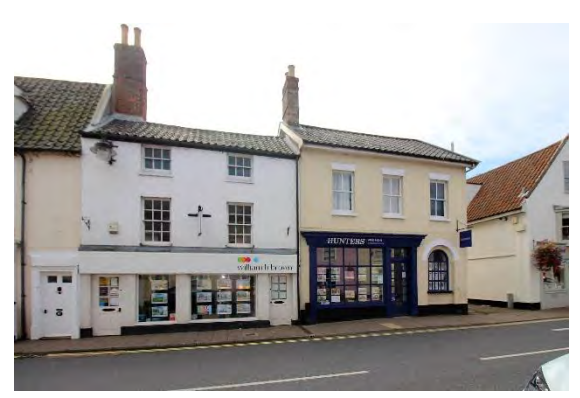
No.21 Earsham Street

No.19 Earsham Street (grade II). Probably of later eighteenth or early nineteenth century date. Painted brick façade of three storeys and two bays. Twelve-light sash windows with glazing bars and gauged flat arches, at first floor level. Six-light sashes above. Shallow pitched pan tile roof, tall red brick ridge stack. Late twentieth century shop front. Nos.1 to 19 (odd) form a group. The rear section of the plot on which this building stands is within the scheduled area of the Castle complex.