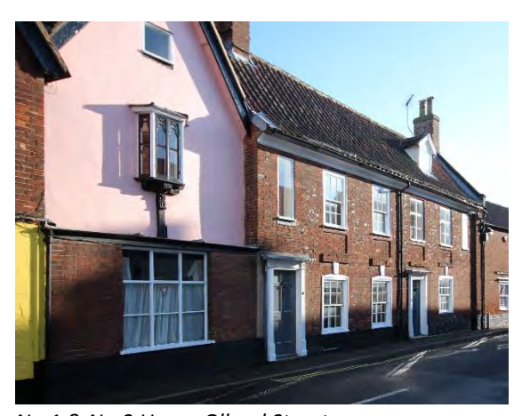
No.1 & No.3 Upper Olland Street

Ashby House, No.1 & Nos.3 &3a Upper Olland Street, (grade II) Early eighteenth century, of two storeys and an attic. One gabled dormer to No.3a. No.1 has a gabled end bay which is partially rendered. Eighteenth century of two storeys and an attic, one gabled dormer and gabled section to left. No.1 incorporates an older timber-framed structure of which one fully-moulded beamed and joisted ceiling remains in an excellent state of preservation. Gabled section stuccoed. Remainder red brick, plaster core cornice. Black pan tiled roof. interrupted brick band below first floor windows. Four windows in flush frames (two sash and two mullion transom casements) at first floor level, also half window left and half panel right, segmental arches at ground floor with stucco keys. Two sixpanelled doors, in wooden cases with pilasters,