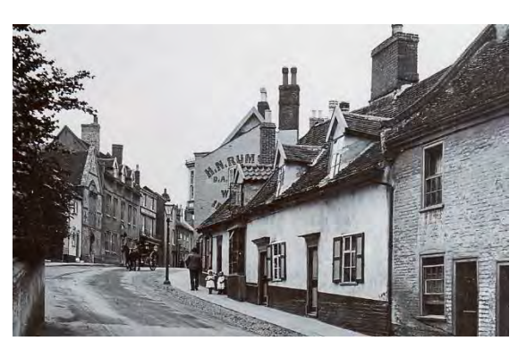
Nos.61, 65, & 67 Earsham Street c1920.

Nos.61-67 (odd), Earsham Street (grade II). A picturesque terrace of three single storey cottages with attics, formerly four dwellings. Red pan tile roof with black pan tile insets forming a decorative geometric pattern. Seven gabled dormers with decorative bargeboards on the Earsham Street roof face containing mostly late twentieth century casement windows. Edwardian views show only three dormers at that time. Of timber framed construction but faced in painted plaster. Twelvelight sash windows with glazing bars and flush frames. Nos.61, 65 and 67, have wood doorcases. No.61, a six-panelled door, the rest have twentieth century four-panelled doors. Nos.39, 41, 49, 51, 61 (odd) and Nos.65 to 73 (odd) form a group.