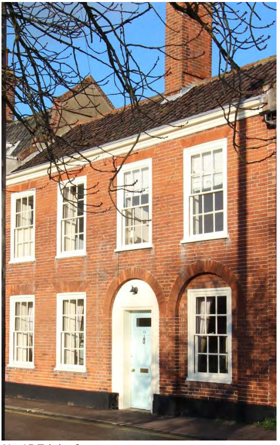
No.15 Trinity Street

No.15 Trinity Street (grade II). Late seventeenth century with eighteenth century red brick façade. Two storey, red brick, wood cornice, black pan tiled roof. Twelve light hornless sashes in flush frames. Flat arched lintels. Pair of arched recesses under each right-hand window the left-hand one containing a five-panelled door, the right a twelve-light sash. Nos 1 to 19 (odd) form a group.