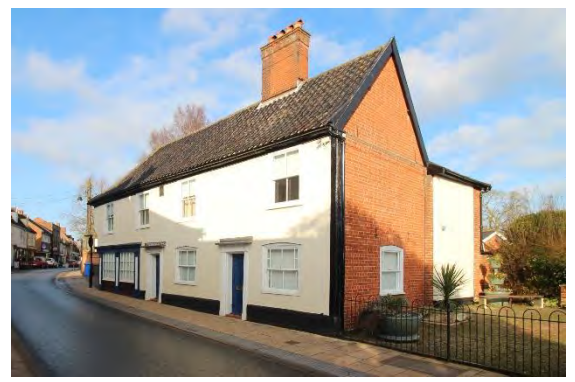
Nos.1-3 (odd), Lower Olland Street

Nos.1-3 (odd), Lower Olland Street (grade II). The former Angel public house, in use as such from the early nineteenth century, the pub closed in 2009. Seventeenth century timber-framed, now with a stuccoed, and largely early nineteenth century façade. lined and painted, coved cornice, black pan tiled roof covering. Four-bay principal façade with plate-glass sashes within flush frames. Two early nineteenth century six-panelled doors in wooden cases with mutular cornices. Former pub facia with small pane casements. Honeywood F, Reeve C, & Reeve T, The Town Recorder, Five Centuries of Bungay at Play (Bungay, 2008) p164.