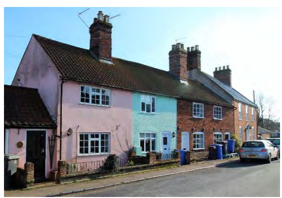
Nos.16-20 (even) Wingfield Street

Nos.5 to 11 (odd) and No.14 form a group. Subsidiary structures Red brick cart shed now garage range with boarded doors attached to right. Single storey. Red pan tiled roof possibly a re-front of an earlier structure. Reeve C, Bungay Through Time (Stroud, 2009) p88.