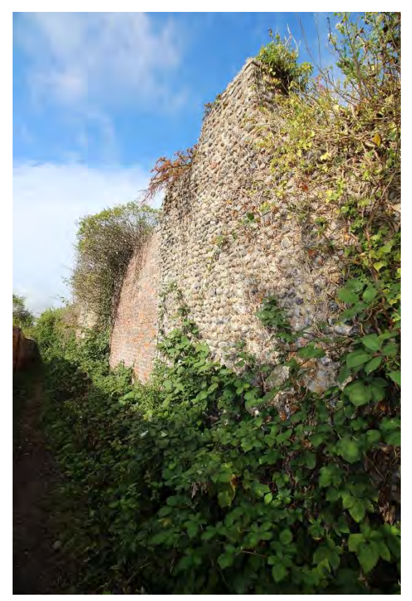
Garden wall of c1839, grounds of Scott House, Earsham Street

Fronting onto Castle Lane the walls are largely of red brick and probably of mid nineteenth century date.