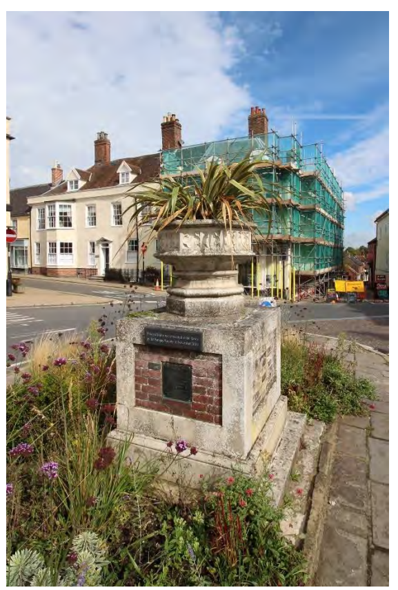
Memorial in Market Place

Wall to rear of No.23 Market Place -see Saint Mary's Street