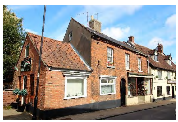
Nos.17-21 (odd) Bridge Street

twentieth century panelled doors with integral fanlights. No.7 retains two six-pane shop fronts which are possibly of mid nineteenth century date one beneath a segmental arched lintel. Single storey wing with a red pan tiled roof and a small pane casement window beneath a segmental arched lintel. Nos.1 to 7 (odd) form a group. Also Nos.1 to 5 (odd) form a group with Nos. 1 & 3 Nethergate Street.