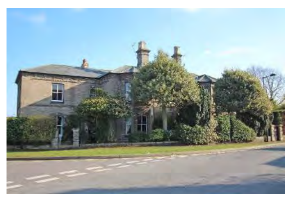
Nos.1 & 3 Flixton Road

Nos.1 & 3 Flixton Road, walls and gate piers. A semidetached pair of houses prominently located at the junction of Bardolph and Flixton Roads. Also visible from Laburnum Road. Shown on the 1885 Ordnance survey map and probably dating from c1870. Gault brick with a Welsh slate roof. Decorative corbelled eaves cornice, pilasters, and two storey canted bay windows. Original plate glass sashes largely preserved. Subsidiary Structures Good contemporary gault brick gate piers and low boundary wall. Tall nineteenth century red brick wall to Laburnum Road.