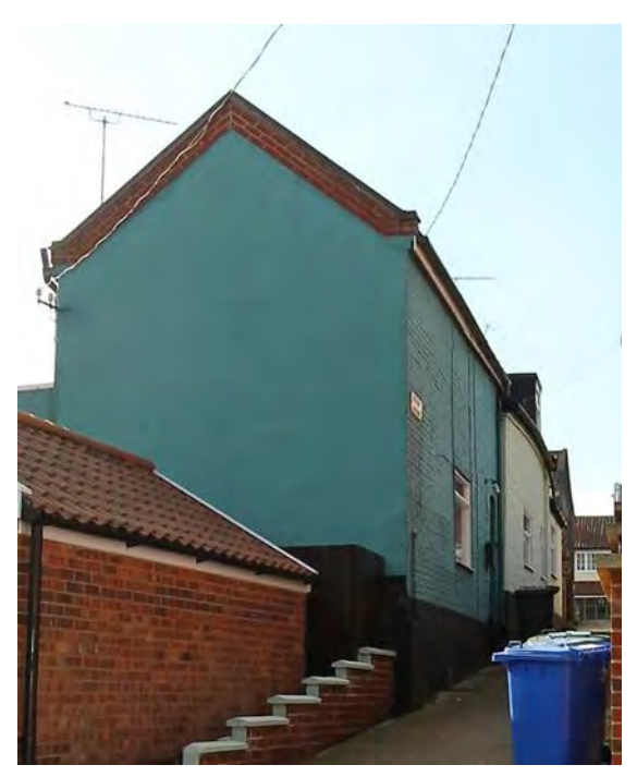
Rose Cottage and No.4 Stone Alley

Rose Cottage and No.4 Stone Alley. A semidetached pair of small cottages of probably later eighteenth-century date, which were altered in the later twentieth century. They are of one and a half storeys, and faced in brick which is either painted or rendered. Late twentieth century casement windows. Pan tiled roof. Early twenty first century addition to No.4.