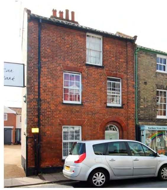
No.37 Earsham Street

The rear section of the plot on which this building stands is within the scheduled area of the Castle complex.