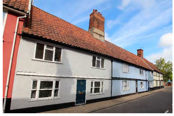
Nos. 39-43 (odd) Bridge Street