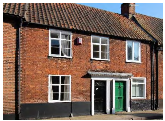
Nos.27 & 29 Upper Olland Street

cambered arches. No 25A has a wood reeded doorcase with roundels and a six-panelled door. No.25 to the right has a reeded doorcase with roundels and enriched canopy, and a twentieth century panelled door. Two gabled dormers. Formerly the Red Lion Public House. Honeywood F, Reeve C, & Reeve T, The Town Recorder, Five Centuries of Bungay at Play (Bungay, 2008) p155.