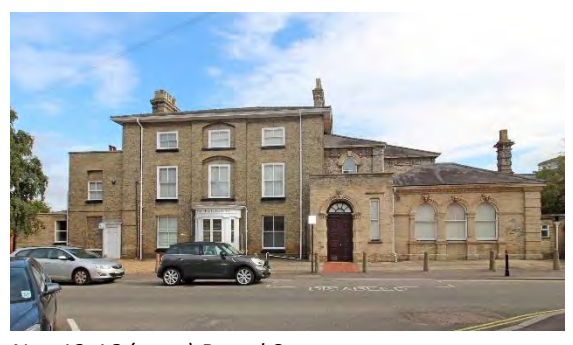
Nos.12-16 (even) Broad Street

Boundary wall to The Armoury. Mid nineteenth century gault brick wall with decorative panels between rusticated pilasters. Dentilled cornice and projecting plinth. Flanks the Broad Street garden entrance to The Armoury. For 'The Armoury' itself, see No.10a Nethergate Street.