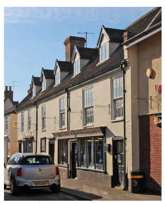
Nos.14-16 (even) Upper Olland Street

Nos.14-16 (even) Upper Olland Street (grade II). An early eighteenth century block of two storeys and an attic. Five identical gabled dormers with bargeboards and casement windows. Six-bay façade of painted stucco over a plinth; red pan tiled roof. Twelve-light hornless sashes within flush frames at first floor level. No.14, six-panelled door in wooden case with pilasters, mid-twentieth century wooden shop front right. No.16, small early nineteenth century shop window with cornice. Nos.2 to 10 (even), 14, 16, and Nos.20 to 24 (even) form a group.