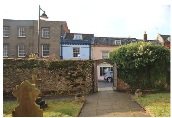
St Edmund's Churchyard Wall, St Mary's Street

mullioned surrounds. Two and three-light mullioned and transom windows to ground floor with leaded lights. Entrance under stone arch to right side of projecting gable. Side has similar paired and triple sashes and a projecting gable. Interior contains a corridor leading directly across the whole ground floor from entrance to sacristy of church (qv), to which the presbytery is linked. Together with the church, the Church of St Mary (including the remains of the Benedictine Convent) (qv), and walls in both churchyards (qv) the presbytery forms a very significant group in the centre of Bungay.