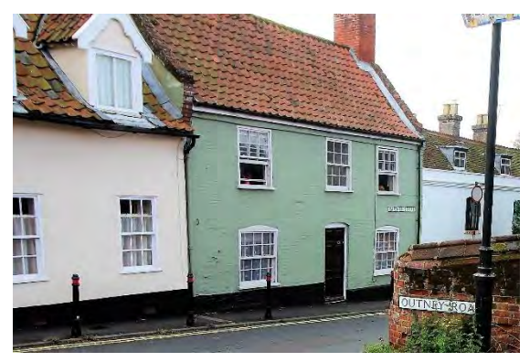
Nos.69-71 (odd), Earsham Street

Nos.69-71 (odd), Earsham Street (grade II). House, formerly three cottages of eighteenth century date, two storey with a lime washed brick façade. Standing on the corner of Castle Lane. Considerably altered since present listing description drafted. Front range facing Earsham Street formerly two cottages with a third in the rear outshot. Earsham Street façade formerly with two small pane sash windows to each floor with flush frames cambered arched lintels to ground floor. Six panelled door in a flush frame, formerly with a similar door to its immediate left. Inserted window immediately above. Roof formerly plain tiled but now covered with red pan tiles. Gabled return elevation to Castle Lane with two sashes. Rear elevation and two storey gabled rear outshot (formerly a separate small cottage No.1 Castle Lane) also visible from Castle Lane. Nos 39, 41, 49, 5l, 61 (odd) and Nos.65 to 73 (odd) form a group.