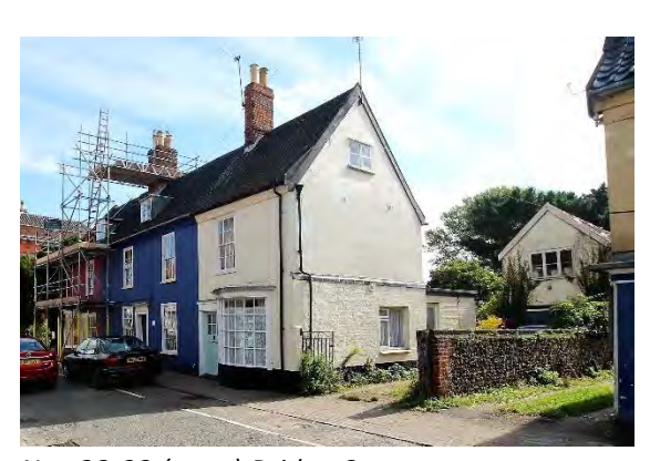
Nos.28-32 (even) Bridge Street

Substantial rear range with red brick façade, which was possibly originally a separate dwelling. Two storeys with a two-bay principal façade facing towards the river. Casement windows beneath cambered brick lintels, one hornless twelve-light sash at first floor level. Blocked door opening to ground floor centre. Good group of probably early nineteenth century red brick outbuildings in yard to the rear of No.26 including gabled cart shed with loft above. Red pan tiled roofs some now missing. Last used as an abattoir. Nos.2, 4, 6A, 12 to 20 (even), 24 to 34 (even) 40 to 44 (even), 48 and 50 form a group.