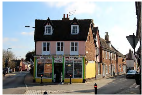
No.56 St Mary's Street

No.56 St Mary's Street (grade II). An eighteenth-century structure of two storeys and an attic, standing in a prominent location at the junction of St Mary's Street, Upper Olland Street, and Lower Olland Street. Tiled roof with two gabled sash dormers with glazing bars. St Mary's Street façade of two bays with two, near flush framed casements at first floor level. Red brick, part painted, and part stuccoed. Bowed shop front, with a central entrance, in a wooden case with reeded pilasters and an enriched entablature. No.56 forms a group with No.2 Lower Olland Street and Nos.1, 3, 3A Upper Olland Street. Nos.42 to 56 (even) form a group.