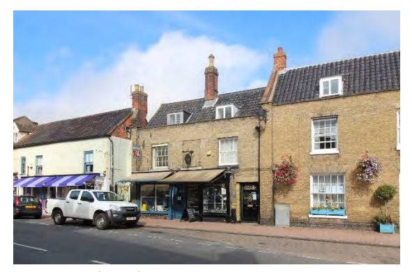
Nos.28-30 (even) Earsham Street

Recorder, A History of Bungay in Photographs (Bungay, 1994) p63.