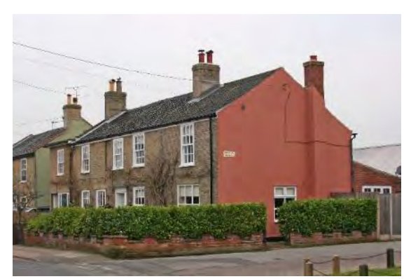
Nos. 10 & 12 St John's Road

No.4 St John's Road (grade II) An early nineteenth century cottage with a symmetrical two storey façade of limewashed brick. Hipped black pan tiled roof and dentilled eaves cornice. Red brick ridge stack. Horned four-light plate-glass sashes within flush frames, cambered flat arches at ground floor, four-panelled door in case with console brackets and an enriched cornice. Subsidiary structures. Low red brick wall to front with the plinths of former gate piers. Probably later nineteenth century.