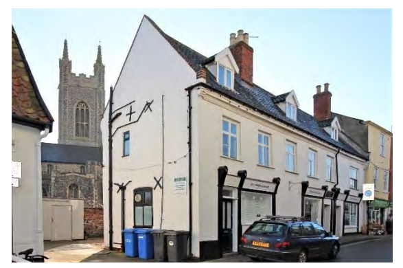
Nos.2 & 4 Cross Street

Nos.2 & 4 Cross Street (grade II). Of later seventeenth century date with nineteenth century alterations. Of two storeys, with an attic lit by three gabled dormers. Roughcast on brick, with a coved cornice. Black pan tiled roof slope to Cross Street façade and red to the churchyard. Five mullioned and transomed casement windows at first floor level, and a near flush framed hornless sash window with glazing bars. No.2, has a late nineteenth century former pub facia of wood with pilasters to the right-hand bay (former Crown Inn), its other shop facia is probably a later twentieth century copy. No. 4, also has a late twentieth century shop front in the style of that of No.2. At the rear of No.2 a two-storey red brick eighteenth century range with a red pan tile roof and a single casement window at first floor level which abuts No.15 Market Place. The rear elevation which is visible from Saint Mary's Churchyard forms an important part of the setting of the grade I listed church. Honeywood F, Morrow P & Reeve C, The Town Recorder, A History of Bungay in Photographs (Bungay, 1994) p158. Honeywood F, Reeve C, & Reeve T, The Town Recorder, Five Centuries of Bungay at Play (Bungay, 2008) p141.