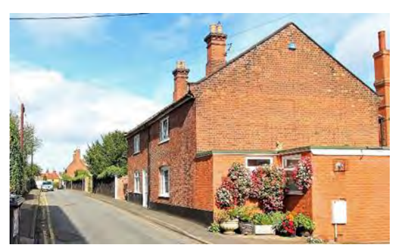
No. 16 Nethergate Street

Nos.8-12 (even), Nethergate Street A terrace of three c1800 cottages standing at a right-angle to the road within an alley to the rear of Nos.4 & 6. Built of red brick with a red pan tiled roof containing sloping roofed dormers with casement windows. Stack to gable at Nethergate Street end and one central ridge stack. Small pane casement windows beneath cambered brick lintels. Doors with similar lintels.