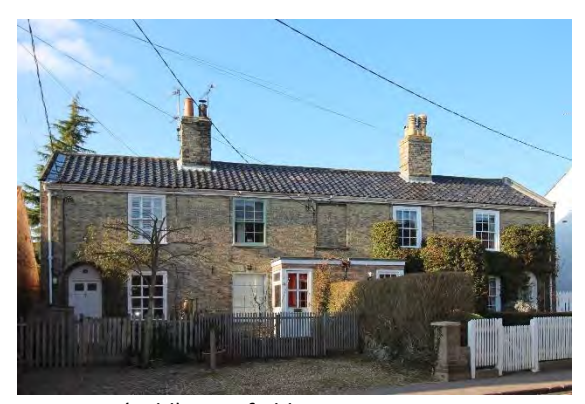
Nos.5-11 (Odd) Wingfield Street

No.3 Wingfield Street, outbuilding, and boundary wall. A detached villa of c1900 with earlier outbuilding to rear. The outbuilding is shown on the 1885 1:2,500 map, the villa not till that of 1905. Villa red brick with stone dressings and a plain tile roof. Plate- glass sash windows in flush frames. Canted bay windows to ground floor with carved stone lintels to windows and keystones. Gabled wooden porch containing a six-panelled door. Subsidiary structures Attached red brick outbuilding with red pan tiled roof to rear, partially built over stone boundary wall. C1900 red brick dwarf wall and piers to front with decorative railings. Twentieth century flat-roofed garage addition not of significance.