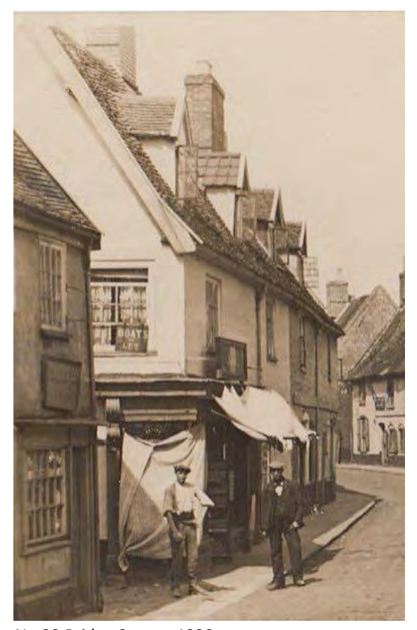
No.29 Bridge Street c1920