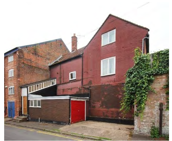
The Armoury, Nethergate Street

The Armoury, Nethergate Street. House of painted red brick with a red pan tiled roof. Probably of eighteenth-century date and formerly part of a maltings complex (see 1885 1:2,500 Ordnance Survey map). Also used as a regimental armoury for the 2<sup>nd</sup> Volunteer Battalion Norfolk Regiment (see also No.12 Scales Street). Nethergate Street façade of two bays, the right-hand bay gabled. Large blocked arched opening visible behind twentieth century garage addition and scarring for blocked window above. Entrance door at first floor level approached by enclosed flight of steps. All present windows in Nethergate Street façade late twentieth century casements. Return elevation to the garden of the grade II Nos.12-16 Broad Street largely blind.