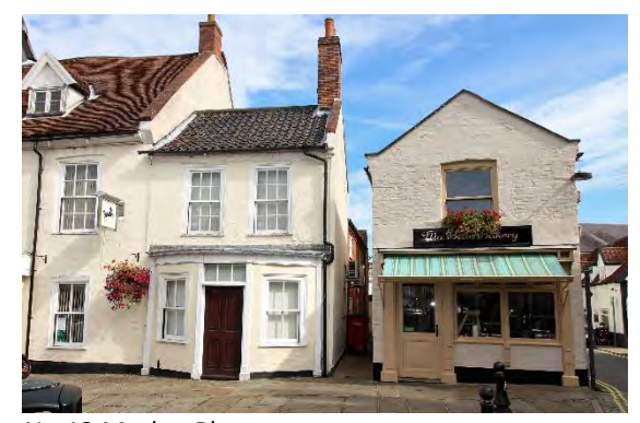
No.13 Market Place

No.13 Market Place. A mid-nineteenth century painted red brick structure with a parapeted gable to the Market Place. Four bay return elevation to Cross Street. Single horned plate-glass sash to first floor and shop facia with pilasters below. Cross Street elevation of four narrow bays with a dentilled brick eaves cornice and a single central casement window with a shallow arched brick lintel to the first floor. Blocked doorway and window to ground floor left, and two twentieth century casement windows. All with shallow arched brick lintels. Single storey rear outshot containing a door and a casement window. Red pan tile roof. Forms an important part of the setting of neighbouring listed structures.