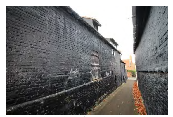
Brandy Lane elevation of No.18 Broad Street

building which has been a wine merchants for a long period are extensive barrel-vaulted cellars of considerable age. Subsidiary Structures Good red brick serpentine wall to the rear, probably of early nineteenth century date with later buttresses.