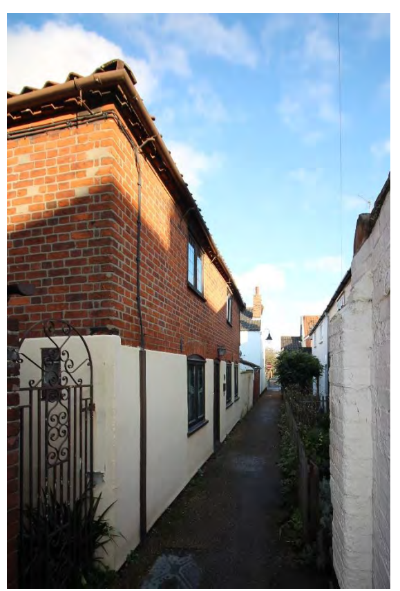
Nos.8 & 10 Turnstile Lane

Nos.7-9 (Odd) Turnstile Lane. A terrace of four probably early nineteenth century cottages which were converted to two in the late twentieth century. Rendered façades with twelve-light casement windows and boarded doors. Red pan tiled roof, red brick ridge stacks.