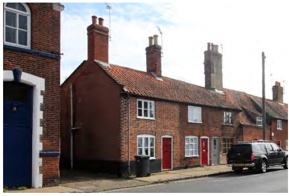
Nos.60-64 (even) Broad Street

No.58 Broad Street. A single storey cottage with a red brick façade and a red pan tile roof. Probably of mid to late eighteenth century date. The external joinery is now largely of late twentieth century date. Wedge-shaped lintels to door and window. Central rendered dormer with late twentieth century casement lighting attic. Massive red brick chimney stack.