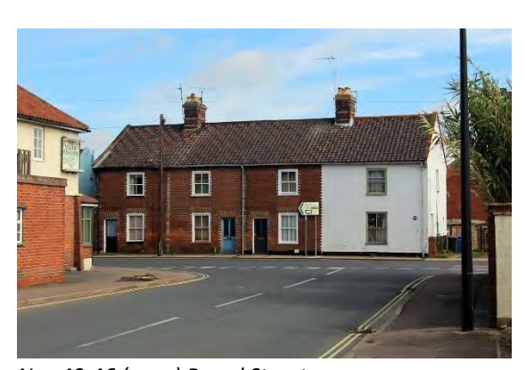
Nos.40-46 (even) Broad Street

No.38 Broad Street. A mid to late nineteenth century red brick two storey structure standing to the rear of No.40 Broad Street, also visible from Nethergate Street. Possibly built as a workshop. Four bay principal elevation with gault brick lintels to arched casement windows. Single storey red pan tile roofed projecting range. Return elevation to Broad Street has blocked arched window openings at first floor level and a larger blocked arched opening to the ground floor. Return elevation to Nethergate Street rendered. Red pan tile roof, red brick stack to rear. Good tall red brick boundary wall attached to rear gable. A building is shown on this site on the 1885 1:2,500 Ordnance Survey map.