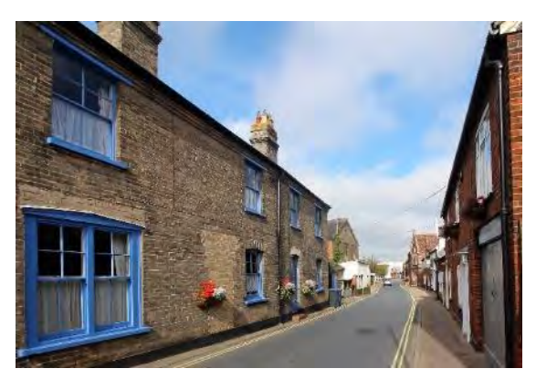
No.1 Chaucer Street

No.1 Chaucer Street. Attached to the rear of the grade II listed No.24 Earsham Street and shown as part of that structure on early Ordnance Survey maps. By 1969 it was shown on maps as a separate dwelling. It was possibly built as the postmaster's house for the former town post office at No.24 Earsham Street 1880. Gault brick façade to an