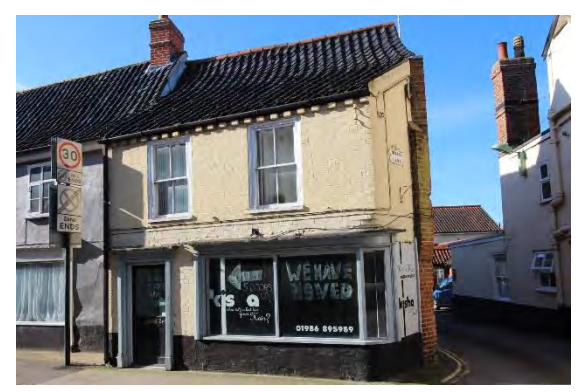
No.2 Upper Olland Street

No.2 Upper Olland Street (grade II). A seventeenth century structure with a nineteenth century façade of painted brick. Standing on the southern corner of Quaves Lane. Black pan tiled roof, dentilled eaves cornice, red brick chimney stack. First floor windows now plate-glass hornless sashes. Early nineteenth century wooden doorcase and shop facia with pilasters and delicate entablature. Nos.2 to 10 (even), 14, 16 and Nos.20 to 24 (even) form a group. Honeywood F, Morrow P, & Reeve C, The Town Recorder, A History of Bungay in Photographs (Bungay, 1994) p185.