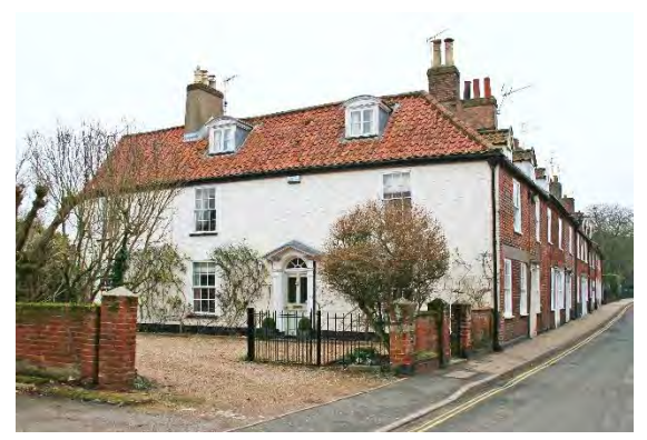
Nos.21 & 23 Upper Olland Street

brick chimneystacks with paired flues. Canted bay window to Upper Olland Street façade. Black pan tiled roof with large twentieth century dormer in southern elevation. Most external joinery replaced.