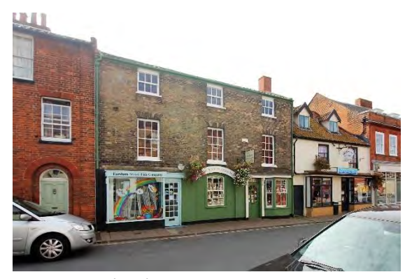
Nos.39 & 41 (odd), Earsham Street

Nos.39 & 41 (odd), Earsham Street (grade II). Early nineteenth century façade of Suffolk white brick. Of three storeys and three bays. At first floor level three twelve-light hornless sashes beneath wedge shaped lintels. Pan tiled roof. No.39 modern shop front. Central window, ground floor, with glazing bars, in wide panel with segmental arch. No. 41, four-panel door in wood case with consoles, canted bay window with plate glass sashes to right. Rear elevation of two storeys with red pan tiled roof slope. Nos.39, 41, 49, 51, 5, to 61 (odd) and Nos.65 to 73 (odd) form a group. The rear section of the plot on which this building stands is within the scheduled area of the Castle complex.