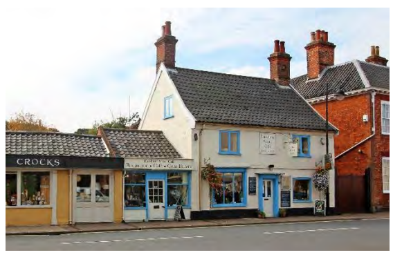
No.11-13 Earsham Street

Nos.9-11 (odd) Earsham Street (grade II). Probably of early nineteenth century date, and of a single storey with shallow pitched black pan tiled roofs. No.9 has an early nineteenth century wooden shop facia with pilasters. No.11, nineteenth century wooden shop facia with glazing bars and a central entrance. Nos.1 to 19 (odd) form a group. The rear section of the plot on which this building stands is within the scheduled area of the Castle complex.