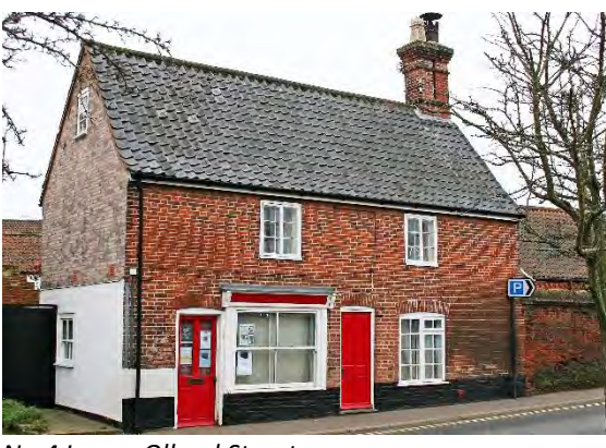
No.4 Lower Olland Street

No.2 Lower Olland Street (grade II). Early seventeenth century. This building interlocks with Nos.1 and 3 Upper Olland Street, qv, and incorporates part of a sixteenth century structure. Of two storeys and an attic. Tiles and pan tiles. Mock half timberwork painted on cement rendering. three-light casement window within gable, two-light casement at first floor level, mullioned and transomed casement to ground floor. Six-panelled door (entrance under left of No.56 St Mary's Street) with architrave convex frieze and cornice. 2'storey wing, left, brick, painted, includes small casement at each floor. No.2 forms part of a group with No.56 St Mary's Street and Nos. 1, 3 & 3a Upper Olland Street. Subsidiary structures. Fine panelled red brick garden wall to south fronting onto Lower Olland Street. Dentilled cornice beneath semi-circular brick cap. Blue brick embellishments.