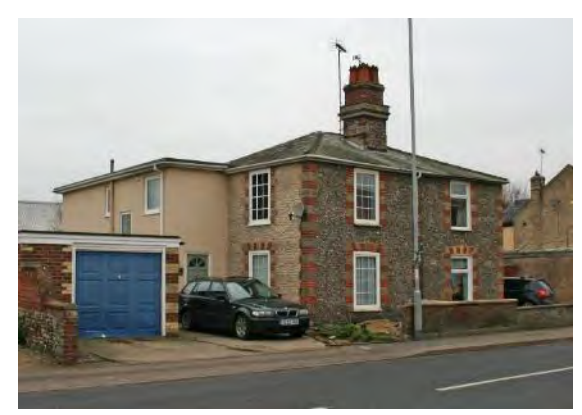
Nos.18 & 20 St John's Road

Nos.14 & 16 St John's Road. An early to midnineteenth century semi-detached pair of cottages. Suffolk white brick façade with a black pan tiled roof. Formerly symmetrical façade, No.16 now altered. No.14 retains a wooden doorcase with pilasters and a dentilled cornice. Late twentieth century partially glazed front door. Blind panel above doorcase. Late twentieth century casements within original openings. No.16 has had its front door replaced by a window and again has late twentieth century casements. Subsidiary Structures Low red brick boundary wall with glazed cap probably of early twentieth century date. Garage to No.16 not included.