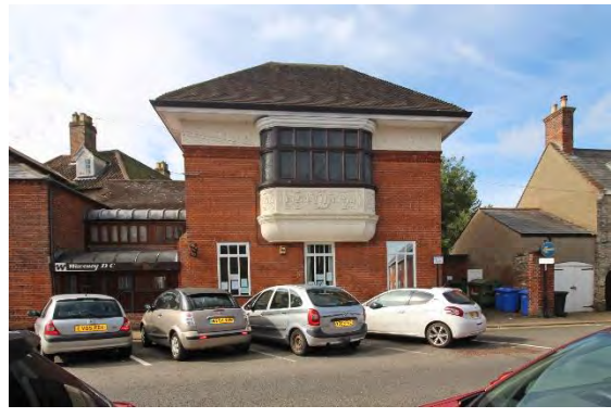
Billiard Room wing, Earsham House, No.12, Earsham Street

Earsham House, No.12 Earsham Street including No.1a Broad Street (grade II). Eighteenth century two storey, attic, and basement, three pedimented dormers. Red brick, small wood cornice, modern tiles. Plinth. Five windows, sash, with glazing bars and flat arches. six-panel door in wood case with enriched pilasters, radial bar fanlight, consoles, and open pediment. Fine arts and crafts vernacular rear range of 1892 fronting onto Broad Street now part of the Council offices. Red brick with a hipped roof over wide projecting eaves. Fine oriel window at first floor level with mullions and a transom containing leaded lights. This housed a billiard room on the first floor and was designed by Bernard Smith with fittings by MFC Turpin and WB Simpson. The fine pargetted decoration is by Daymond and Son. Bettley, J, and Pevsner, N, The Buildings of England, Suffolk: East (London, 2015) p.154-155.