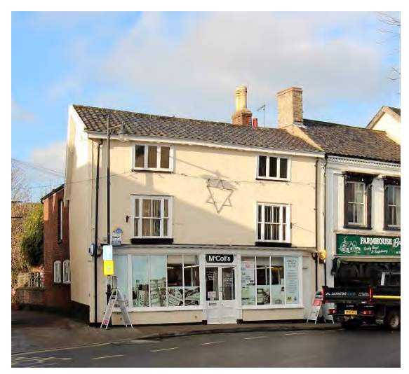
No.14 Market Place

No.12 Market Place. Former public house, now a shop, front range probably of mid-nineteenth century date. Painted brick with a black pan tile roof. Gault brick stack. Dentilled brick eaves cornice plain pilasters and heavy classical surrounds to first floor windows. Four-light horned sashes. Twentieth century shop facia. The Bell Inn closed c1920. The building plays an important and positive role within the setting of the grade II listed Nos.10 & 14 Market Place. The rear section of the plot on which this building stands is within the scheduled area of the Castle complex. Reeve C, Bungay Through Time (Stroud, 2009) p11. Honeywood F, Reeve C, & Reeve T, The Town Recorder, Five Centuries of Bungay at Play (Bungay, 2008) p144.