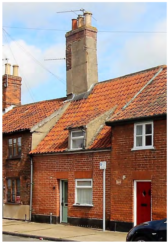
No.58 Broad Street

Nos.54 & 56 Broad Street A pair of cottages with early nineteenth century facades and steeply pitched red pan tile roofs. Shared central ridge stack. Possibly a re-fronting of an earlier structure. Casement windows. Those to No.56 are of late twentieth century date, however the first-floor window of No.54 may be earlier. Twentieth century front doors. Wedge shaped lintels to door and window openings. No.54 has a single storey late twentieth century addition to the rear and a rendered return elevation.