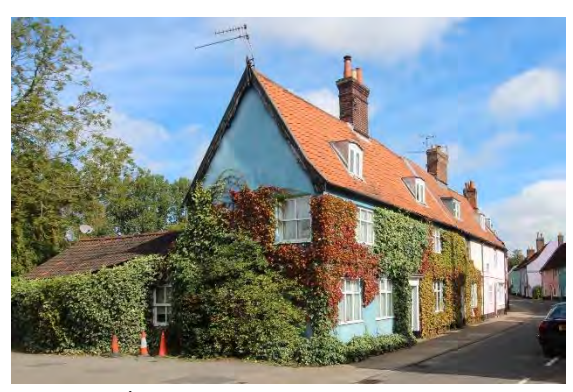
No. 29 Bridge Street

floor band, plinth. Three flush framed casement windows at first floor level. Segmental arched lintels to two casements flanking the front door. Six-panelled door with near-flush frame. The right-hand has later twentieth century door and window openings inserted following the demolition of the adjoining cottage in the mid twentieth century. Catslide roof to rear. Nos.17, 21, & 23 form a group. Honeywood F, Morrow P & Reeve C, The Town Recorder, A History of Bungay in Photographs (Bungay, 1994) p156. Reeve C, Bungay Through Time (Stroud, 2009) p58-59.