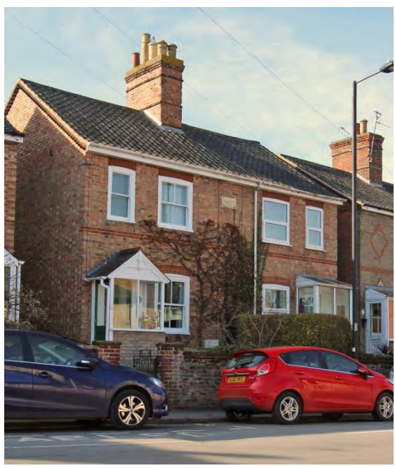
Alexandra Cottages, Nos.34-36 (even) Staithe Road

Nos.30-32 (even) Staite Road. Semi-detached pair of houses constructed between 1892 and 1905. Gault brick façade with red brick dressings to otherwise red brick structure. Replacement windows in original openings. Black pan tiled roof. Nineteenth century red brick boundary wall to Staithe Rd.