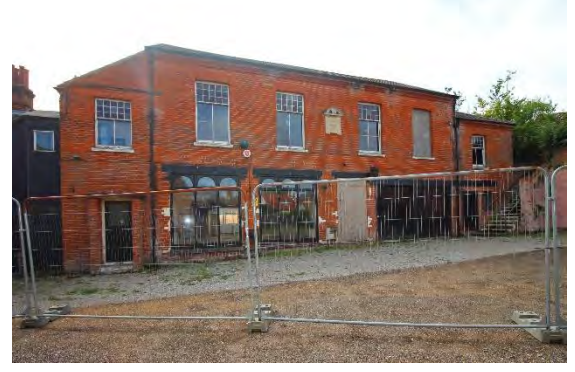
Odd Fellows Hall to the rear of No.2 Market Place

Two storey early to mid- nineteenth century red brick range to the rear, attached to which is a former Odd Fellows Hall of 1887. This is a two storey red brick structure with a hall at first floor level and cart sheds beneath. Horned sash windows to first floor. Black pan tile roof. Nos.2 to 16 (even) form a group. The walls to the rear of the plot are within the scheduled area of the Castle complex.