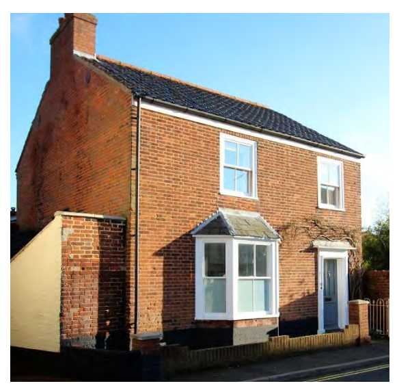
No.13 Upper Olland Street

No.11 Upper Olland Street. A former public house now converted to flats. Probably of early nineteenth century date. In use as The Queen Public House in the nineteenth and early twentieth centuries. Red brick. Twelve-light hornless sash windows to first floor in flush frames with flatarched lintels. Nine-light hornless sashes to second floor. Small inserted late twentieth century casement at first floor level. Large yard opening with boarded door to ground floor and a later nineteenth century public house facia with panelled pilasters. Return elevation to Turnstile Lane partially rendered. Two storey rear wing with casement windows. Honeywood F, Reeve C, & Reeve T, The Town Recorder, Five Centuries of Bungay at Play (Bungay, 2008) p152-153.