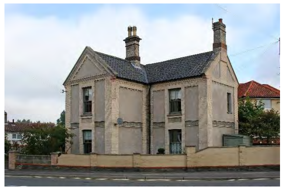
No.71 Staithe Road

No.71 Staithe Road. A substantial mid- nineteenth century classical villa of a bold and inventive design.