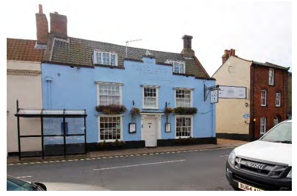
The Castle Inn, No.35 Earsham Street

beneath cambered arches. Possibly the public house known as the Butchers Arms listed in the 1909 town rates book. The rear section of the plot on which this building stands is within the scheduled area of the Castle complex.