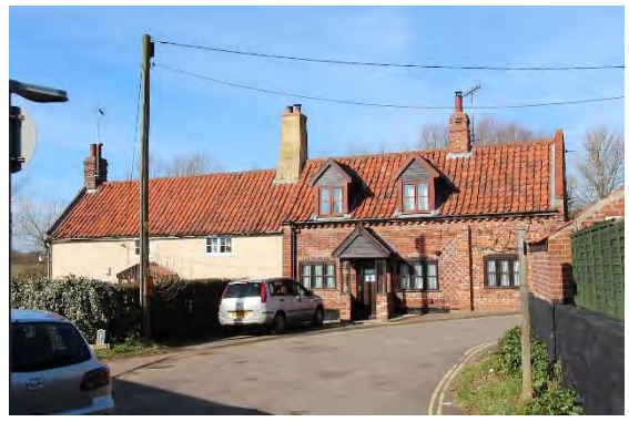
Nos.27 & 28 Quaves Lane

Nos.11 & 15 Quaves Lane with outbuilding and boundary wall to No.11. A pair of semi-detached houses which were built in the early to mid-nineteenth century as three cottages, Nos.11& 13 are now combined. Red brick with a hipped red pan tiled roof. Two storeys with a single storey nineteenth century lean-to to the north-east (No.11). The east wall to Castle Lane is tarred. Late twentieth century timber doors and casement windows in original openings. Subsidiary Structures Low painted boundary wall to Quaves Lane elevation of No.11 which appears to be of nineteenth century date. Twentieth century wall to No.15.