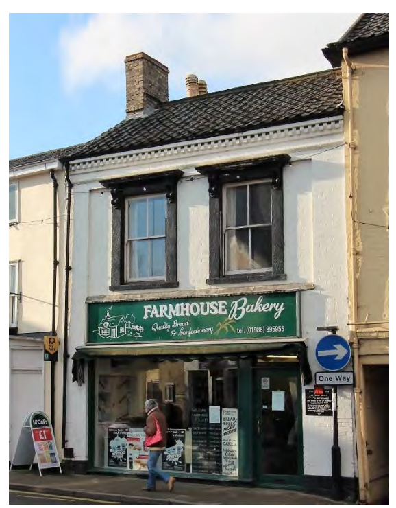
No.12 Market Place

limewashed, three twelve-light hornless sashes at second floor level with flush frames. The first floor windows have had their glazing bars removed. Stuccoed flat arched lintels with keys. Wide cart opening to left. Early nineteenth century wooden shop front, to right with slender reeded pilasters and entablature. Low pitched pan tiled roof. Long two storey rear range of c1800. Red brick with a red pan tiled roof, possibly originally a warehouse. Nos. 2 to 16 (even) form a group. The rear section of the plot on which this building stands is within the scheduled area of the Castle complex. Honeywood F, Reeve C, & Reeve T, The Town Recorder, Five Centuries of Bungay at Play (Bungay, 2008) p144.