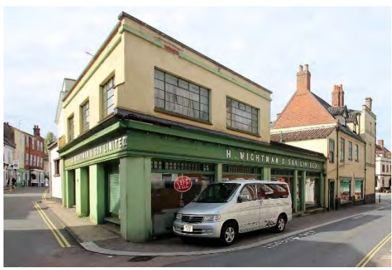
Nos.2 & 2a Trinity Street with No.5 Market Place in the distance

No.2 Trinity Street (grade II). Seventeenth century and of two storeys with an attic lit by two gabled casement dormers. Limewashed brick, band cut away, plinth. Wooden cornice, black pan tiles, three first floor original mullioned and transomed casements. Six-panelled door in wing, left. Two late twentieth century plate glass shop windows to the ground floor. (See also No.5 Market Place).