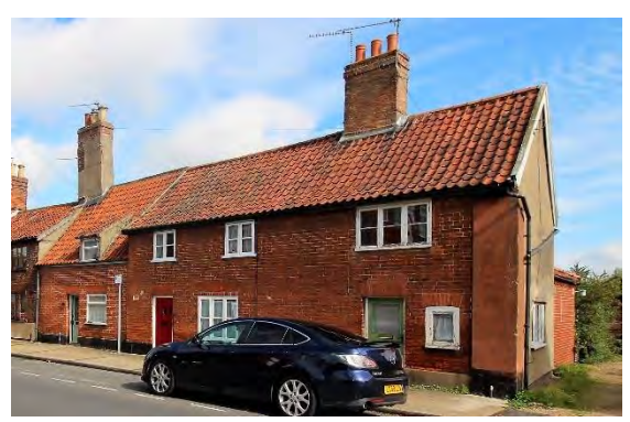
Nos.54 & 56 Broad Street

Nos.54 & 56 Broad Street A pair of cottages with early nineteenth century facades and steeply pitched red pan tile roofs. Shared central ridge stack. Possibly a re-fronting of an earlier structure. Casement windows. Those to No.56 are of late twentieth century date, however the first-floor window of No.54 may be earlier. Twentieth century front doors. Wedge shaped lintels to door and window openings. No.54 has a single storey late twentieth century addition to the rear and a rendered return elevation.