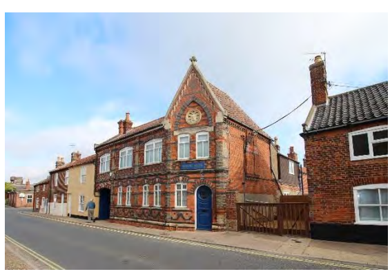
Masonic Rooms, Nos.18-22 Chaucer Street

Nos. 14 & 16 Chaucer Street. An early to midnineteenth century semi-detached pair of cottages. Of red brick with a shallow pitched black pan tile roof. Red brick stacks rising from gable ends. Replacement casement windows beneath shallow arched brick lintels. Brick lintels to doors possibly replaced. Four-panelled door to No.16. No.14 has a late twentieth century partially glazed front door.