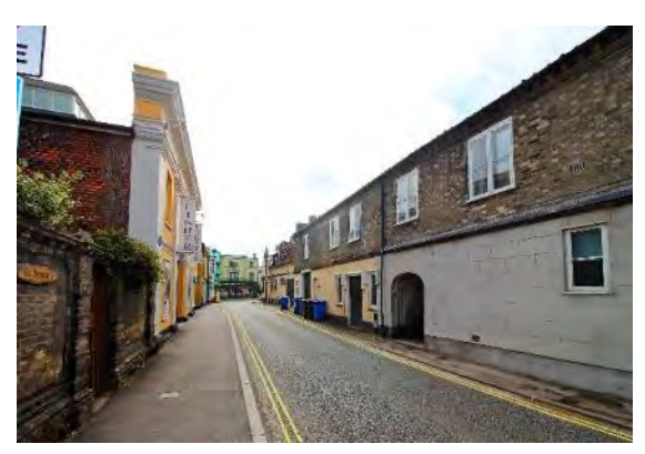
Nos. 1 &2 Bigod Flats, Broad Street

For the Three Tuns Inn see Earsham Street. For the Council Offices see Earsham House, No.12 Earsham Street, See also Nos.8-12 Earsham Street.