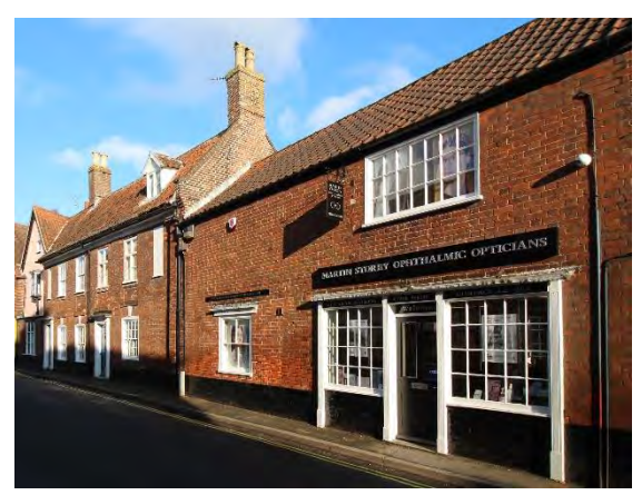
Nos.1-3a (Odd) Upper Olland Street

roundels, and a mutular cornice. Interior: fine enriched early eighteenth century mantel and cupboard with enrichment and 1/4 domed head with shell ornament.