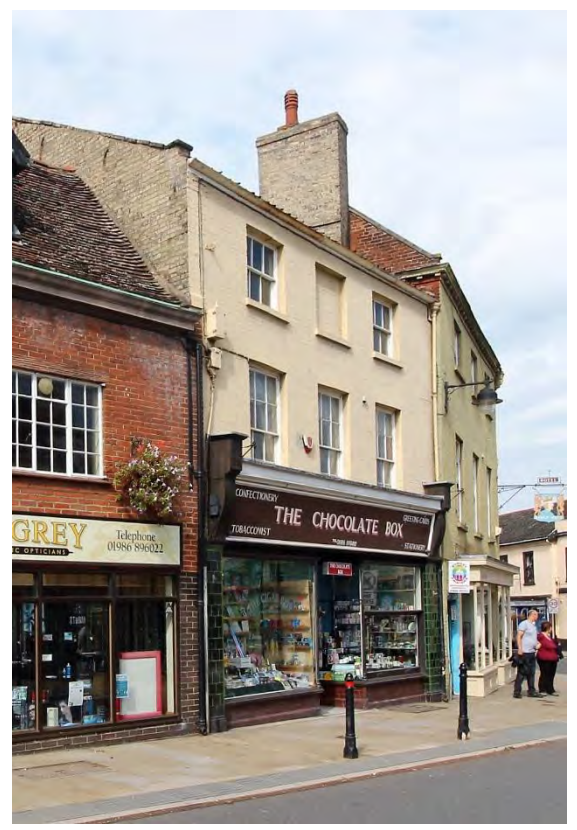
No.6 Market Place

No.6 Market Place. A mid nineteenth century shop with domestic accommodation above. Three storeys and three bays. Faced in gault brick with a painted façade. Nine light hornless sash windows to first and second floors. Second floor with blind central recess. Notable early twentieth century glazed tile shop facia with deep green and chocolate coloured tiles and carved wooden brackets. Decorative brass pilasters to entrance. The rear section of the plot on which this building stands is within the scheduled area of the Castle complex. Honeywood F, Morrow P, & Reeve C The Town Recorder, A History of Bungay in Photographs (Bungay, 1994) p135.