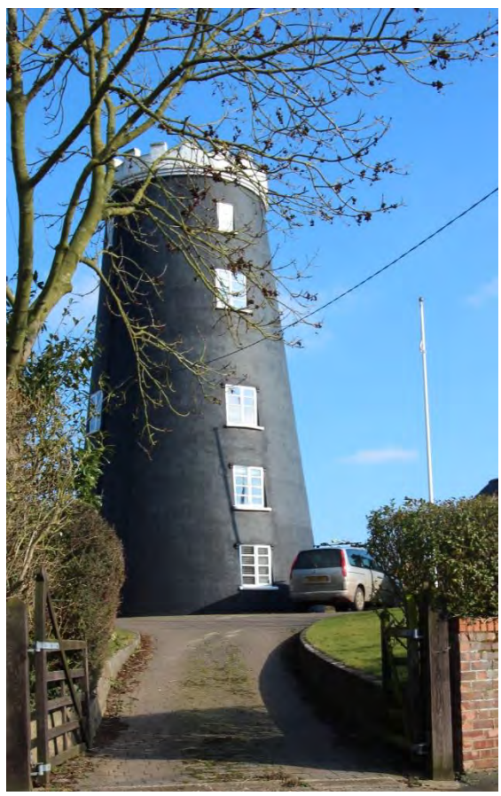
Tower Mill, Tower Mill Road

Tower Mill, Tower Mill Road (grade II). A former wind powered corn mill of c1830. The mill was in use until c1918 but its boat shaped cap, sails, fantail, and top storey were reputedly removed soon after. Now converted into a dwelling. Now a five-storey circular tower with c1924 crenellations, painted brown brick. Formerly linked to the adjoining single storey red brick engine house by a drive belt enclosed in a boarded wooden frame. Subsidiary Structures Later nineteenth century single storey red brick engine house now converted to a dwelling. This provided auxiliary power to the mill.