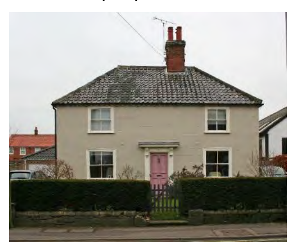
No.4 St John's Road

No.4 St John's Road (grade II) An early nineteenth century cottage with a symmetrical two storey façade of limewashed brick. Hipped black pan tiled roof and dentilled eaves cornice. Red brick ridge stack. Horned four-light plate-glass sashes within flush frames, cambered flat arches at ground floor, four-panelled door in case with console brackets and an enriched cornice. Subsidiary structures. Low red brick wall to front with the plinths of former gate piers. Probably later nineteenth century.