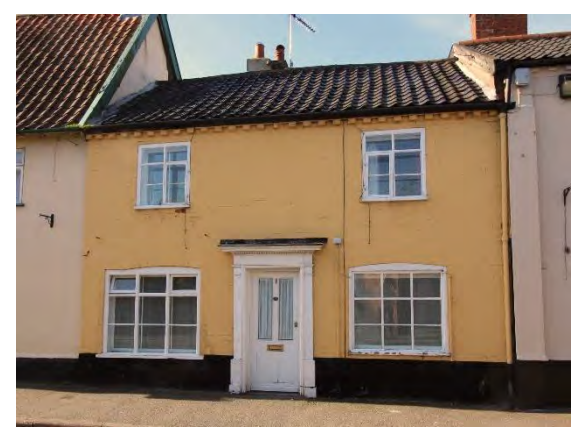
No.20 Upper Olland Street

No.18 Upper Olland Street. A mid nineteenth century shop on the southern corner of Rose Lane. Rendered and painted red brick with a black pan tiled roof. Dentilled eaves cornice, plinth. Upper Olland Street façade has a nineteenth century shop facia with reeded pilasters, containing a late twentieth century partially glazed door. Plate glass sashes with horns above. Rose Lane elevation with twentieth century casement windows. Rear gable also visible from Rose Lane, this has a canted bay window at ground floor level.