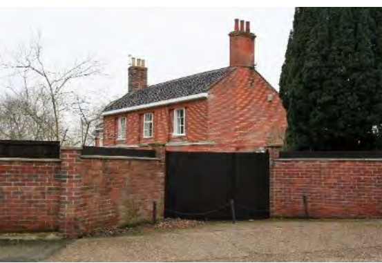
No.14 Flixton Road

Nos.10 & 12 Flixton Road and boundary walls. A semi-detached pair of late nineteenth century gault brick villas. Map evidence suggests that they were constructed between 1885 and 1905. Black pan tiled roof with decorative ridge pieces. Single storey canted bay windows to ground floor. Doors within arched recessed porches. No.12 has its original plate glass horned sashes. The windows to No.10 have been replaced with casements. Subsidiary Structures Notable stepped gault brick wall of c1890 to south side of No.12. Similar though less decorative wall to north of No.10. red brick wall with gault brick piers to Flixton Road. Gault brick gateway with arched door opening to north side of No.10. red brick garden walls to rear.