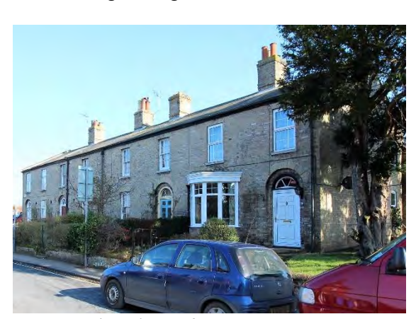
Nos.38-44 (even) Wingfield Street

Nos.16-20 (even) Wingfield Street. An early nineteenth century red brick terrace, which is now partially painted. Red pan tiled roof and dentilled brick eaves cornice. Casement windows, those to Nos.16 & 18 possibly original. Those to the ground floor beneath segmental arched lintels. Sixpanelled doors to Nos.16 & 18. No.20 with a partially glazed door. A further house in the terrace No.22 has been heavily altered and is therefore not worthy of inclusion. Nos.16-20 contribute positively to the setting of the grade II No.14.