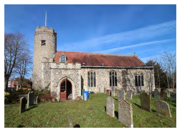
Holy Trinity Church, Trinity Street

Outbuildings to rear of No.19 Trinity Street (grade II) Eighteenth century, including former stables, red brick, pan tiles, wind vane, L-shaped on plan, of a single storey, part with loft. Nos.1 to 19 (odd) form a group.