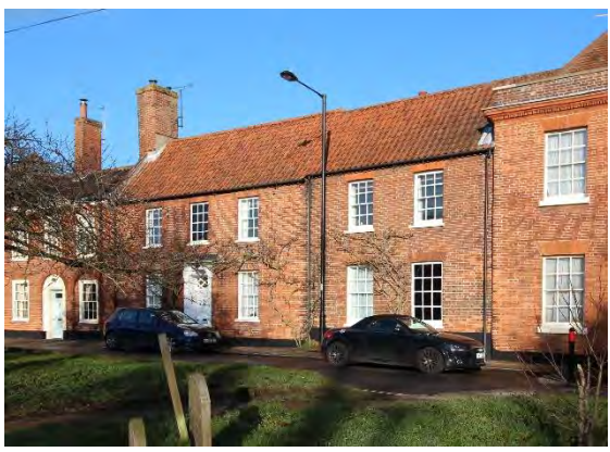
No.17 Trinity Street

No.15 Trinity Street (grade II). Late seventeenth century with eighteenth century red brick façade. Two storey, red brick, wood cornice, black pan tiled roof. Twelve light hornless sashes in flush frames. Flat arched lintels. Pair of arched recesses under each right-hand window the left-hand one containing a five-panelled door, the right a twelve-light sash. Nos 1 to 19 (odd) form a group.