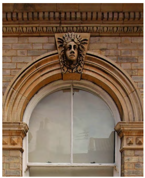
Detail of former banking hall, Nos.12-16 (even) Broad Street