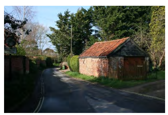
Outbuilding, The Keep, Castle Orchard

setting of the Castle ruins and directly abuts the scheduled monument.