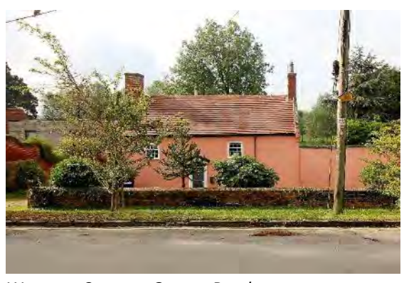
Waveney Cottage, Outney Road

Waveney Terrace, Nos.24-34 (even). Outney Road with boundary walls. A terrace of six substantial houses in three mirrored pairs of c1881. Shown on the 1885 1:2,500 Ordnance Survey map. Red brick with a gault brick façade and stone dressings. Welsh slate roof and corbelled eaves cornice. Each house is of two bays, one with a full height canted bay window. The other containing an arched porch with a pronounced key stone. Four-light plate glass sash above. Four panelled doors with glazed arched upper lights. Horned plate glass sashes. Late nineteenth century low gault brick boundary wall with square section gault brick gate piers. Decorative iron railings and gates now removed. Glazed tile paths to front doors of a geometric design. Red brick rear boundary walls and rear elevation. A good example of a speculatively built later nineteenth century terrace retaining the bulk of its original features and joinery. Honeywood F, Morrow P & Reeve C, The Town Recorder, A History of Bungay in Photographs (Bungay, 1994) p143.