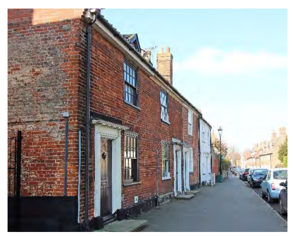
Nos.40-44 (even) Upper Olland Street

No.38 Upper Olland Street (grade II). Eighteenth century, of two storeys and an attic. Limewashed brick with a black pan-tiled roof. Two hornless, flush-framed twelve-light sash windows to each floor, cambered arched lintels to ground floor openings. Six-panelled door in wooden case with roundels and a mutular cornice. Nos.30 to 34 (even), Emmanuel church and Nos.38 to 52 (even) form a group.