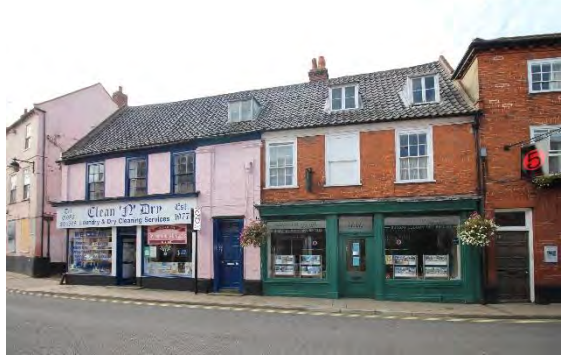
Nos.1-3 Earsham Street

Nos.1-3 Earsham Street (grade II). An eighteenthcentury house, now converted to shops. Of two storeys and an attic, with three dormers set within a black pan tiled roof. Red brick, with a coved cornice. A pair of two storey brick pilasters with stucco caps flank the central entrance, with a blank panel above at first floor level. Six twelve-light sashes with flush frames. Central six-panelled door (No.1) with lozenged fanlight and case with reeded architrave and roundels. Twentieth century shop facia to No.1, and an early nineteenth century wood shop front, to No.3 with a central entrance and pilasters. The section to the left of the door is a later addition to the original facia. Nos.1 to 19 (odd) form a group. The rear section of the plot on which this building stands is within the scheduled area of the