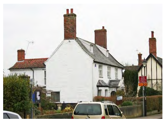
White House, No.32 Upper Olland Street

applied half-timbering, steeply pitched black pan tiled roof, cove cornice, two late twentieth century casements at first floor level. The ground floor detailing recorded in the statutory list has now gone including the doorcase, shop facia and casement window. Late twentieth century shop facia. Thin red brick at base of chimney shaft. Twin gabled northern return elevation. Early casement within front gable. Nos.30 to 34 (even), Emmanuel church and Nos.38 to 52 (even) form a group.