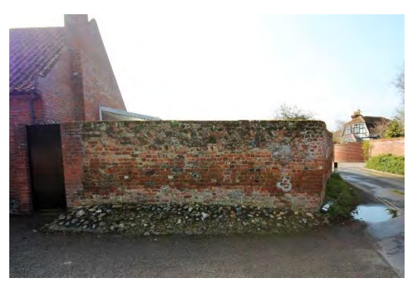
Boundary Wall, Clover Corner, Castle Orchard

The Fleece Hotel, Nos.8-10 (even) St Mary's Street and Inn yard walls (grade II). Early seventeenth century with a later eighteenth century red brick façade, which was rendered and had applied decorative timber-framing added c1920. Ground floor cement rendering in imitation of red brick. Main block has a three storey, three bay principal façade with hornless sixteen-light sashes within flush frames to the first and second floors. Tripartite sashes to ground floor. Painted wooden doorcase with Doric ½ columns and an unusual bed mould to the cornice. Six-panelled door. Black pan tiles to front face of roof, red to rear face. Left-hand wing formerly with shop front now tripartite sashes. At first floor level a long casement window with leaded lights. Small gable of c1920. Rear elevation also with applied timber-framing. Red brick rear range with red tile roof. Interior: evidence of timber-frame construction, oak corner cupboard and original doors. Nos.6 to 22 (even) form a group. Subsidiary structures. The inn yard at the rear (entered from Castle Orchard) is surrounded by red brick walls of primarily nineteenth century date. Some earlier sections which appear to have originally been part of structures. Twentieth century weatherboarded outbuilding. (See also Clover Corner, Castle Orchard) Honeywood F, Reeve C, & Reeve T, The Town Recorder, Five Centuries of Bungay at Play (Bungay, 2008) p148-149.