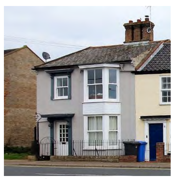
No.9 St John's Road

preserved to first floor. The sashes to the canted bays also appear to be original. Partially glazed four panelled doors and doorcases with decorative corbels. Subsidiary Features Low gault brick boundary wall to street formerly with cast iron spear type railings and hooped cast iron gates.