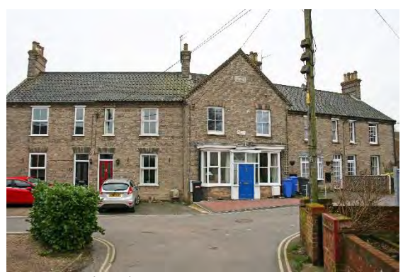
Nos.33-41 (Odd) Southend Road

Nos. 9 & 11 Southend Road. A semi-detached pair of mid-nineteenth century houses. Principal façade of red and blue brick with painted stone dressings and quoins. Shallow pitched Welsh slate roof with deep overhang to eaves. Neo-Norman arched doorcases with quarter pilasters and dog tooth frieze. Original arched six-paneled doors. No.11 retains its fourpane horned sashes. No.9 with casement windows and shutters. Substantial twentieth century additions to the rear.