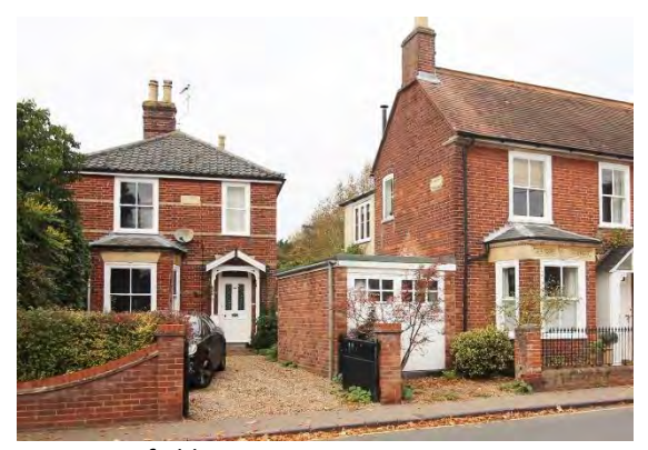
No.1 Wingfield Street

No.1 Wingfield Street. Detached villa of c1900. Red brick with a black glazed pan tiled roof. Stone dressings. Horned sash windows and partially glazed four-panelled door. Twentieth century wooden porch. Canted bay window to western bay of ground floor.