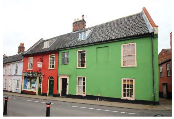
Nos.12-14 (even) Bridge Street.

missing. Four-light plate glass sashes to rear range fronting Borough Well Lane. Nos.6a & 6b were once the Green Dragon Public House and are shown as a public house on the 1885 Ordnance Survey map. The pub reputedly closed c1909. Nos.2, 4, 6a & 6b, 12 to 20 (even) 24 to 34 (even), 40 to 44 (even) 48 and 50 form a group. Reeve C, Bungay Through Time (Stroud, 2009) p57. Honeywood F, Reeve C, & Reeve T, The Town Recorder, Five Centuries of Bungay at Play (Bungay, 2008) p97 & 132.