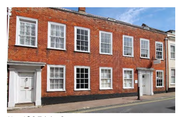
Nos.1&3 Trinity Street

Nos.1&3 Trinity Street (grade II). A pair of eighteenth-century houses with a unified seven bay two storey red brick façade to Trinity Street. Attic floor lit by dormers largely hidden behind parapet with a rendered cope. Pan tiled roof. Two false windows painted to look likes sashes. Twelve-light hornless sash windows within flush frames, and beneath flat arches. Where windows have been replaced the replacements have horns. Lead rainwater heads. No.1 has a six-panelled door in wooden Doric case. No.3 with a six-panelled door, panelled reveals, fluted pilasters, frieze with swag enrichment and centre medallion head. Nos.1 to 19 (odd) form a group.