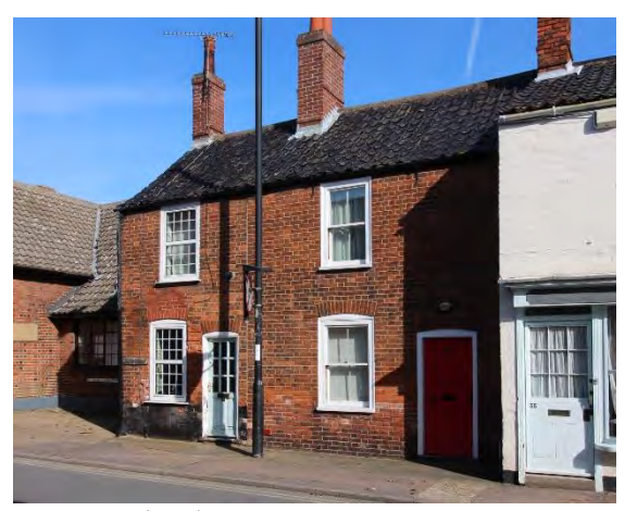
Nos.31-33 (odd) Lower Olland Street

No.29 Lower Olland Street. Former fire station built in 1930, of red brick over a concrete plinth. Single storey with decorative Dutch gables to return elevations and central section of entrance façade. Black concrete pan tile roof. Concrete lintels and small pane metal framed casement windows. Original top lit folding doors. A stylish and externally little altered piece of interwar design. According to research by Christopher Reeve the architect was Frederick J Meen of Beccles, the contractors Bedwell of Bungay and the cost £800. Honeywood F, Morrow P & Reeve C, The Town Recorder, A History of Bungay in Photographs (Bungay, 1994) p69.