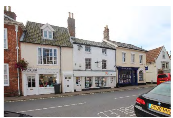
No.19 Earsham Street

No.17 Earsham Street (grade II) Early eighteenth century, two storey and attic, gabled dormer, pantiles. Brick, painted. three-light sash window with flush frame and glazing bars. Early nineteenth century shop front with pilasters, modillion cornice (covered), and modern glazing. Separate sixpanelled door in wood case. Nos.1 to 19 (odd) form a group. The rear section of the plot on which this building stands is within the scheduled area of the Castle complex.