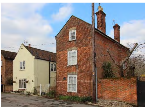
No.49 Staithe Road

Millers Cottage, No.47 Staithe Road. Detached dwelling with gable end to street probably dating from c1800. Two storeys. Rendered façade and red pan tiled roof. Late twentieth century casement windows. Red brick stack to western roof slope. Ground floor casement in gable replaces a door and a small sash window.