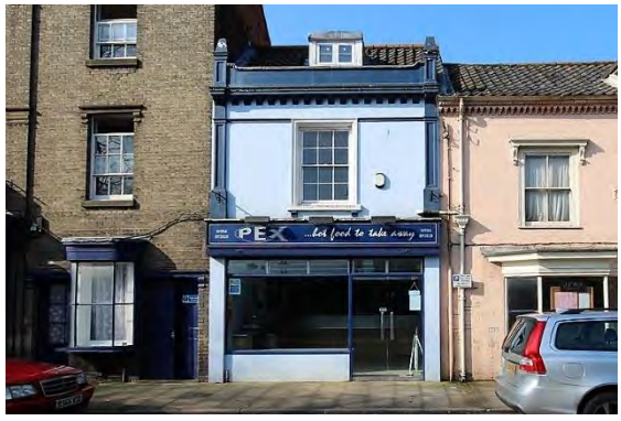
No.34 St Mary's Street

Nos.30-32 St Mary's Street. A mid nineteenth century re-fronting of an earlier structure. Its Suffolk white brick façade is now partially painted. Stone dressings. Black pan tiled roof. Canted nineteenth century wooden shop fronts. Four light plate-glass sashes to the first floor with corbelled hoods.