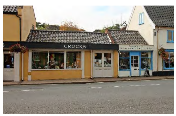
Nos.9-11 Earsham Street

No.7 Earsham Street (grade II). A house and shop of eighteenth and early nineteenth century date. Of two storeys and an attic and faced in painted brick. First floor platt band, plinth, black pan tiled roof. Two sash windows to each floor with glazing bars and flush frames, cambered arches to ground floor windows. Four-panelled door in stucco case with consoles. Modern shop facia in small wing on righthand end. Nos.1 to 19 (odd) form a group. The rear section of the plot on which this building stands is within the scheduled area of the Castle complex.