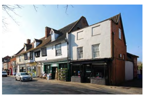
Nos.14-18 St Mary's Street

No.12 St Mary's Street (grade II) Later eighteenth century, three storey, red brick, with a stuccoed façade and a stone cope. Pan tiles. Good wooden shop facia with a central door and rounded corners to the flanking bays, later twentieth century glazing. Two twelve-light hornless sashes at first floor level. Two blank panels to second floor. Flush frame sash window in gable on norther return elevation. Nos.2-22 (even) form a group.