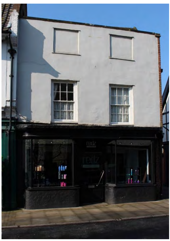
No.12 St Mary's Street

No.12 St Mary's Street (grade II) Later eighteenth century, three storey, red brick, with a stuccoed façade and a stone cope. Pan tiles. Good wooden shop facia with a central door and rounded corners to the flanking bays, later twentieth century glazing. Two twelve-light hornless sashes at first floor level. Two blank panels to second floor. Flush frame sash window in gable on norther return elevation. Nos.2-22 (even) form a group.