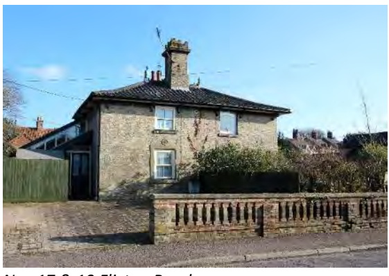
Nos.17 & 19 Flixton Road

Autumn Cottage, No.13 Flixton Road (grade II). A pair of semi-detached cottages; now converted to a single dwelling. Early nineteenth century. Symmetrical two storey, and three-bay principal façade with a hipped black pan tile roof. Central white brick stack rising from former spine wall and façades of Suffolk white brick. Eaves soffit. Two windows, casements in reveals with flat- arches. Plain door, left, in reveals with flat arch. Central arched blank panel at ground floor. Former entrance (to former No.15) filled in. Nos.9 to 13 (odd) form a group.