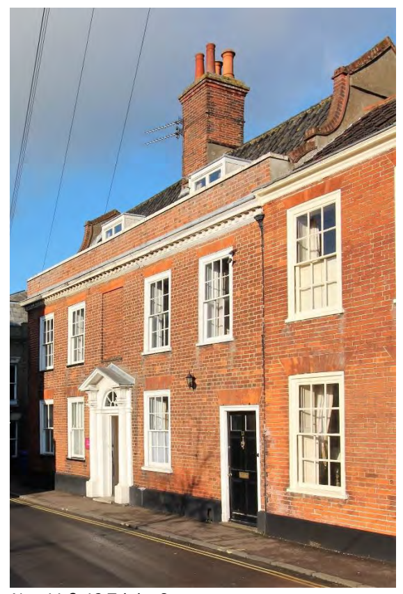
Nos.11 & 13 Trinity Street

For Nos.1-9 (Odd) See the Market Character Area.