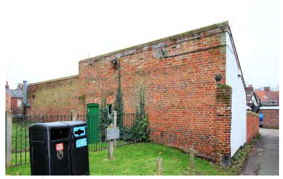
Jester's Shop, The Keep, Castle Orchard

Keeper's Cottage and boundary wall, Castle Orchard (standing on scheduled land). A nineteenth century cottage with extensive later twentieth century alterations and additions, built within the remains of the Castle complex and within the scheduled ancient monument. Its rear retaining wall is part of the Castle wall. Original cottage has rendered walls and a black pan tiled roof. Red brick ridge stack. Two storeys with a single storey wing. Twentieth century flat roofed porch. Return gable with twentieth century timber oriel window to first floor. Lower red pan tile roofed range to rear. Twentieth century casement features. windows. Subsidiary Good nineteenth century flint wall.