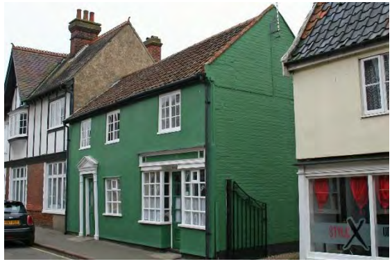
No.26 Upper Olland Street

No.26 Upper Olland Street. Probably of early nineteenth century date but much altered. Painted and rendered red brick. Red pan tiled roof. Three small pane casement windows to first floor. Late twentieth century pedimented doorcase and shop facia. Whilst much of the external joinery has been replaced the openings correspond to those shown on early twentieth century photographs. The building has significant group value with neighbouring properties.