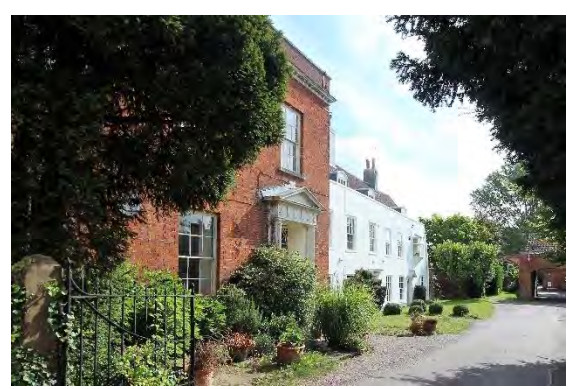
Bridge House No.34 Bridge Street

painted brick with a coved cornice. Nos.30-32 with platt band below first floor windows. Sash windows to Nos.28 and 30 now horned late twentieth century replacements. Those to No.32 nineteenth century plate-glass sashes. Early nineteenth century bowed shop windows to Nos.28 & 32, but the original glazing bars to No.28 only. Doorcase to No.28 replaced in twentieth century and containing a partially glazed twentieth century door. Nos.30-32 have c1800 wooden doorcases, No.30 with a sixpanelled door with cornice frieze and architrave. No.32 door with 4 flush panels. Low cobble boundary wall with red brick dressings between Nos.26 & 28. Large altered outbuilding to rear of No.28 of two storeys with a gable end to Bridge Street. Nos.2, 4, 6a & 6b, 12 to 20 (even), 24 to 34 (even) 40 to 44 (even), 48 and 50 form a group.