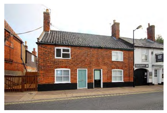
Nos. 14 & 16 Chaucer Street

No.12 Chaucer Street. A mid nineteenth century dwelling, now (2017) offices. Painted red brick with a black pan tile roof. Two storeys and two bays with a cart entrance to the rear yard in the left-hand bay. Window joinery replaced in the early twenty first century. Doorcase with panelled pilasters and scrolled corbels. Door within a later twentieth century partially glazed one.