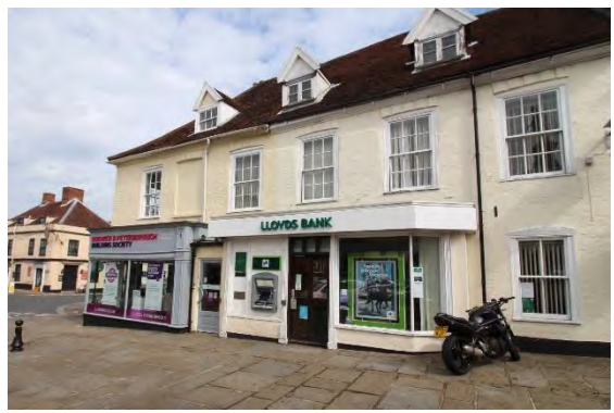
Nos. 9 & 11 Market Place

No.7a Market Place. Former outbuilding now a dwelling, probably of early nineteenth century date. Red and blue bricks. Two storeys. Original openings retained on ground floor. Shallow arched brick lintels. First floor opening probably an enlarged former taking-in door. Blind gabled return elevation.