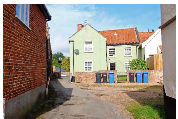
Nos.69-71 Earsham Street from Castle Lane, the wing on the left was formerly a separate cottage.