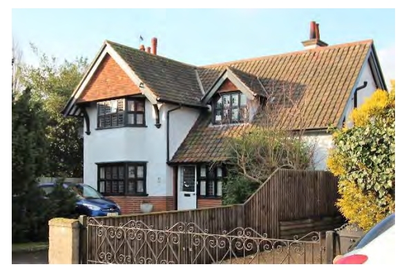
No.16 Scales Street

Bedford House No.14 Scales Street and front garden wall (local list). Early twentieth century detached villa designed and built by John Doe. Inventive free Arts and Crafts Tudor vernacular style. Red brick and rough cast elevations. Wooden mullioned and transomed windows with leaded lights. Scales Street elevation gabled with plain tile hung apex which projects and is supported on a full height wooden veranda. Late twentieth century pan tiled roof with original flat roofed dormers. Subsidiary Structures Low contemporary concrete garden wall to Street frontage with balustrade. Bettley, J, and Pevsner, N, The Buildings of England, Suffolk: East (London, 2015) p.155.