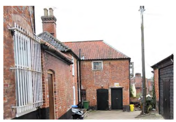
Rear range of No.4 Bridge Street from Trinity Street

Nos.4, No. 6a & 6b Bridge Street and garden walls to rear. (grade II). Standing on the corner of Borough Well Lane and probably of early eighteenth century date. Of two storeys and an attic, with a low two storey rear range facing Borough Well Lane. Rendered and painted with a platt band below the first-floor windows. Four-light plate glass sashes with horns to the first floor. One gabled dormer to No.4 within a replaced red pan tiled roof. No.4 is shown with a shop facia to the ground floor right on c1920 photographs, but this has been replaced by a tripartite sash. To the left of the four-panelled front door is a relatively recent four-light horned sash, in a segmental arched opening. A small central window at first floor level is also shown on early photographs. To the rear of No.4 is a red brick range with an elevation facing a yard off Trinity Street. This has a black pan tiled roof to Borough Well Lane and a red pan tiled roof to its other faces. A late nineteenth century wooden oriel window is set within the end wall at first floor level. Below this window there was evidently a further recently demolished single storey projection