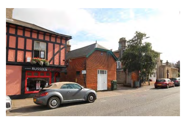
No.18a, Broad Street

Forecourt Wall to No.16 Broad Street (grade II). Early nineteenth century, curved on plan, yellow brick screen wall about eight feet high with stone cope and arched doorway, and with square pier with damaged stone finials.