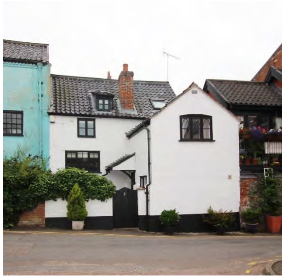
No.3 Nethergate Street