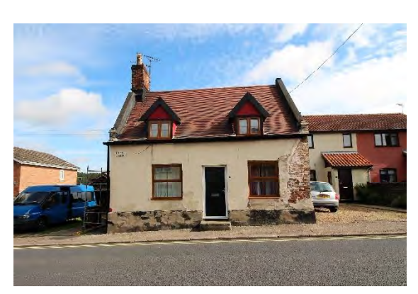
No.86 Broad Street

Former Saint Mary's Parish Rooms, Broad Street. Former parish rooms and Sunday School built in 1882, but in a highly conservative style. Formerly with a Church of England Sunday School to the ground floor, and a mission hall above. Reputedly used as a soup kitchen in the two World Wars. Red brick with a shallow pitched red pan tile roof with blue tile stripes. Overhanging eaves with bargeboards to return elevations. Five bay, two storey, principal façade in a restrained gothic style. Painted stone dressings. Cambered brick arched windows to ground floor with painted stone rusticated keystones. Casement windows replaced with PVCu. Principal entrance in gabled bay to right with arched window at first floor level. Painted stone sill bands, with date stone below that to the ground floor. Closed c1939 and later a store and retail premises. Marked as a shoe factory on the 1969 Ordnance Survey map. Saint Mary's Church itself was declared redundant in 1977. Honeywood F, Morrow P & Reeve C, The Town Recorder, A History of Bungay in Photographs (Bungay, 1994) p14.