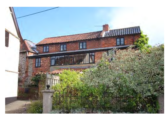
No.4 Castle Lane

pitched red pan tiled roof. Possibly of mid eighteenth century origins. Plat band above ground floor windows. Central red brick ridge stack. Dentilled eaves cornice. Entrance in gabled eastern return elevation. Four-panelled door with glazed upper lights. Western return elevation blind. Plain wooden bargeboards. Flat roofed single storey rear addition on site of earlier range shown on historic Ordnance Survey maps. Later twentieth century wooden casement windows. Group value with the grade II listed Nos.69-73 (odd) Earsham Street.