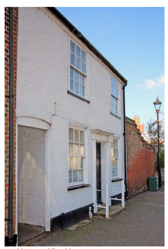
No.38 Upper Olland Street

No.34 Upper Olland Street (grade II). An early nineteenth century detached villa with a symmetrical classical entrance façade of three bays. Of two storeys with attics lit from within the gabled return elevations. Suffolk white brick façade with a mutular cornice, and a black pan tiled roof. Rear elevation red brick, side elevations rendered. Three twelve-light hornless sashes within flush frames at first floor level. Two further twelve-light sashes with flat arched lintels flanking the doorcase. Sixpanelled entrance door with arched patterned fanlight in an enriched wooden case. Northern return elevation highly visible from chapel graveyard. Rear elevation with nineteenth century casements beneath cambered lintels. Subsidiary Structures Screen walls to the left and right at a right-angle, each seven feet high with a stone cope, with a side door and blank panel respectively, square section piers. Low brick wall to front. Nos.30 to 34 (even), Emmanuel church and Nos.38 to 52 (even) form a group.