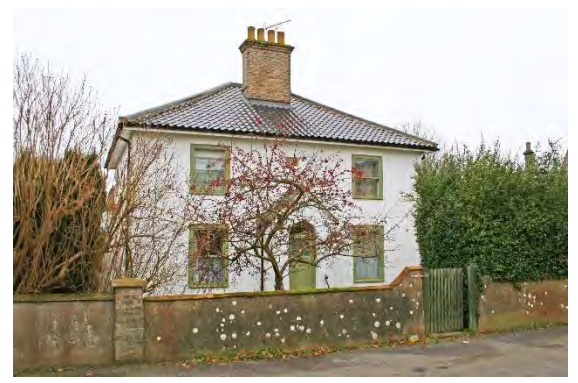
No.2 Bardolph Road

Henham Villa, No.2 Bardolph Road, boundary walls, and outbuilding. Early nineteenth century villa with later additions. Stuccoed with a hipped black pan tiled roof. Large gault brick central stack. Symmetrical façade with four-light, horned, plateglass sashes. Central gabled c1900 porch. Large late twentieth century rear addition. Flanking walls to either side that to Laburnum Road concealing a single storey outbuilding. Subsidiary Structures Low partially rendered gault brick nineteenth century wall to Bardolph Road and red brick wall to Laburnum Road. Nineteenth century outbuilding with red brick rear wall, single storey with chimneystack to Bardolph Road elevation. Map evidence suggests this is a c1900 heated greenhouse. Honeywood F, Morrow P, & Reeve C, The Town Recorder, A History of Bungay in Photographs (Bungay, 1994) p188.