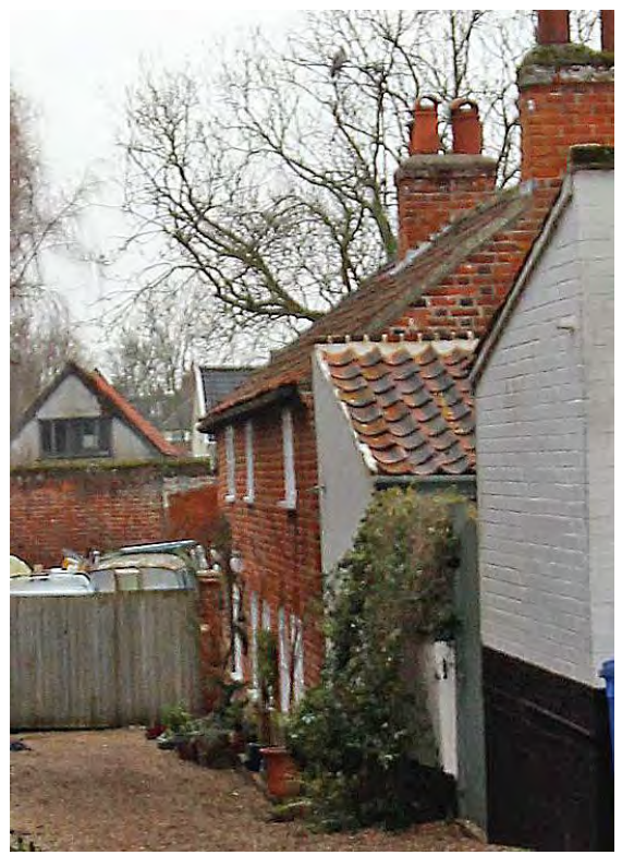
Nos.8-12 (even), Nethergate Street

Nos.8-12 (even), Nethergate Street A terrace of three c1800 cottages standing at a right-angle to the road within an alley to the rear of Nos.4 & 6. Built of red brick with a red pan tiled roof containing sloping roofed dormers with casement windows. Stack to gable at Nethergate Street end and one central ridge stack. Small pane casement windows beneath cambered brick lintels. Doors with similar lintels.