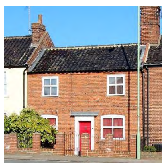
No.13 St John's Road

pilasters and six panelled doors. Late twentieth century casement windows within original openings with flat-arched lintels. Red brick stack to southern gable.