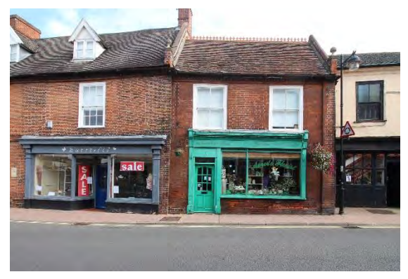
No.4a Earsham Street

No.4a Earsham Street. A structure of c1870 consisting of a shop with living accommodation above which replaced a timber-framed gabled building which is shown on early photographs. Of two storeys and two bays and faced in red brick with a red plain tile roof and terracotta ridge pieces. Southern gable with finials and dentilled cornice. Its present façade is radically different from that shown in Edwardian photographs, which show a central canted bay window at first floor level and a central doorway flanked by two small pane sashes below. Four light horned plate glass sashes at first floor level. Dentilled eaves cornice. Early to midtwentieth century shop facia, with late twentieth century partially glazed door inserted post 1977 within the original facia. Reeve C, Bungay Through Time (Stroud, 2009) p38.