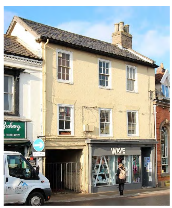
No.10 Market Place

No.10 Market Place (grade II). Probably of early nineteenth century date, with a three storey and three bay façade to the Market Place, brick,