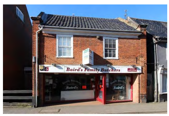
No.6 Upper Olland Street

No.4 Upper Olland Street (grade II). Eighteenth century, of two storeys with a painted stucco façade. Two flush framed mullioned and transomed casements at first floor level. The shop facia is not of nineteenth century date as suggested in the listing as it does not correspond to that in c1900 photographs. Six-panelled door. Black pan tiled roof. Nos.2 to 10 to late-(even), No.14, I6 and Nos.20 to 24 (even) form a group. Honeywood F, Morrow P, & Reeve C, The Town Recorder, A History of Bungay in Photographs (Bungay, 1994) p185.