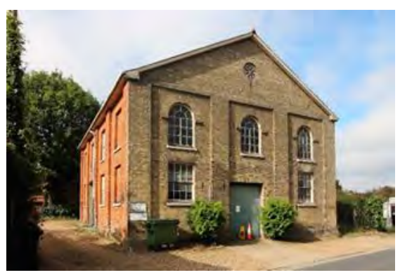
The Old Chapel (Former Bethesda Chapel)

otherwise red brick structure; Welsh slate roof. Bay window to left hand house now removed and original front door opening blocked. Present front door formed from a former window. Otherwise late nineteenth century joinery largely intact. An important part of the setting and history of the GII listed No.24 Earsham Street. Reeve C, Bungay Through Time (Stroud, 2009) p53. Honeywood F, Morrow P & Reeve C, The Town Recorder, A History of Bungay in Photographs (Bungay, 1994) p149.