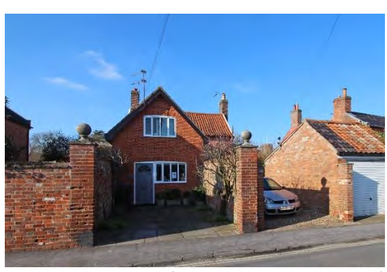
No.14 Trinity Street (Wharton Street elevation)

No.12 Trinity Street and boundary wall to rear. Substantial dwelling set back from the road. Probably early nineteenth century. Two storeys rendered facades with a hipped roof with later twentieth century replacement black pan tiles. Principal façade has moulded surrounds to windows and a canted bay window. Central ridge stack. Subsidiary Structures Red brick and cobble boundary wall to rear. Boundary walls to Trinity Street appear to be late twentieth century red brick structures.