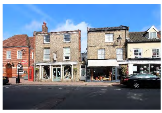
Nos.38-40 Earsham Street and telephone box

Nos.32-36 (even) Earsham Street (grade II). Eighteenth century two storey and attic, one gabled dormer. Stucco on brick, lined and painted. Pantiles. Five windows, sash, some with glazing bars and flush frames. Fine early nineteenth century wooden shop facia with three Doric columns and entablature, modern glass. Smaller modern shop front, left. Nos. 2-40 (even) form a group. Reeve C, Bungay Through Time (Stroud, 2009) p44.