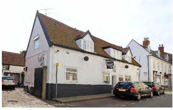
No.6 Cross Street

No.6 Cross Street and outbuilding (grade II). Former Jolly Butchers Public House; closed early twentieth century. Of early seventeenth century date, and of a single storey with attics. Timber framed and plastered. Replaced red pan tile roof covering with two gabled, and one flat roofed dormer; the latter of later twentieth century date. Later twentieth century door and casement windows. To the rear a detached former stable and cart shed probably of early nineteenth century date. Painted brick with a red pan tile roof. The building reputedly suffered bomb damage in World War Two. Honeywood F, Morrow P & Reeve C, The Town Recorder, A History of Bungay in Photographs (Bungay, 1994) p158. Honeywood F, Reeve C, & Reeve T, The Town Recorder, Five Centuries of Bungay at Play (Bungay, 2008) p140. Honeywood F, Reeve C, & Reeve T, The Town Recorder, Five Centuries of Bungay at Play (Bungay, 2008) p91-92 & 139.