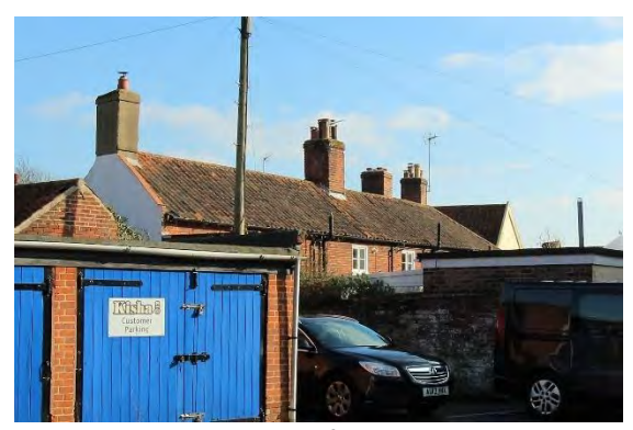
Nos.8 & 12 Turnstile Lane from Upper Olland Street

Nos.8 & 10 Turnstile Lane. The remaining section of what was once a courtyard of probably eight early nineteenth century dwellings. The surviving range appears now to form two houses but was probably originally four. Red brick, now partially rendered and with a red pan tiled roof. Dentilled brick eaves cornice. The remaining four cottages were demolished in the mid twentieth century.