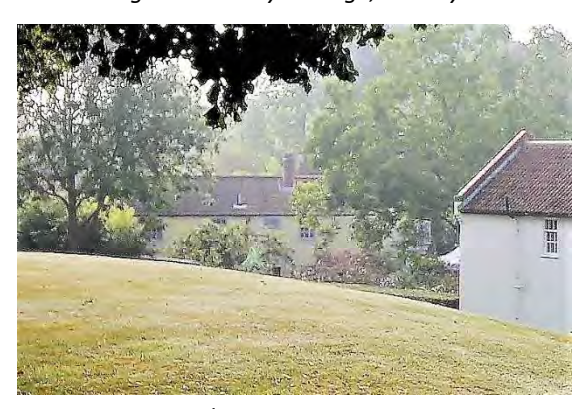
No.9 Outney Road

No.9 Outney Road. A later eighteenth century cottage of two storeys and three bays with a red pan tile roof, massively extended in the mid to late twentieth century on site of single storey range of outbuildings. Rendered façades, and external joinery largely replaced. The section between Outney Road and the central ridge brick ridge stack is all an addition to the original cottage. A further small cottage once stood immediately in front. Honeywood F, Morrow P, & Reeve C, The Town Recorder, A History of Bungay in Photographs (Bungay, 1994) p142.