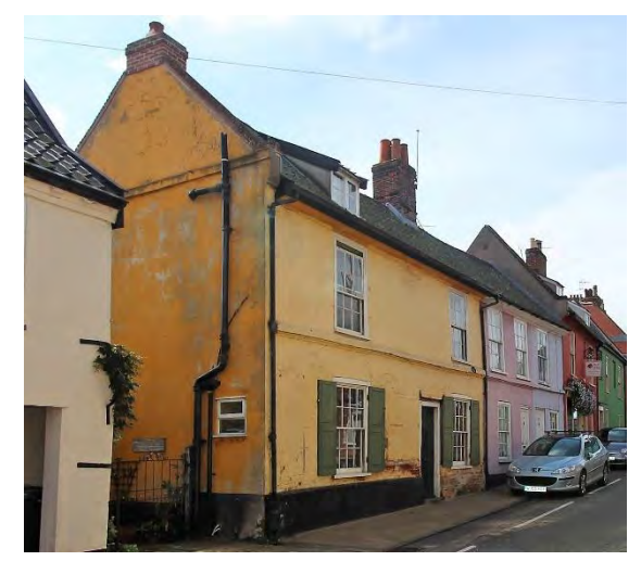
Nos.18-22 (even) Bridge Street

Nos.16-22 (even) Bridge Street (grade II). Three cottages, two within front range and No.22 at the rear. Early eighteenth century, of two storeys and an attic. Black pan tiled roof with a single flat roofed dormer to No.20. Colour-washed brick, with a moulded brick platt-band. Part with later applied projecting plinth. Nos.16-18, have their original sixteen-light hornless sashes at first floor level. To the ground floor centrally placed four panelled doors flanked by similar flush framed hornless sash windows with flat lintels. No.20 has two sixteenlight hornless sash windows to each floor. Those to the ground floor having panelled shutters. Centrally placed six-panelled door with near-flush frame. Scarring of former window openings with segmental heads visible in front wall to both ground and first floors of No.20. Lower range to the rear. Nos.2, 4, 6a & 6b, 12 to 20 (even), 24 to 34 (even) 40 to 44 (even), 48 and 50 form a group.