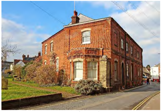
Trinity Street elevation of Owle's Warehouse

Owles Warehouse, including No.4 Trinity Street. Warehouse with attached house of red brick, with a Welsh slate roof. On the corner of Cross Street and Trinity Street. Built c1890 it replaced a large c1730 townhouse. Three bay gabled façade to Cross Street with a Diocletian widow to the gable. Seven bay façade to Trinity Street divided by pilasters rising from a plinth. Platt band above ground floor windows and heavy cornice. Windows and doors set beneath arched lintels, those to the house dressed in stone. House has principal elevation facing out over the churchyard. Four bays with splayed corner to Trinity Street with a canted bay window. A well-preserved industrial building of unusual design. Honeywood F, Morrow P & Reeve C, The Town Recorder, A History of Bungay in Photographs (Bungay, 1994) p159.