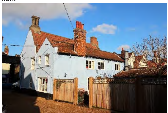
Rear range of The Castle Inn, No.35 Earsham Street

The Castle Inn, No.35 Earsham Street. Public house, formerly known as the White Lion. Reputedly an inn since the seventeenth century or earlier. Early nineteenth century roughcast rendered brick façade which is capped by a parapet which has been reduced in height, and an early to mid-twentieth century stepped pediment surmounted by a stone lion.