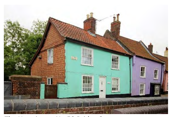
The Hermitage, No.50 Bridge Street

black pitch finish, small casement windows above. Pan tiled roof patched in various colours. Highly visible from the river side footpath. Reeve C, Bungay Through Time (Stroud, 2009) p61.