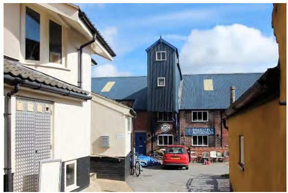
Broad Street façade of the Former Maltings, Nethergate Street

Former Maltings, Nethergate Street. A former maltings of c1900 date, with elevations to Nethergate Street and a courtyard off Broad Street. A rebuilding of an earlier maltings complex. The present structure postdates the 1885 Ordnance Survey map but is shown on that of 1905. Four storeys to Nethergate Street and two to Broad Street. Red brick with a blue corrugated metal roof. Nethergate Street façade of seven bays divided by pilasters. Casement windows and boarded doors beneath cambered brick lintels. The Broad Street façade has similar casements and is also divided by pilasters.