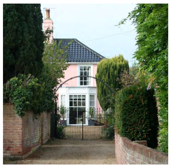
No.12 Trinity Street

panelled door with geometric glazing to rectangular fanlight. Doric fluted pilasters to wooded doorcase. No.10 and Nos 14 to 18 (even) form a group. Subsidiary Structures Low late twentieth century red brick boundary wall.