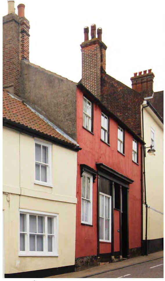
Nos.2 Bridge Street

Nos.2 Bridge Street (grade II). Formerly part of the Queen's Head Public House (see also No.3 Market Place) and probably of eighteenth, or early nineteenth century date. Painted stucco or imitation brick front of two storeys with a pan tiled roof. The first floor is lit by four, flush framed plateglass sash windows. Later nineteenth century tall wooden former public house facia with elongated pilasters. Part of the facia now contains a twentieth century casement window. Nineteenth century flush-framed plate glass sash window to ground floor left, with hood supported on consoles. Twentieth century door. Tall red brick stack to left hand gable. The Queen's Head probably closed c1913. Nos.2, 4, 6a & 6b, 12 to 20 (even), 24 to 34 (even), 40 to 44 (even), 48 and 50 form a group. Honeywood F, Reeve C, & Reeve T, The Town Recorder, Five Centuries of Bungay at Play (Bungay, 2008) p 89 & 131.