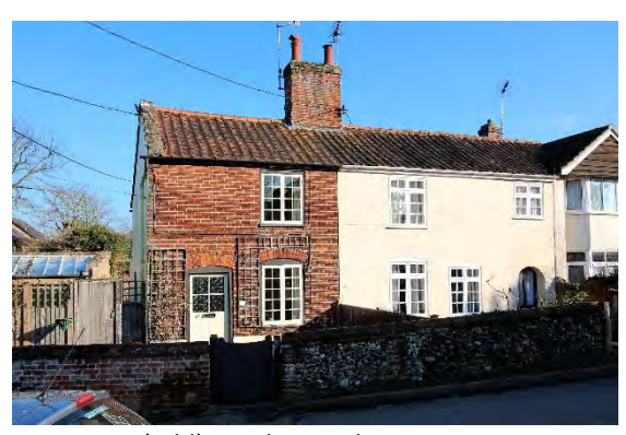
Nos.61-63 (odd) Staithe Road

Nos.1-23 (cons) The Maltings, Staithe Road. Former maltings of c1902 now apartments. Site shown as gardens on the 1892 Ordnance Survey map. Faced in painted red brick with an impressive asymmetrical fourteen bay principal façade divided by plain pilasters at first floor level. End bays gabled, and further three-bay section gabled towards centre. Steeply pitched Welsh slate roof with late twentieth century gabled dormers and roof lights. Late twentieth century window joinery of uniform design. Former taking-in doors to gables now balconied window openings. Low late twentieth century boundary wall.