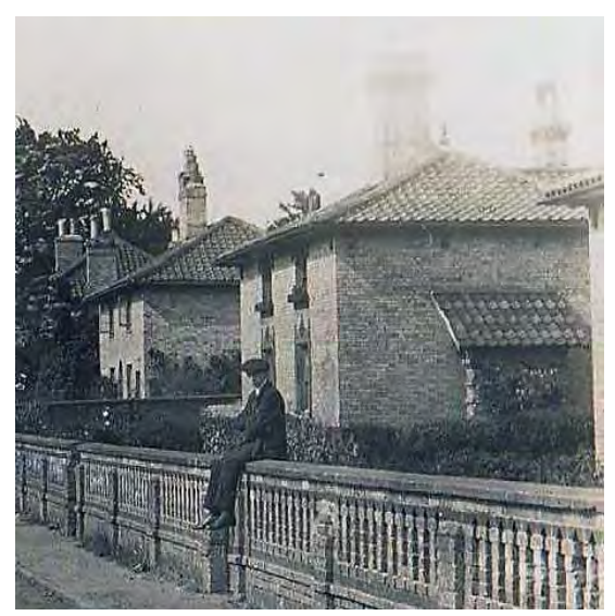
Nos.17 & 19 Flixton Road c1920

former spine wall. No.17 retains four-pane plate glass sashes, the window joinery to No.19 has however been replaced with casements. Late twentieth century glazed addition. Lean-to side porch to No.19. Subsidiary Structures: Low midnineteenth century white brick wall with red brick bands and brick balustrade. Honeywood F, Morrow P, & Reeve C, The Town Recorder, A History of Bungay in Photographs (Bungay, 1994) p190.