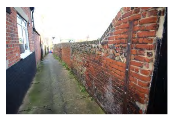
No.46 Broad Street walls to Stone Alley