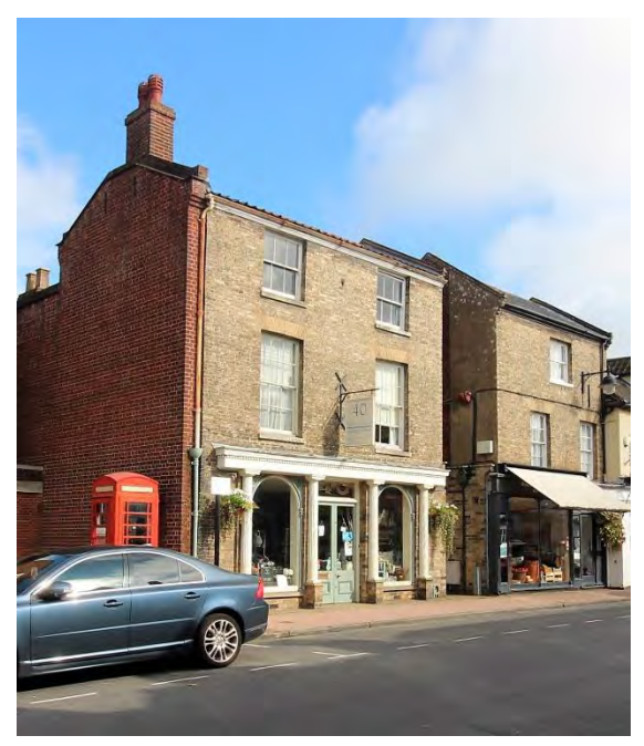
No.40 Earsham Street

No.40 Earsham Street (grade II). Probably of early nineteenth century date and built of red brick with a Suffolk white brick façade of three storeys and two bays, gauged flat arches and glazing bars to sash windows. The building's listing description describes the fine shop facia as being of nineteenth century date. It has fluted Greek Doric three quarter radius columns below a wooden entablature, central entrance with fanlight with gold leaf figures, and arched window each side with ornamental spandrels. The facia does not however, appear on late nineteenth century photographs of the building. Nos. 2 to 40 (even) form a group. Reeve C, Bungay Through Time (Stroud, 2009) p46.