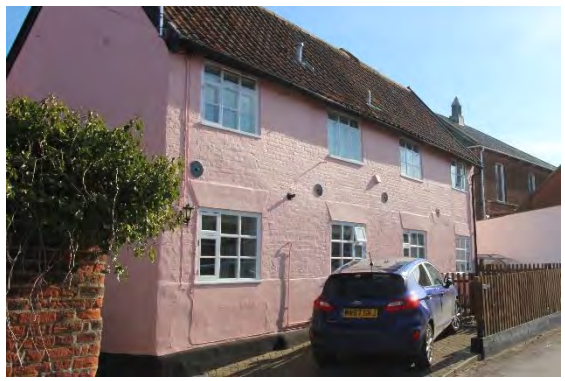
Nos.5 & 9 Rose Lane

Nos. 5 & 9 Rose Lane. A pair of cottages of late eighteenth century date, which are now a single dwelling. Painted red brick with mullioned and transomed casement windows and a red pan tiled roof. Ground floor windows have rendered flatarched lintels. Blocked doorway. Rendered northern return elevation. Substantial rendered rear range with a red pan tiled roof with a red brick ridge stack and single storey lean-tos.