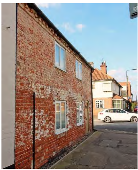
No.21 Broad Street

Cambridge House, No.19 Broad Street (grade II). Later eighteenth century façade of two storeys and three bays, with an attic lit by twin flat roofed dormers with sashes. Black pan tile roof covering with red brick stacks rising from the gable ends. Symmetrical classical façade of painted red brick with a high parapet. Three twelve light hornless sashes at first floor level beneath wedge shaped lintels. Centrally placed six-panelled front door with a wooden architrave and panelled reveals. Wooden Doric porch with an enriched entablature. Nos.15-19 form a group.