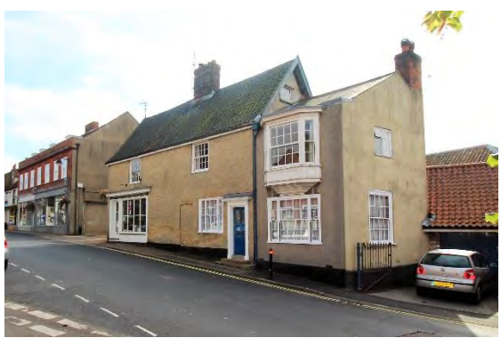
Nos.57 -59 (odd) Earsham Street

Cameron House and The Old Ironworks, Nathans Yard, Earsham Street. Remains of former Rumsby's Waveney Ironworks (closed 1966) now dwellings. The ironworks was originally established by the Cameron family in the early nineteenth century. Mid and later nineteenth century with substantial later twentieth century alterations and additions. Red pan tile roof. At the rear a flint and stone rubble structure with red brick quoins and a hipped red pan tiled roof. The Old Ironworks is largely formed from a later nineteenth century red brick former workshop range. Now partially painted, arched window openings with blue brick lintels and dentilled brick eaves cornice. Late twentieth century replicas of the original iron framed casements. Weatherboarded return elevations. Former vehicle entrance to building now infilled with boarding and containing a twentieth century six-panelled door. Narrower stone rubble section to rear. This complex partially stands within the area of the scheduled Castle earthworks and contains a section of Castle wall. It is visible from Castle Lane.