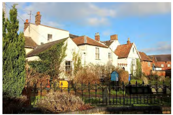
Saint Mary's Churchyard elevation of Nos.15-21(odd) Market Place including entrance to No.19a

Wall to rear of No.23 Market Place -see Saint Mary's Street