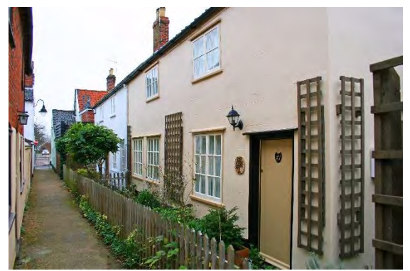
Nos.79 (Odd) Turnstile Lane

Nos.7-9 (Odd) Turnstile Lane. A terrace of four probably early nineteenth century cottages which were converted to two in the late twentieth century. Rendered façades with twelve-light casement windows and boarded doors. Red pan tiled roof, red brick ridge stacks.