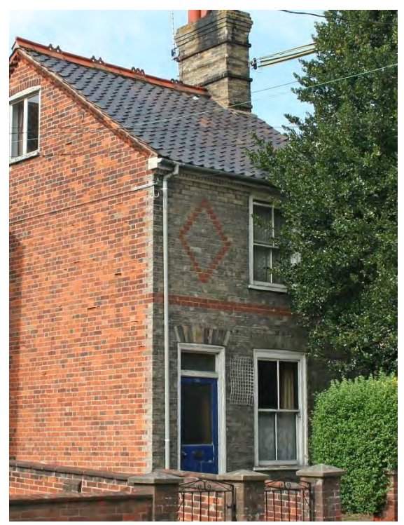
No.36 Lower Olland Street

Nos.30-34 (even) Lower Olland Street. A well-preserved row of three small terraced houses of mid-nineteenth century date. Red brick with a black pan tiled roof. Entrance to No.30 within a passage way accessed from a doorway at the far north of the Lower Olland Street elevation. Six-panelled door to No.32 with glazed upper lights. Late twentieth century panelled door to No.34. Horned sashes with margin lights and flush frames to ground and first floors. Ground floor openings with flat arched lintels.