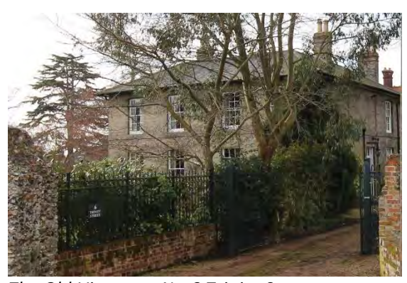
The Old Vicarage, No.6 Trinity Street

For Nos.2 & 4 (Even) including Owles Warehouse, see The Market Character Area.