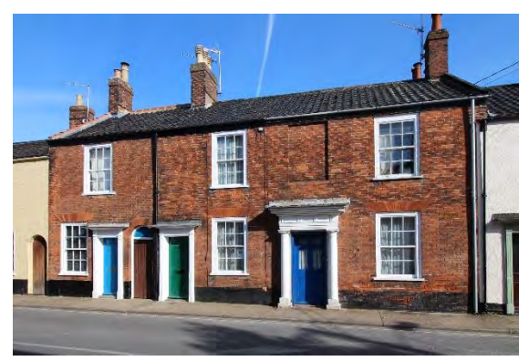
Nos.41-45 (Odd) Lower Olland Street

Nos.41-45 (Odd) Lower Olland Street (grade II). Later eighteenth or early nineteenth century, of two storeys, red brick, black pan tiled roof. Six bay façade with replaced sash windows within flush frames to each floor. Flat arched lintels to ground floor. Nos.41 and 43 have six-panelled doors in wooden cases with pilasters. No.45, a six-panelled door within an altered wooden doorcase with Doric pilasters. Blind recess above. Arched passage between Nos.41 and 43,