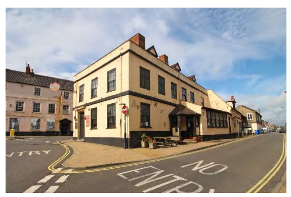
Broad Street and Market Place facades of The Three Tuns, No.2 Earsham Street

twentieth century and is not included within the listing. Hipped plain tile roof with two massive red brick ridge stacks, and three flat roofed dormers to the Earsham Street façade. Faced in painted red brick with a plat band below the first-floor windows, and a high plinth. Four first floor original leaded mullion transom windows to Broad Street front, the rest being sashes in flush frames in replacement of the originals, flat arches. At ground floor, former garage, and butcher's shop with wood fronts. Earsham Street façade of seven bays with a centrally placed six-panelled door with an arched fanlight (now blank) in a wooden case with Doric columns and an open pediment.