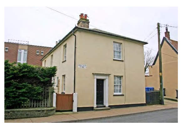
Nos.58 & 60 Lower Olland Street

Nos.52 & 54 Lower Olland Street (grade II). An early seventeenth century dwelling now altered and subdivided. Of two storeys and an attic, timber-framed and plastered with a plinth. Steeply pitched red pan tiled roof. Later twentieth century casement windows and doors. Old photographs show that it was thatched until c1920. Return elevations blind. Nos.46, 48, 52, 58 and No.60 form a group