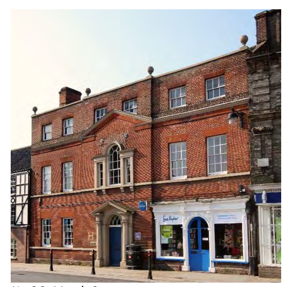
No.6 St Mary's Street

No.6 St Mary's Street and garden walls to rear (grade II). A substantial late eighteenth century townhouse. Of three storeys. Five-bay symmetrical principal façade of red brick with stone dressings. Central breakfront of a single bay, plinth, ground and first floor sill bands. The central breakfront has an open pediment at second floor level above a Venetian window with sashes. Open-pedimented doorcase with Doric 34 radius columns, triglyphs, and an arched fanlight. Six-panelled door. Twelvelight hornless sashes to ground and first floors, sixlight to second floor. Flat-arched lintels. Stone mouldings to cornice at second floor level. Stone cope with four stone ball finials. Fine midnineteenth century wooden office window to ground floor right of classical design, with consoles and an entablature. Central glazed entrance with arched door. Rendered rear range with twelve-light sashes. Subsidiary Structures. Good late eighteenth century red brick walls surrounding former rear garden. Nos.2 to 22 (even) form a group. Bettley, J, and Pevsner, N, The Buildings of England, Suffolk: East (London, 2015) p.157.