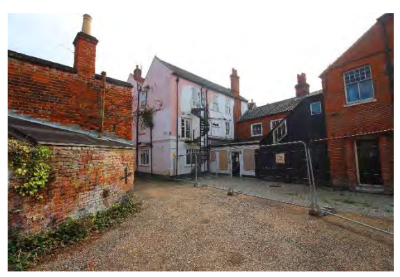
Courtyard façade, No.2 Market Place

No.2 Market Place and former Odd Fellows Hall to rear (grade II). An early eighteenth century former coaching inn which was until 2015 known as the Kings Head Hotel. It consists of two parallel ranges with a long rear wing facing a courtyard. The Market Place façade is of early eighteenth century date, and of three storeys and seven bays. Of red brick, with a plinth and a dentilled brick eaves cornice. Black pan tiles to roof and a single red brick ridge stack. Seven hornless twelve-light sash windows at first floor level with flush frames and flat arched lintels. Four similar windows to the second floor and six to the ground floor. Off-centre Six-panelled door in wooden Doric case with pilasters, a keyed architrave and a pediment. Return elevation with twin gables. Rear elevation with twelve-light hornless sashes to first and second floors.