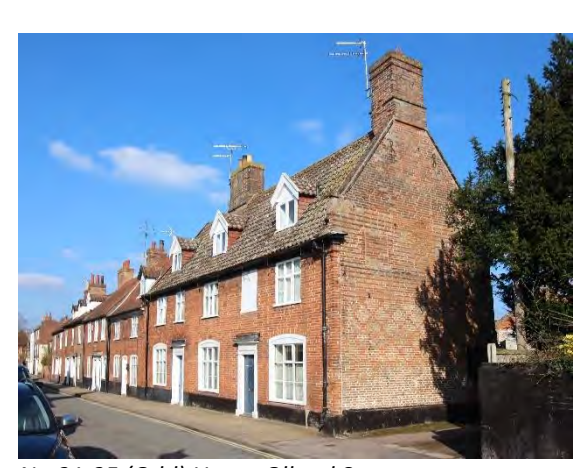
No.31-35 (Odd) Upper Olland Street

Nos.27 & 29 Upper Olland Street (grade II) Eighteenth century pair of cottages of two storeys and an attic. Red brick with a red pan tiled roof. Three-bay façade, with paired front doors to the centre under one enriched cornice. Late twentieth century panelled front doors. Nineteenth century casements to No.27, late twentieth century ones to No.29. Nos.21 to 37 (odd) form a group