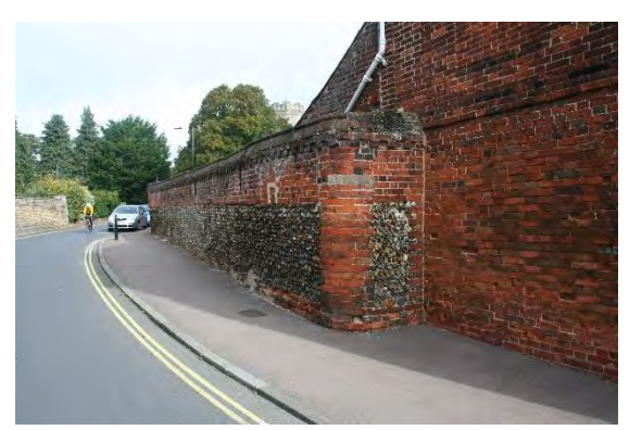
Wall of Garden to Trinity Hall, Trinity Street

brick with brick cope. Yellow brick pier with stone cap, west.