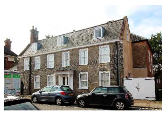
Charlotte House, Broad Street

Nos. 1 &2 Bigod Flats, Broad Street. Probably of early to mid-nineteenth century date and built as stabling and outbuildings for properties on Earsham Street. White brick with a black pan tile roof and a rendered ground floor. Restrained neo-Tudor detailing including hood mould to doorway and flanking window. Casement windows, decorative eaves cornice and dentilled string course.