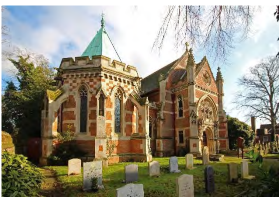
St Edmund's RC Church, St Mary's Street

Wall to south side of St Mary's Churchyard (grade II.) Eighteenth century and earlier mainly flint with red brick face on south side, moulded terra cotta, quasi battlemented cope. At each end, a square white brick pier with stone cap, west end pier with stone vase finial. Generally, about 8ft high.