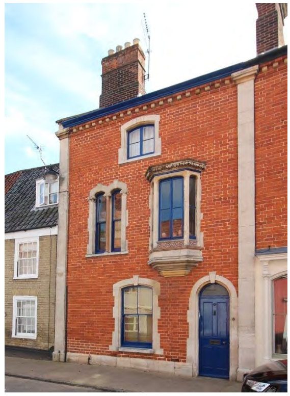
No.38 Bridge Street

No.36 Bridge Street (local list). A substantial later nineteenth century red brick former shop and dwelling with painted stone dressings, dentilled eaves cornice and full height pilasters. Plate glass sash windows. Three storey, two bay principal façade. Arched doorcase with keystone and four panelled door within rendered later nineteenth century former shop facia. Simple semi-circular fanlight. Twin shallow arched windows to left with keystones beneath a corbelled cornice. Passage way with boarded door within shallow arched opening to right. Substantial red brick chimneystack. Forms part of a semi-detached pair with No.36.