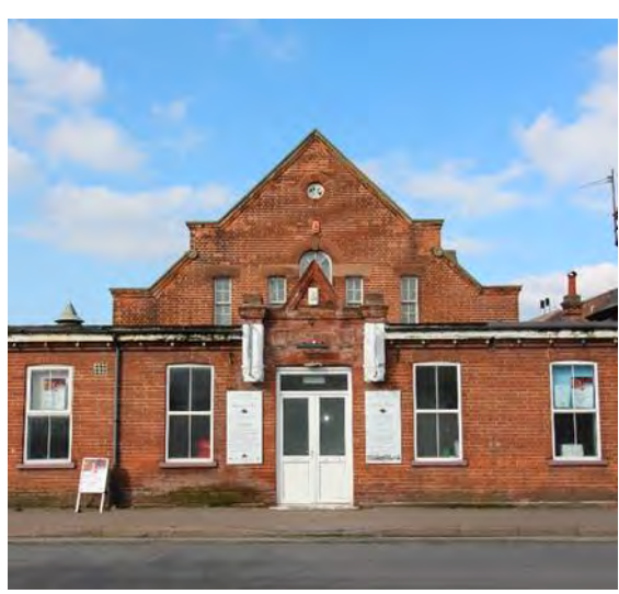
The Chaucer Club

For the Green Dragon Inn and its outbuildings see Broad Street.