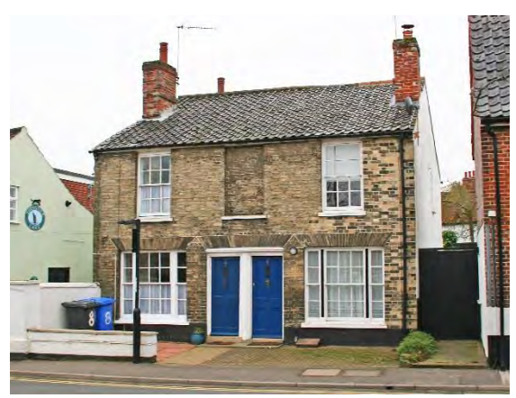
Nos. 6&8 Lower Olland Street

No.4 Lower Olland Street. Two cottages, latterly house and shop. Red brick with a steeply pitched black pan tiled roof. Possibly late eighteenth century. Well preserved later nineteenth century shop facia to southern end of a single bay. Two centrally opening casements to first floor which are possibly of nineteenth century date flanking a central blind recess. Southern return elevation partially rendered with replaced windows. Door and widow openings to ground floor with cambered brick lintels. Ground floor window at northern end now a late twentieth century four pane casement. Northern elevation rendered. Single storey rear range.