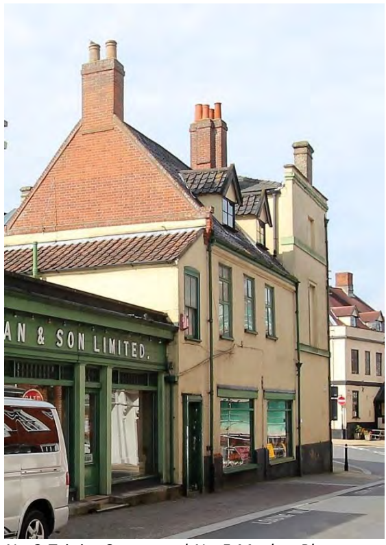
No.2 Trinity Street and No.5 Market Place.

No.2 Trinity Street (grade II). Seventeenth century and of two storeys with an attic lit by two gabled casement dormers. Limewashed brick, band cut away, plinth. Wooden cornice, black pan tiles, three first floor original mullioned and transomed casements. Six-panelled door in wing, left. Two late twentieth century plate glass shop windows to the ground floor. (See also No.5 Market Place).