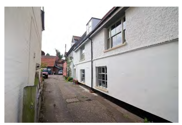
No.27 Earsham Street

Nos.23-25 Odd Earsham Street. A pair of altered c1800 cottages standing in a private courtyard to the rear of No.29. No.23 rendered and of a single storey with an attic lit by a gabled dormer. Late twentieth century window joinery. No.25, two storeys of painted brick with casement windows and a weatherboarded gabled dormer. The rear section of the plot on which this building stands is within the scheduled area of the Castle complex.