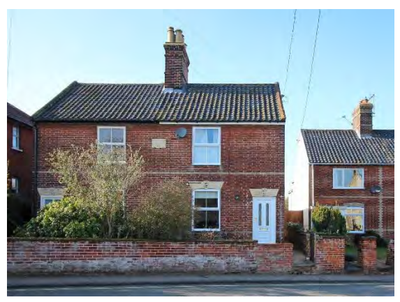
Nos.48-52 (even) Staithe Road

Nos.42-44 (even) Staithe Road. A pair of detached houses of Fletton brick c1904-10. No.42 has a Fletton and red brick façade to Staithe Road, red brick dressings, and replacement casement windows within original openings. A relatively early use of Fletton brick. No.44 with a gault brick elevation to Staithe Road with red brick dressings. Horned sash windows, and a partially glazed fourpanelled front door. Gabled wooden lattice porch. Gault brick chimney stack with red brick dressings. Fletton brick gable end. Good quality late twentieth century addition to rear. Replaced pan tile roof coverings. C1900 red brick boundary wall to Staithe Road.