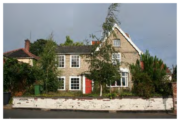
No.3 Staithe Road

No.3 Staithe Road (grade II). A detached house of later eighteenth, or early nineteenth century date. Of two storeys with a gabled attic lit by later windows. Suffolk yellow brick. Black pan tiled roof. Of three bays, the right-hand bay projecting slightly and having a gable. Twelve-light hornless flushframed sash windows. Those to the ground floor having segmental arched lintels. Five-sided canted bay window with casements to ground floor of gabled bay. Six-panelled door with wooden case. Elliptical fanlight Side door in wing wall with elliptical arch. Subsidiary structures to the right, now separated from No.3 by the entrance to a housing development, a red brick boundary wall of nineteenth century date with stone capped squaresection piers. Lower twentieth century section directly by street. Low painted brick retaining wall to front.