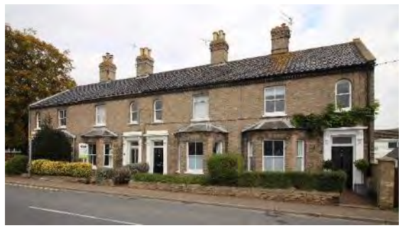
Nos.1-7 (Odd) St John's Road

Southend Terrace, Nos.1-7 (odd) St John's Road. A well-preserved gault brick terrace of 1893. Black pan tiled roof. Each house has a pilastered doorcase and a canted bay to the ground floor and at first floor level a strong course and two sash windows. The window above each doorcase is a narrow arched one. Original horned glass sashes