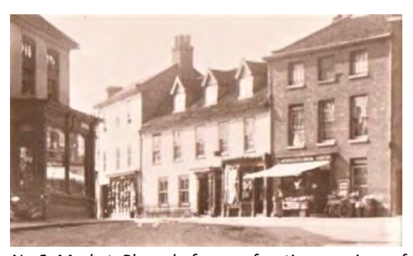
No.8 Market Place before re-fronting, a view of c1900

No.8 Market Place. Former bank and shop. c1900 red brick classical façade with stone dressings to an earlier structure. 1880s photos show a stuccoed early to mid-eighteenth century building of similar proportions on this site. Red plain tile roof with a row of three gabled dormers with bargeboards and casement windows. Rusticated red brick pilasters. Full height arched windows to left-hand section with heavy moulded surrounds and pronounced keystones. Doorcase with similar surround with robustly carved scrolled keystone. Right-hand section with small pane metal casement windows to first floor and late twentieth century shop facia. The rear section of the plot on which this building stands is within the scheduled area of the Castle complex. Honeywood F, Morrow P, & Reeve C, The Town Recorder, A History of Bungay in Photographs (Bungay, 1994) p135.