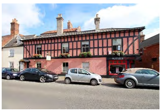
Oxnead, No.18 Broad Street

No.18a, Broad Street. Stable and coach house of later nineteenth century date. Latterly public library and now a dwelling. Not shown on the 1885 1:2,500 Ordnance Survey map, but on that of 1905. It replaces an earlier structure and was originally built to serve the house now known as 12-18 (even) Broad Street. Red brick with a Welsh slate roof. Four-light casement windows beneath shallow arched brick lintels. Boarded doors. Now converted to domestic use. Two storeys, single bay elevation to Broad Street and four bay return elevation to Brandy Lane. Garden wall earlier incorporated within Brandy Lane elevation. Further contemporary single storey red brick range to the rear. Lean-to garage addition of late twentieth century date. Possibly a curtilage structure to the grade II listed Nos.12-18 (even) Broad Street.