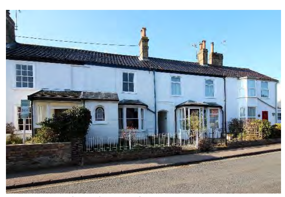
Nos.13-19 (Odd) Wingfield Street

Nos.5-11 (Odd) Wingfield Street (grade II). An early nineteenth century two storey terrace. Suffolk yellow brick, black pan tiles. Central blind panel at first floor level flanked by twelve-light hornless sashes within flush frames, flat arches at ground floor. Six-panelled doors in solid frames, set back in reveals, with blank tympana and arches. Nos.5 to 11 (odd) and No.14 form a group.