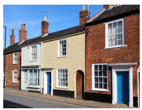
Nos.35-37 (odd) Lower Olland Street

Nos.31-33 (odd) Lower Olland Street. A pair of red brick terraced house of c1800 with a black pan tiled roof. Cambered arched lintels to window openings. External joinery replaced in the late twentieth century. Straight joint between the two properties.