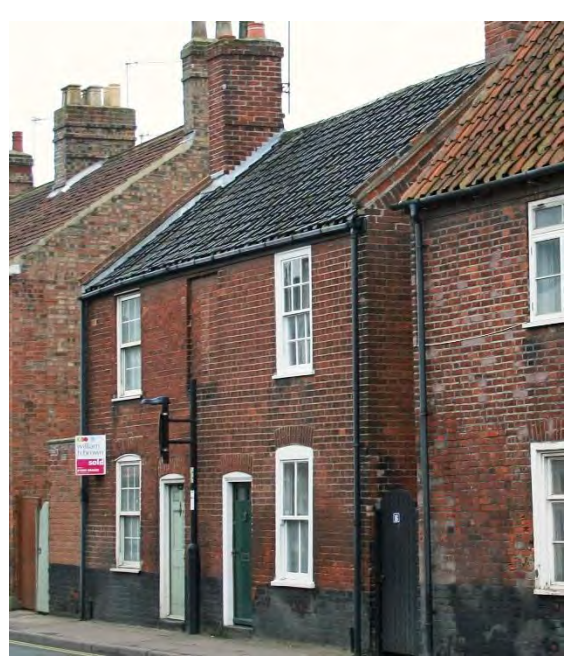
Nos.18 &20 (even) Lower Olland Street

eighteenth-century range at the southern corner of Turnstile Lane. Red brick, now partially rendered, with a red pan tiled roof. Dentilled brick eaves cornice. Turnstile Lane elevation gabled and rendered with largely late twentieth century casement windows. Four-panelled door. Blocked door opening in northern end of Lower Olland Street elevation. Poor quality late twentieth century windows in original openings. No.12 with twelve-light hornless sashes beneath flat arched lintels. Four-panelled door with a single, nineteenth century casement window above.No.14 has a nineteenth century wooden casement at first floor level and one sixteen-light sash. Four- panelled door. Cambered brick lintels. No.16 now entered from southern return elevation but with blocked opening on Lower Olland Street façade. Cambered brick lintel to ground floor window. Late twentieth century casement to ground floor and possibly nineteenth century casement above.