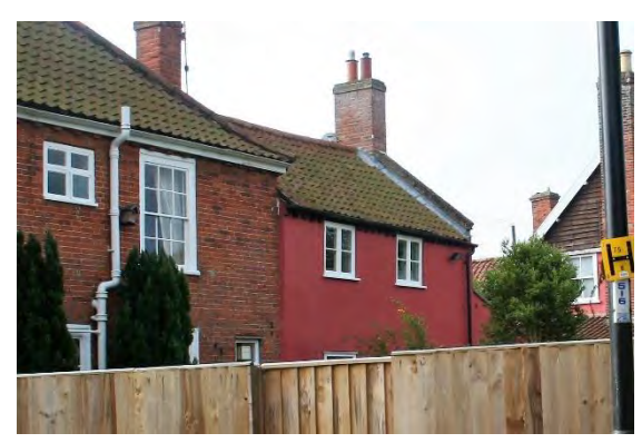
No.18a Trinity Street

No.16, 18a, & 18b Trinity Street (grade II). On the corner of Wharton Street. Two eighteenth century houses of two storeys with attics lit by three gabled dormers. Three-bay façade to Trinity Street. Twelve-light hornless sashes in flush frames, those to the ground floor with flat arched lintels. Red pan tiled roof. Six-panelled doors in wooden cases with dentilled cornices. No.16 has its entrance on the northern (return) elevation. This has three twelve-light hornless sashes in flush frames at first floor level and two similar below. Large nineteenth century casement to ground floor north-east corner. Nos.10 and Nos.14 to 18 (even) form a group. Nos.14 to 18 form a group with Nos.9, 11A & 11 Wharton Street.