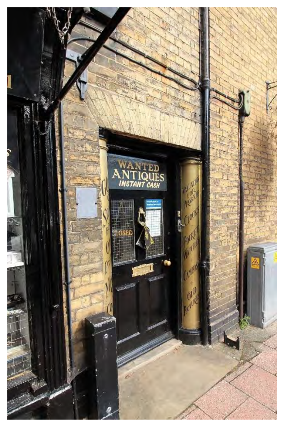
Doorcase No.28 Earsham Street

Nos.28-30 (even) Earsham Street (grade II). Mainly of seventeenth century date but with an early to mid-nineteenth century façade. Of two storeys and an attic. Two dormers with original leaded casements. Suffolk yellow brick front. Pan tiles. Two windows and blank centre panel, sash, with glazing bars and flat arches. Partially glazed six-panelled door flanked by one quarter radius Doric columns in reveals, beneath a flat arch. Wooden shop facia, the left-hand section only being evident on early twentieth century photographs. Nos.2 to 40 (even) form a group.