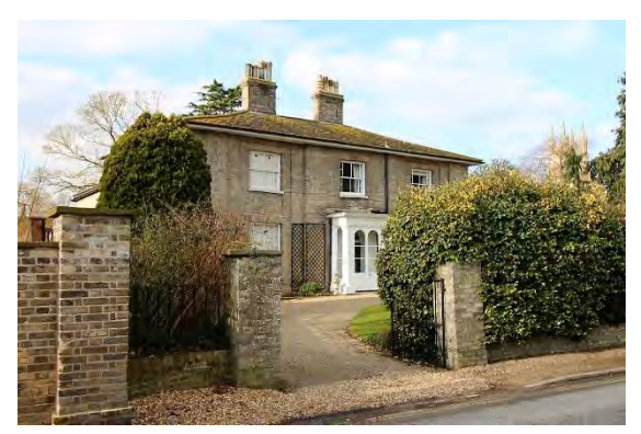
Trinity House, No.8 Trinity Street

western end. Red brick rear range. Subsidiary Structures Low brick boundary wall with iron railings.