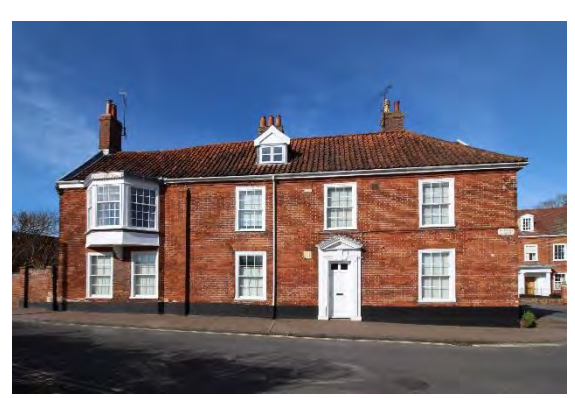
Nos.11 and 11a Wharton Street

The Hollyhocks No.9 Wharton Street and Garden Wall. A two-storey red brick house of c1820 with a black pan tiled roof. Symmetrical three bay façade with a blind recess above the doorcase. Sixpanelled front door. Twelve-light hornless sashes in flush frames. Gabled return elevations largely blind. Low red brick garden wall with taller return section.