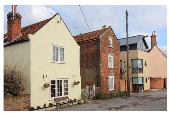
No.47 Staithe Road

workmanship, and in general the Inn is free from modernisation. Seventeenth century bolection moulded mantel. Honeywood F, Reeve C, & Reeve T, The Town Recorder, Five Centuries of Bungay at Play (Bungay, 2008) p104-106 & 168-169.