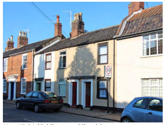
Nos.47-51 (Odd) Lower Olland Street

Nos.41-45 (Odd) Lower Olland Street (grade II). Later eighteenth or early nineteenth century, of two storeys, red brick, black pan tiled roof. Six bay façade with replaced sash windows within flush frames to each floor. Flat arched lintels to ground floor. Nos.41 and 43 have six-panelled doors in wooden cases with pilasters. No.45, a six-panelled door within an altered wooden doorcase with Doric pilasters. Blind recess above. Arched passage between Nos.41 and 43,