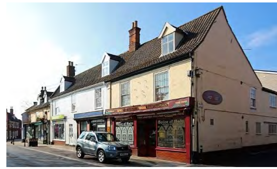
Nos.42-46 (even) St Mary's Street

Nos.36-38 (even) St Mary's Street. Early nineteenth century building of red brick, with a Suffolk white brick façade. Of three storeys and four-bays No.36 of one bay, No.38 of three with pilasters. Twelvelight hornless sash windows and a high parapet. Good possibly nineteenth century shop facia with pilasters to No.38. Nineteenth century shop window to No.36.