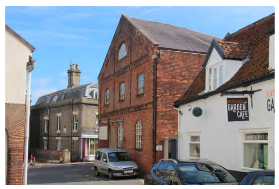
Owles Warehouse, Cross Street elevation.

to first floor. Linked to No.2 Trinity Street by a single storey flat-roofed range which based on photographic evidence probably pre-dates the two-storey section. Mid-twentieth century shop facia with pilasters and projecting boxed cornice. Bombed c1940 and partially rebuilt late 1940s. A comparatively rare and unaltered example of its kind for Suffolk. (See also No.2 Trinity Street and 5 Market Place). Reeve C, Bungay Through Time (Stroud, 2009) p9.