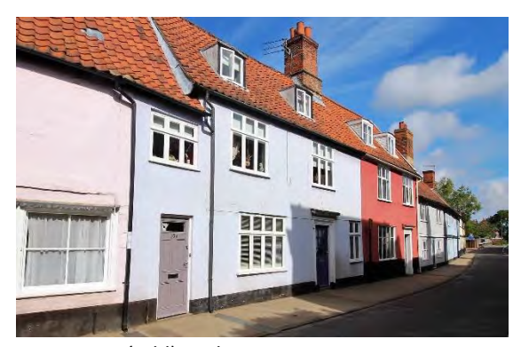
Nos. 35-37 (odd) Bridge Street

Nos.31-33 (odd) Bridge Street (grade II). Seventeenth century, and of two storeys with an attic. Two flat roofed dormers with centrally opening casements, within a red pan tiled roof. Brick colour-washed, with platt band. First floor has two early mullioned and transomed casements with flush frames which the statutory list describes as being 'original' to the present facade. Twenty-light hornless sash window to ground floor of No.31. Other ground floor windows now casements but all retain segmental arched lintels. Mid twentieth century door with oval light to No.31, twentieth century boarded door to No.33, both set within flush frames. Small nineteenth century former shop window to No.33. Nos.29 to 45 (odd) form a group.