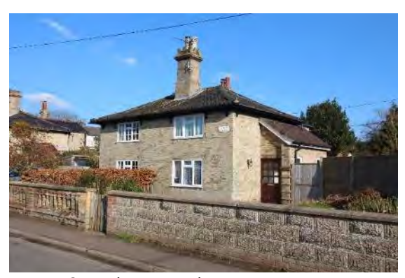
Nos.21 & 23 Flixton Road

Nos.21 & 23 Flixton Road. A semi-detached pair of cottages of probably mid-nineteenth century date. Faced in gault brick with a hipped black pan tiled roof and overhanging eaves. Central brick stack rising from former spine wall. Window openings remodelled to hold casements in late twentieth century. Included here primarily for its group value. Subsidiary Structures Low mid-nineteenth century white brick wall with red brick bands and brick balustrade. Wall to side of No.21 rebuilt in later twentieth century and not of interest. Single storey nineteenth century red brick outbuilding to rear.