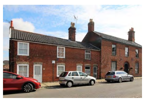
Nos.22, and 24 Broad Street

Cransford, No.20 Broad Street (grade II). An early to mid-nineteenth century dwelling with symmetrical classical façade of two storeys and three bays. Faced in red brick, with a black pan tile roof. At the first-floor level are three flush frame twelve-light sash windows with wedge-shaped brick lintels. The ground floor windows are now plate-glass sashes with narrow margin lights. Central six-panelled arched front door recessed within a double brick arch. Reeded wooden architrave with roundels at the arch's springing point, surmounted by double arch, inner set back 4½ ins. Iron segmental fanlight window, to staircase at back, with radial bars. Seventeenth century wing to the east of two storeys and an attic, rendered, with a pan tile roof. Flush frame sash window at each floor now with centre and margin bars only, four-panel door with glazed upper panels. Later twentieth century two storey rear addition.