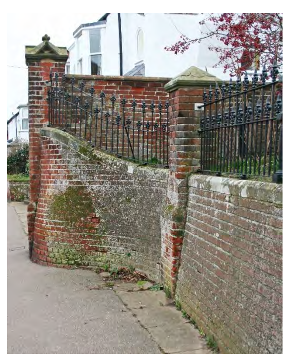
Detail of boundary wall Bungay Primary School, Wingfield Street

1914 (Kindred, Ipswich, 1991) p155. Honeywood F, Morrow P & Reeve C, The Town Recorder, A History of Bungay in Photographs (Bungay, 1994) p99-100, & 105.