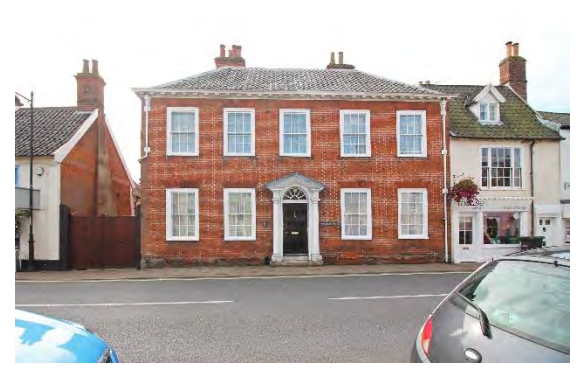
No.15 Earsham Street

No.15 Earsham Street (grade II). A substantial house with the date 1807 on its surviving original lead rainwater heads. Of two storeys and five bays with a distinguished symmetrical classical façade to Earsham Street. Red brick, plinth, and a wooden mutular cornice. Hipped black pan tile roof. Symmetrical five bay classical façade with twelvelight hornless sashes which are set within flush frames beneath wedge shaped brick lintels. Centrally placed six-panelled door, with panelled reveals to wooden case, arched radial bar fanlight, Doric columns and open pediment. Nos.1 to 19 (odd) form a group. The rear section of the plot on which this building stands is within the scheduled area of the Castle complex. Bettley, J, and Pevsner, N, The Buildings of England, Suffolk: East (London, 2015) p.154. Reeve C, Bungay Through Time (Stroud, 2009) p36.