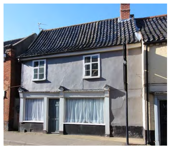
No.4 Upper Olland Street

No.2 Upper Olland Street (grade II). A seventeenth century structure with a nineteenth century façade of painted brick. Standing on the southern corner of Quaves Lane. Black pan tiled roof, dentilled eaves cornice, red brick chimney stack. First floor windows now plate-glass hornless sashes. Early nineteenth century wooden doorcase and shop facia with pilasters and delicate entablature. Nos.2 to 10 (even), 14, 16 and Nos.20 to 24 (even) form a group. Honeywood F, Morrow P, & Reeve C, The Town Recorder, A History of Bungay in Photographs (Bungay, 1994) p185.