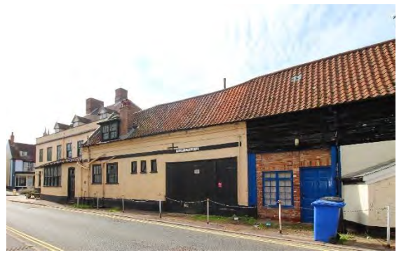
Broad Street façade of Nos.2a & 2b Earsham Street

Nos.2a & 2b Earsham Street. A pair of shops with a painted and rendered brick façade above a continuous early to mid-twentieth century shop facia. Rear elevation faces Broad Street. The shop front replaces sash windows shown on c1910 photographs, however the present shop facia was extant by mid 1920s. Formerly part of the Three Tuns and shown as part of the Inn on the 1905 1:2,500 Ordnance Survey map. Shown as separate premises on the 1927 1:2,500 map. Five hornless plate glass sashes at first floor level. Shallow pitched roof with twentieth century black tile roof. Moulded eaves cornice. Shallow pitched black pan tile roof. The listing status of this range is not entirely clear.