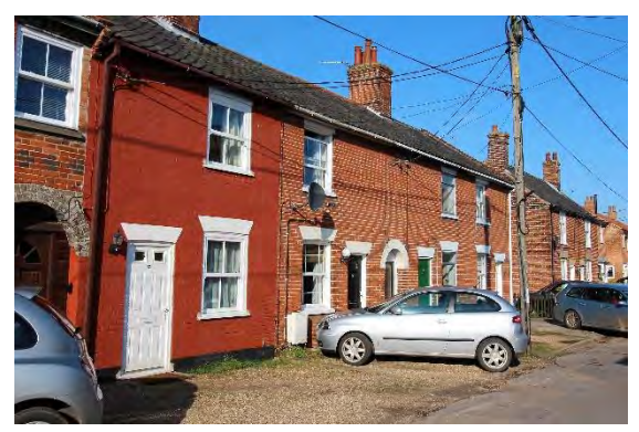
Nos.6-10 (even) Southend Road

Nos.2 & 4 Southend Road. A semi-detached pair of red brick cottages of mid nineteenth century date. Black pan tiled roof. Original door and window openings survive but external joinery replaced. Horned small pane sashes beneath rendered lintels. Door to No.4 boarded, that to No.2 two paneled. Blind return elevation. Garage to No.2 not included.