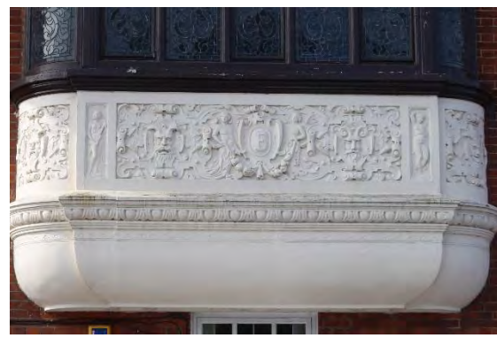
Pargetted decoration, Billiard Room wing, Earsham House, No.12, Earsham Street