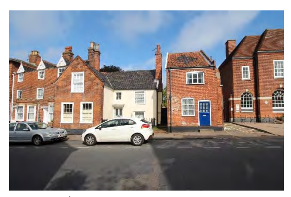
No.44 Earsham Street

No.42 Earsham Street. Built as a post office C1938-40 and attributed by The Buildings of England to David N Dyke. A good example of interwar classical design. Clad in red brick with stone dressings. Plain tile roof. Two storeys and five bays with three bay central breakfront. Arched openings with keystones to the ground floor. Central pair of panelled double doors beneath semi-circular fanlight. Flanking the doors are c1940 small pane metal casements. Small pane wooden sashes to first floor. The structure occupies the site of the former Bungay Grammar School which occupied the site from c1580 to c1925. Its forecourt undisturbed since the demolition of the Tudor school is possibly of considerable archaeological interest. Bettley, J, and Pevsner, N, The Buildings of England, Suffolk: East (London, 2015) p.154.