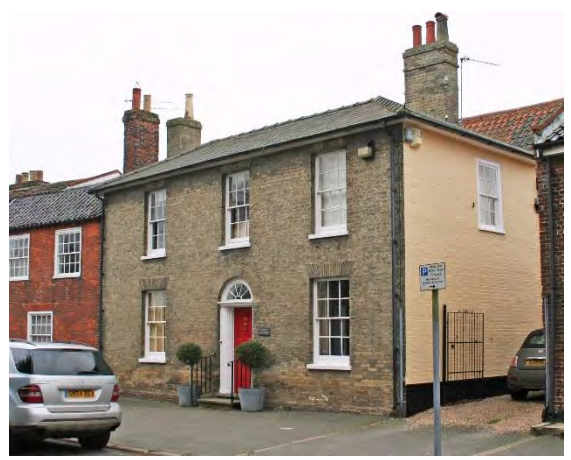
The Old Maltings, No.46 Upper Olland Street

dormers. Red brick with a plinth, black pan tiled roof. Nos.42 & 44 retain early sixteen-light hornless sashes. No. 40 now has plate glass sashes. Flat arched lintels to ground floor. Six-panelled doors in wooden cases with roundels and mutular cornices. Nos.30 to 34 (even), Emmanuel church and Nos.38 to 52 (even) form a group.