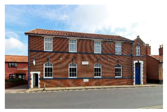
Former Saint Mary's Parish Rooms, Broad Street

Former Saint Mary's Parish Rooms, Broad Street. Former parish rooms and Sunday School built in 1882, but in a highly conservative style. Formerly with a Church of England Sunday School to the ground floor, and a mission hall above. Reputedly used as a soup kitchen in the two World Wars. Red brick with a shallow pitched red pan tile roof with blue tile stripes. Overhanging eaves with bargeboards to return elevations. Five bay, two storey, principal façade in a restrained gothic style. Painted stone dressings. Cambered brick arched windows to ground floor with painted stone rusticated keystones. Casement windows replaced with PVCu. Principal entrance in gabled bay to right with arched window at first floor level. Painted stone sill bands, with date stone below that to the ground floor. Closed c1939 and later a store and retail premises. Marked as a shoe factory on the 1969 Ordnance Survey map. Saint Mary's Church itself was declared redundant in 1977. Honeywood F, Morrow P & Reeve C, The Town Recorder, A History of Bungay in Photographs (Bungay, 1994) p14.