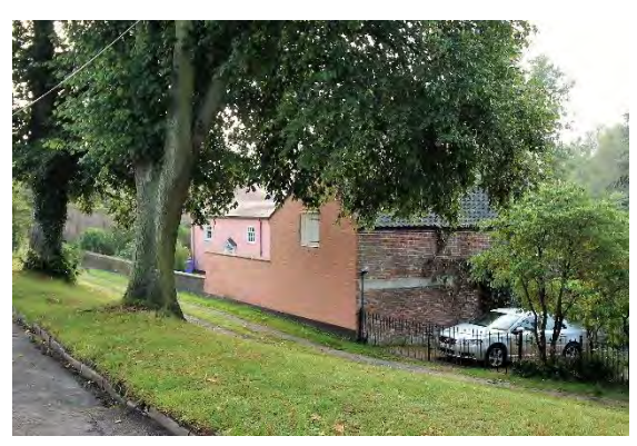
Outbuilding to Waveney Cottage, Outney Road

door in wooden case with reeded pilasters, fluted caps, radial bar fanlight and dentilled pediment. Lower range to rear at a right-angle with pan tiled roof. To its west a high rendered red brick wall, which is now painted linking the house to a contemporary stable or cart shed with a central arched opening and a hay loft at attic level. Single gabled bay to Outney Road with boarded taking-in door. Black pan tiled roof. Good red brick wall enclosing front courtyard.