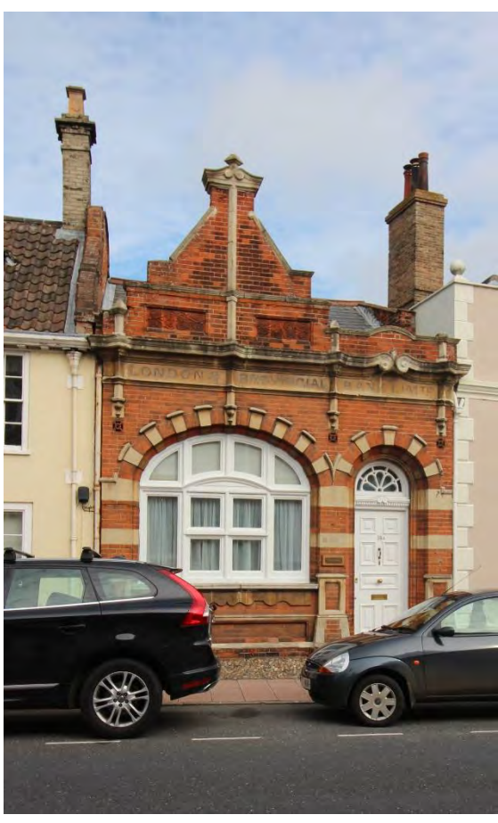
No.18a Earsham Street.

No.16 Earsham Street (grade II). A substantial seventeenth century townhouse, which is reputed to have been built in 1620. Three-storey, four-bay, stuccoed façade to Earsham Street with rusticated quoins and a parapet capped by ball finials. Moulded plaster plat band beneath second floor windows, moulded cope to parapet. Four original mullioned and transomed casements with stucco architraves at first floor level. Eight-panelled door, right of centre, in wood case with panelled reveals, pilasters and entablature flanked by twelve-light sashes. Black pan tile roof with gault brick stacks. Some original interior doors. Nb. C1900 photos show the house without the present second floor and parapet but with dormers set within the roof this part of the façade is however evident in c1930 views. Nos. 2 to 40 (even) form a group. Honeywood F, Morrow P & Reeve C, The Town Recorder, A History of Bungay in Photographs (Bungay, 1994) p148.