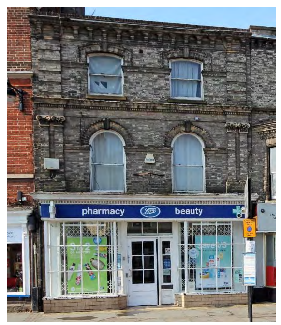
No.4 St Mary's Street

No.2 St Mary's Street. A red brick house and shop of c1800, re-fronted and partially rebuilt in Suffolk white brick c1870 probably to the designs of William Oldham Chambers of Lowestoft who designed the adjacent façade to the south. Three storey white brick façade of two bays, with canted bay to first-floor left. Horned plate-glass sashes. Parapet with dentilled cornice. Late twentieth century shop facia. Early nineteenth century red brick range to rear with hornless sashes. Some windows with glazing bars removed. Taller two bay mid-nineteenth century red brick addition with plate-glass sashes. Flat-arched lintels and stone sills. Hipped roof with overhanging eaves. Return elevation rendered.