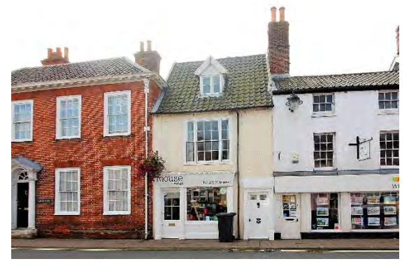
No.17 Earsham Street

No.15 Earsham Street (grade II). A substantial house with the date 1807 on its surviving original lead rainwater heads. Of two storeys and five bays with a distinguished symmetrical classical façade to Earsham Street. Red brick, plinth, and a wooden mutular cornice. Hipped black pan tile roof. Symmetrical five bay classical façade with twelvelight hornless sashes which are set within flush frames beneath wedge shaped brick lintels. Centrally placed six-panelled door, with panelled reveals to wooden case, arched radial bar fanlight, Doric columns and open pediment. Nos.1 to 19 (odd) form a group. The rear section of the plot on which this building stands is within the scheduled area of the Castle complex. Bettley, J, and Pevsner, N, The Buildings of England, Suffolk: East (London, 2015) p.154. Reeve C, Bungay Through Time (Stroud, 2009) p36.