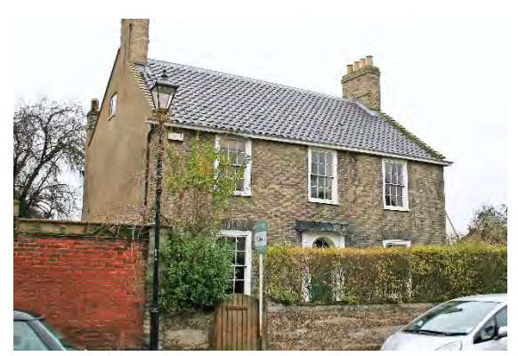
No.34 Upper Olland Street

No.34 Upper Olland Street (grade II). An early nineteenth century detached villa with a symmetrical classical entrance façade of three bays. Of two storeys with attics lit from within the gabled return elevations. Suffolk white brick façade with a mutular cornice, and a black pan tiled roof. Rear elevation red brick, side elevations rendered. Three twelve-light hornless sashes within flush frames at first floor level. Two further twelve-light sashes with flat arched lintels flanking the doorcase. Sixpanelled entrance door with arched patterned fanlight in an enriched wooden case. Northern return elevation highly visible from chapel graveyard. Rear elevation with nineteenth century casements beneath cambered lintels. Subsidiary Structures Screen walls to the left and right at a right-angle, each seven feet high with a stone cope, with a side door and blank panel respectively, square section piers. Low brick wall to front. Nos.30 to 34 (even), Emmanuel church and Nos.38 to 52 (even) form a group.