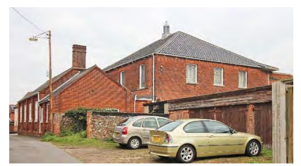
Rose Lane elevation of Emmanuel Church.