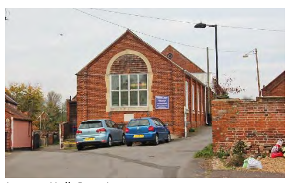
Lecture Hall, Rose Lane

Former Sunday School and lecture Hall, Rose Lane. Sunday School associated with Upper Olland Street Congregational Church built. 1867-69 to the designs of R.M. Marsden for Charles Stokes Carey. Red brick with gault brick dressings and pilasters. Traceried window in north gable and Twentieth century doorway. Return elevations with twelve-light hornless sashes and gault brick pilasters. Black pan tiled roof. Rear addition with wooden glazed roof and leaded coloured lights. Lecture rooms to rear of c1898 designed by JO Rees. Red brick with stone dressings. A prominently located structure at the junction with Rose Lane. Bettley, J, and Pevsner, N, The Buildings of England, Suffolk: East (London, 2015) p.151. Honeywood F, Morrow P, & Reeve C, The Town Recorder, A History of Bungay in Photographs (Bungay, 1994) p15 & p23.