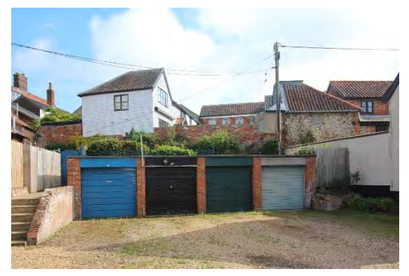
The Old Ironworks, Nathans Yard,

p.154. Reeve C, Bungay Through Time (Stroud, 2009) p45.