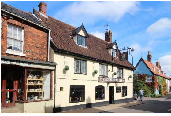
Chequers Inn, No. 23 Bridge Street

Nos.17-21 (odd) Bridge Street (grade II). No.19 early seventeenth century and later, with a nineteenth century public house façade. Now shop and dwelling. Of two storeys, faced in red brick and with a black pan tile roof covering to the main block. Single storey wing to left with red pan tile roof. Rendered ridge stack. Three hornless twelve-light sashes to the first floor with flat arched lintels and stone sills. Arched passage opening with sixpanelled door with wood tympanum above matching the door. Mid twentieth century shop facia to No 21. Two small twentieth century casements to ground floor, left. In the late nineteenth and early twentieth centuries at least part of the structure was the Beaconsfield Arms Public House. Nos.17, 21 & 23 form a group.