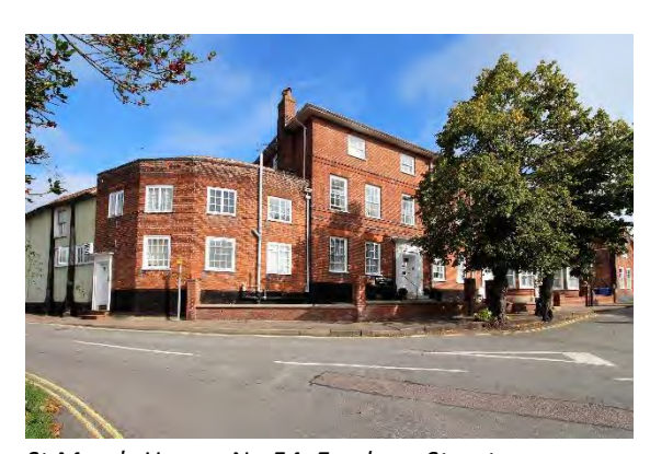
St Mary's House, No.54, Earsham Street

Nos.50-52 (even) Earsham Street. A pair of red brick terraced houses probably of early nineteenth century date. Left hand house of two bays and three storeys, right hand house of a single bay. Four light plate-glass sashes to first floor beneath wedge shaped gauged brick lintels. Similar windows above with later barge-boarded dormers above. Crenelated bow windows to ground floor with curved four light sashes. (Nb. These are not shown on c1900 photographs but are on views of c1914). Panelled doors with glazed upper lights within simple wooden door surrounds. They form part of a good group with the grade II listed, St Mary's House, No.54, Earsham Street and No.44.