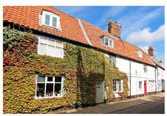
Nos. 31-33 (odd) Bridge Street

Nos.31-33 (odd) Bridge Street (grade II). Seventeenth century, and of two storeys with an attic. Two flat roofed dormers with centrally opening casements, within a red pan tiled roof. Brick colour-washed, with platt band. First floor has two early mullioned and transomed casements with flush frames which the statutory list describes as being 'original' to the present facade. Twenty-light hornless sash window to ground floor of No.31. Other ground floor windows now casements but all retain segmental arched lintels. Mid twentieth century door with oval light to No.31, twentieth century boarded door to No.33, both set within flush frames. Small nineteenth century former shop window to No.33. Nos.29 to 45 (odd) form a group.