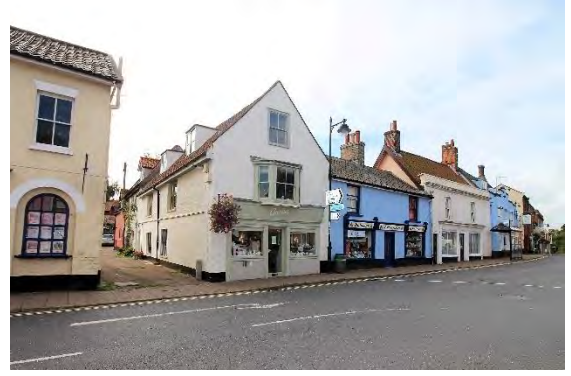
No.29 Earsham Street

Recorder, A History of Bungay in Photographs (Bungay, 1994) p147.