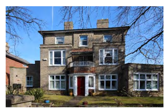
No.67 Lower Olland Street

occupies the site of a former conservatory. To the right a later recessed bay with an Ionic porch. Door with glazed upper panels. In the nineteenth century the home of the Walker family owners of the Staithe Maltings. Honeywood F, Morrow P, & Reeve C, The Town Recorder, A History of Bungay in Photographs (Bungay, 1994) p104.