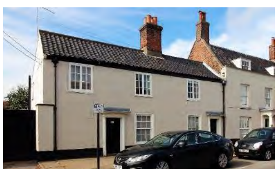
Nos.15-17 (odd) Broad Street

Nos.11-13 (odd) Broad Street Semi-detached pair of two storey cottages of c1800 date. Black pan-tiled roof covering, patched with red pan tiles. Large central red brick chimneystack rising from spine wall between the cottages. Dentilled brick eaves cornice. Late twentieth century casements to first floor and sashes below. Front doors both late twentieth century. Attached to the rear of No.13 is a substantial two storey red brick outbuilding of probably early nineteenth century date. This pair of cottages make a strong positive contribution to the setting of the grade II listed Nos.17-19 (Odd).