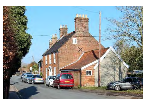
Wingfield House, No.14 Wingfield Street

See also No.67 Lower Olland Street (Ollands Character Area)