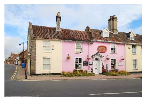
Nos.20-22 (even) Earsham Street

No.18 Earsham Street (grade II). Part of the same structure as Nos.20 & 22 (even). Of mid to late Seventeenth century date, and of two storeys with an attic. Red pan tile roof covering with two gabled dormers. Gault brick chimneystacks, that shared with No.20 partially rendered. Painted stucco, façade to Earsham Street. Twelve light hornless sashes within flush frames. Two Dutch gables. Sixpanelled door with semi-circular radial fanlight, set within a doorcase with panelled reveals, pilasters, and an open pediment. Nos. 2 to 40 (even) form a group.