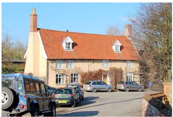
No.45 Staithe Road

Staithe Business Suite, Staithe Road. A later nineteenth century gault brick faced industrial structure which is now converted to offices. Shown on the 1885 Ordnance Survey map. Rendered return elevation. Hipped Welsh slate roof with overhanging eaves. Two louvered ventilators to ridge. Largely symmetrical façade with late twentieth century casement windows within original openings. Twin central doors with former taking-in doors above. Late twentieth century industrial structure to rear not of interest. Blocked doorway to left-hand outer bay. An important part of the setting of the grade II listed No.45 Staithe Road. Twentieth century addition to left not of interest.