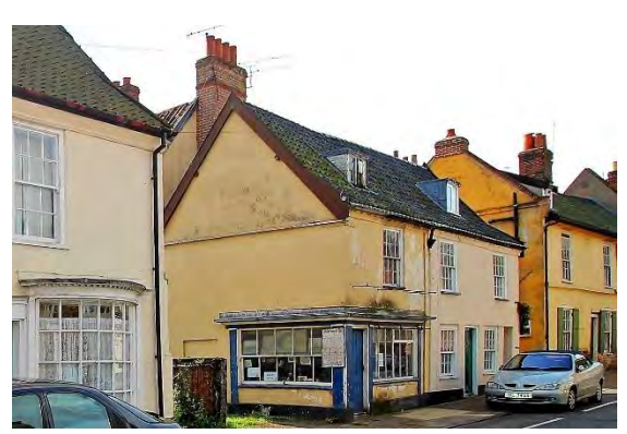
Nos.24 & 26 (even) Bridge Street

Nos.16-22 (even) Bridge Street (grade II). Three cottages, two within front range and No.22 at the rear. Early eighteenth century, of two storeys and an attic. Black pan tiled roof with a single flat roofed dormer to No.20. Colour-washed brick, with a moulded brick platt-band. Part with later applied projecting plinth. Nos.16-18, have their original sixteen-light hornless sashes at first floor level. To the ground floor centrally placed four panelled doors flanked by similar flush framed hornless sash windows with flat lintels. No.20 has two sixteenlight hornless sash windows to each floor. Those to the ground floor having panelled shutters. Centrally placed six-panelled door with near-flush frame. Scarring of former window openings with segmental heads visible in front wall to both ground and first floors of No.20. Lower range to the rear. Nos.2, 4, 6a & 6b, 12 to 20 (even), 24 to 34 (even) 40 to 44 (even), 48 and 50 form a group.