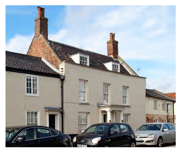
Cambridge House, No.19 Broad Street

small-paned casements in flush frames to the first floor. Twelve-light hornless sashes in flush frames to the ground floor, with flat arches. Two entrances with six-panelled doors, reeded pilasters and mutular cornices. Nos.15-19 form a group.