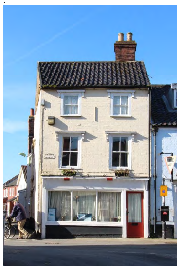
No.54 St Mary's Street

nineteenth and early twentieth centuries. The earliest reference to its dates from 1823 and the pub is believed to have closed c1912. Honeywood F, Reeve C, & Reeve T, The Town Recorder, Five Centuries of Bungay at Play (Bungay, 2008) p151.