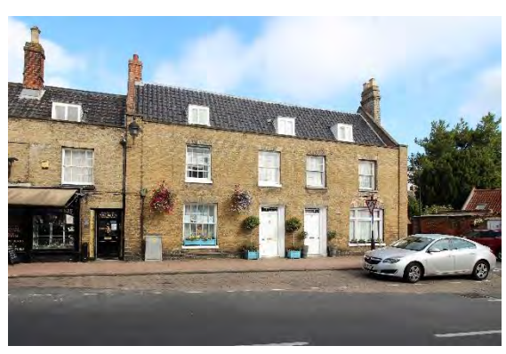
Nos.24-26 (even) Earsham Street

The western or Chaucer Street façade of No. 22 is of mid nineteenth century date and of gault brick with painted stone dressings. Dutch gable, and wooden shop facia. The First floor has a centrally placed plate-glass sash window with a pediment supported on console brackets. Single storey red brick outbuilding with red pan tile roof to rear probably of early nineteenth century or earlier date. Nos. 2 to 40 (even) form a group.