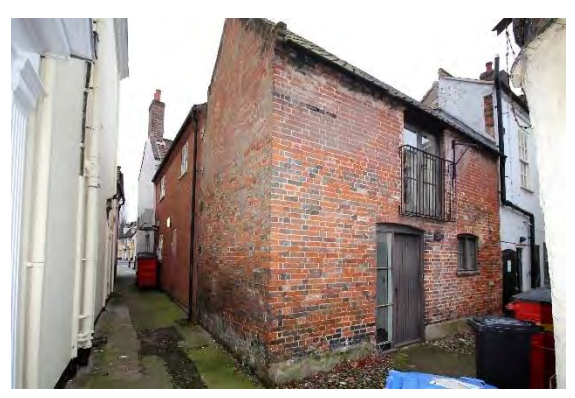
No.7a Market Place

No.7 Market Place (grade II). Early eighteenth century, of two storeys and an attic, two casement dormers within roof slope. Stucco. Market Place façade of two storeys flanked by pilasters. Red plain tile roof. Bowed oriel sash window at first floor level, with small pane sashes and a dentilled cornice. Mid nineteenth century wooden splayed bay shop front with a central entrance. Nos. 1 to 11 (odd), Nos. 11A, 13 and 17 to 21 (odd) form a group together with the Butter Cross.