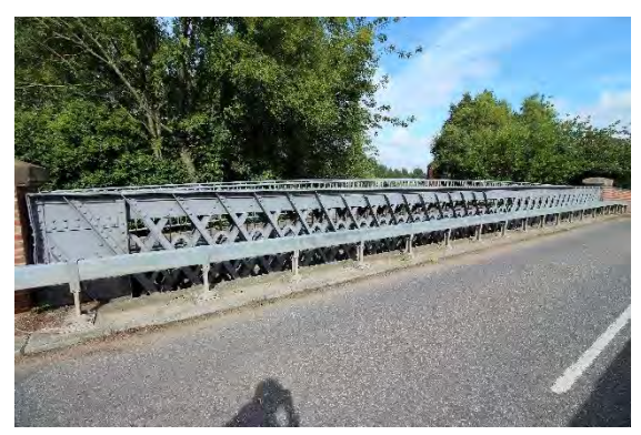
Falcon Bridge, Bridge Street

No.45 Bridge Street (grade II). A seventeenth century, two storey brick building, with a twentieth century cement rendered ground floor. Timber framed, plastered and with twentieth century applied half-timbering to the first floor. Red pan tiled roof. Three, three-light casement windows to the first floor. Small former shop window to ground floor right probably of later nineteenth century date. Four panelled front door of probably twentieth century date with near-flush frame. Gabled return elevation to the bridge with applied timber framing and casement windows. Lower outshot to rear. Nos.29 to 45 (odd) form a group.