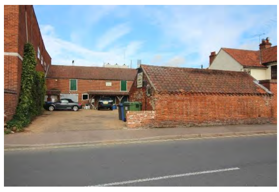
Outbuildings at The Green Dragon Public House

The Green Dragon Public House and outbuildings to rear, No.29 Broad Street and Popson Street. A purpose-built public house of c1926, replacing an earlier inn. Formerly known as the Horse and Groom. Restrained 'arts and crafts' vernacular style. Much of the building's original external detailing has survived including its external joinery and leaded windows. The pub is faced in red brick with pebble dashed first floor, and a hipped red pan tile roof. Wooden casement windows divided by mullions and a transom and with small leaded panes to the ground floor. The first-floor windows are similar but do not have a transom. Fine decorative rainwater heads. Subsidiary Structures To the rear are two much earlier outbuildings. Fronting Popson Street is a single storey red brick outbuilding of c1800 with a red pan tile roof and a dentilled brick eaves cornice. This is a survival from a range of out buildings shown on late nineteenth century Ordnance Survey maps. To the rear of the yard a two-storey red brick stable range with boarded doors and a red pan tile roof. Probably of early nineteenth century date, its ground floor openings show signs of alteration and a number of the original brick lintels have been replaced.