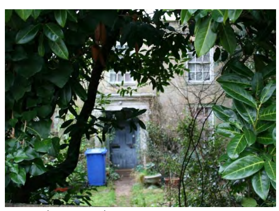
No.16 Flixton Road

No.16 Flixton Road and outbuildings (grade II). Early nineteenth century villa of Suffolk white brick built as the miller's house for a now demolished smock mill. Two storeys with a Welsh slate roof. Band below, parapet with a stone cope. Symmetrical