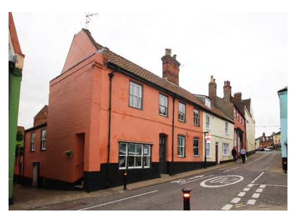
Nos.4, No. 6a, & 6b Bridge Street

Nos.4, No. 6a & 6b Bridge Street and garden walls to rear. (grade II). Standing on the corner of Borough Well Lane and probably of early eighteenth century date. Of two storeys and an attic, with a low two storey rear range facing Borough Well Lane. Rendered and painted with a platt band below the first-floor windows. Four-light plate glass sashes with horns to the first floor. One gabled dormer to No.4 within a replaced red pan tiled roof. No.4 is shown with a shop facia to the ground floor right on c1920 photographs, but this has been replaced by a tripartite sash. To the left of the four-panelled front door is a relatively recent four-light horned sash, in a segmental arched opening. A small central window at first floor level is also shown on early photographs. To the rear of No.4 is a red brick range with an elevation facing a yard off Trinity Street. This has a black pan tiled roof to Borough Well Lane and a red pan tiled roof to its other faces. A late nineteenth century wooden oriel window is set within the end wall at first floor level. Below this window there was evidently a further recently demolished single storey projection