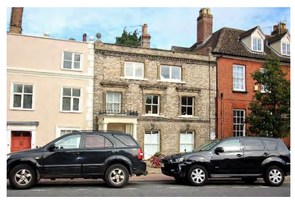
No.14 Earsham Street

No.14 Earsham Street (grade II). A substantial dwelling with seventeenth century origins. It is reputed to have been built in 1620 but is probably of c1660, and once formed part of a much larger dwelling which included No.16. Three storeys and three bays. Mid nineteenth century gault brick classical façade with low parapet and corner pilasters capped by finials. Red pan tile roof covering. Horned plate glass sashes to ground and first floors. Six-panelled door, panelled reveals, enriched consoles, key, and bed mould remains of original entablature. Mid nineteenth century porch with slender columns, entablature, and cast-iron ornament. Partially glazed in the late twentieth century. Low eighteenth century rear service range with mid twentieth century Crittall windows and nineteenth century addition. This range is rendered and has a red pan tiled roof. Interior; panelled room, right, with fluted pilasters and cornice. In 1933, thirty-five horse's skulls were found fixed in rows between the joists of the floor of this room, said to be a music room, placed there to improve its acoustics. (No. 16, adjoining originally part of this room; similar skulls found under corresponding room on opposite side of the house). Original staircase gone and many other features. Panelled room used as hairdressing saloon. Nos. 14 and 16 are two of the few buildings which survived the fire of 1688.