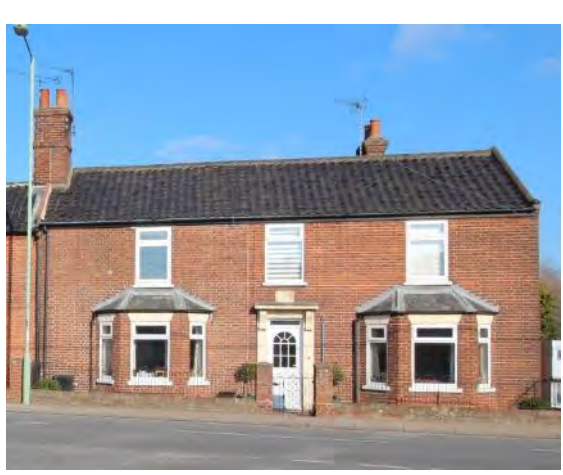
No.15 St John's Road

No.13 St John's Road. A red brick early to midnineteenth century cottage with a black pan tiled roof. Three bay two storey façade with central door. Doorcase with pilasters. Late twentieth century casement windows in original openings. Late twentieth century boundary wall to street not included. Prominently located at the termination of Bardolph Road.