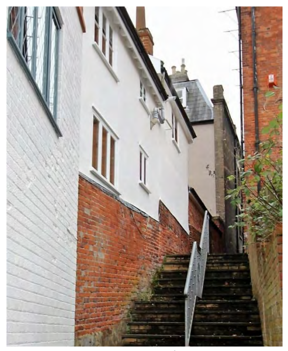
Borough Well Lane elevation of No.9 Trinity Street

No.9 Trinity Street. An altered eighteenth century detached dwelling standing at a right-angle to Trinity Street behind No.7. The house backs onto Borough Well Lane. Red brick with a partially rendered gable end. Sixteen-light sashes in heavy moulded frames. Three-bay two storey entrance façade with central doorway. Replaced red tile roof and central ridge stack. Rear elevation to Borough Well Lane with high basement storey. Red brick partially rendered with casement windows.