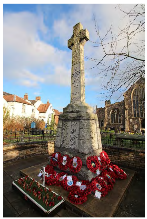
War Memorial, St Mary's Street

Pier with urn adjacent to K6 telephone box, St Mary's Churchyard. Probably a curtilage structure to St Mary's Church. Probably of early nineteenth century date. A square section Suffolk white brick pier with a stone cap and an urn. Painted plinth and lower section. A similar pier at the southern end of the churchyard is individually listed at grade II. A similar pier also once existed on Trinity Street but only its base now survives.