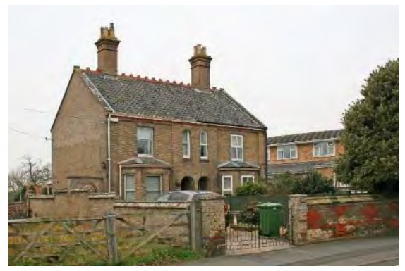
Nos.10 & 12 Flixton Road

Nos.10 & 12 Flixton Road and boundary walls. A semi-detached pair of late nineteenth century gault brick villas. Map evidence suggests that they were constructed between 1885 and 1905. Black pan tiled roof with decorative ridge pieces. Single storey canted bay windows to ground floor. Doors within arched recessed porches. No.12 has its original plate glass horned sashes. The windows to No.10 have been replaced with casements. Subsidiary Structures Notable stepped gault brick wall of c1890 to south side of No.12. Similar though less decorative wall to north of No.10. red brick wall with gault brick piers to Flixton Road. Gault brick gateway with arched door opening to north side of No.10. red brick garden walls to rear.