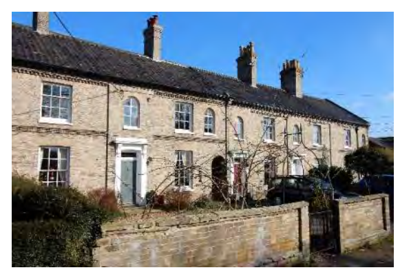
Nos.1-9 (Odd) Laburnum Road

See also No.2 Bardolph Road and boundary walls, Nos.1 &3 Flixton Road, and No.28 Southend Road.