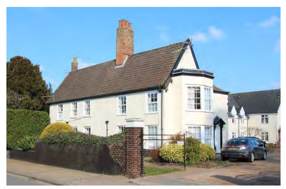
The Old Vicarage, No.37 Upper Olland Street

Brick pilasters with moulded caps and bases. Brick lozenge pattern on end wall, and two earlier window openings filled in. Letters RR in wrought iron ties on gable. Eight bay façade with two blank panels, and six casements in flush frames, ground floor windows with segmental arches. No.31, fourpanelled door. Nos.33 and 35, 6-panel doors in wood cases. Nos.21 to 37 (odd) form a group.