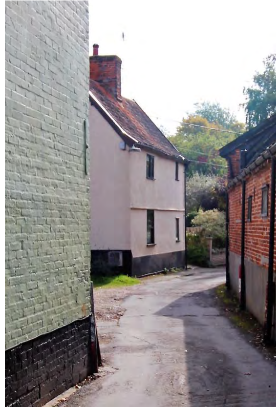
No.3 Castle Lane

For Scott House and garden walls see Earsham Street.