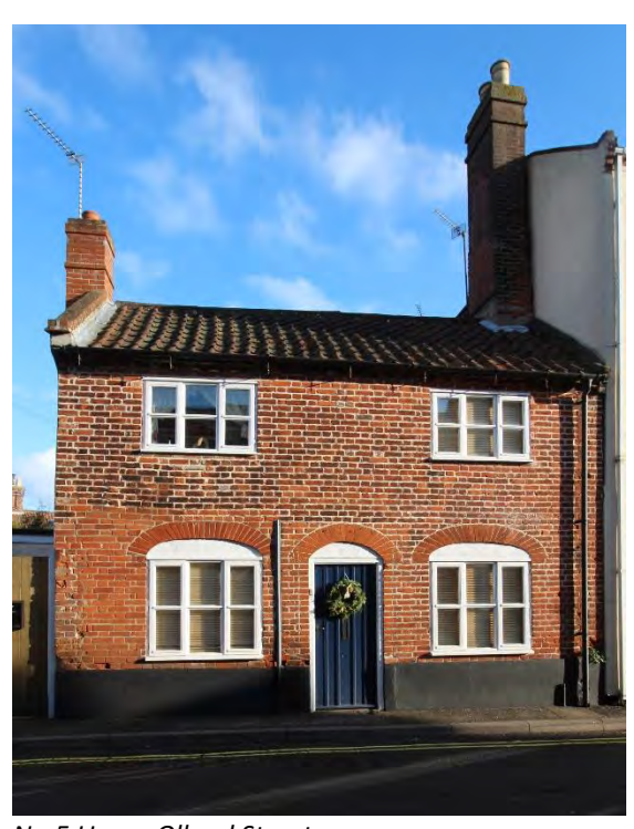
No.5 Upper Olland Street

No.3a early nineteenth century, two storey, red brick, shallow pitched red pan tiled roof. Flush Small pane casement at first floor level. Ground floor, flush frame sash, left, and shop front with glazing bars and wood case with channelled pilasters. Nos.1, 3, & 3a form a group with No.2 Lower Olland Street and No.56 St Mary's Street.