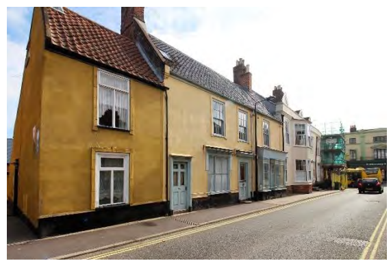
Nos. 6, 8 & 8a Broad Street

Nos. 6, 8 & 8a Broad Street (grade II). Of eighteenth-century date, No.8a is possibly a later addition. Two storey rendered street frontage, Nos. 6 & 8 having a black pan tile roof, the lower No.8a red pan tiles. Nos. 6 & 8 with three, twelve-light hornless sash windows at first floor level in flush frames with later lugged surrounds. No.8a has one casement at first floor level in a similar lugged surround. No.6 is flanked by two storey pilasters; square bay shop front. Smaller shop window to No.8 and partially glazed door in simple wooden surround. No.8A has an entrance with a modern glazed door in a narrow wooden case and a catslide roof to the rear.