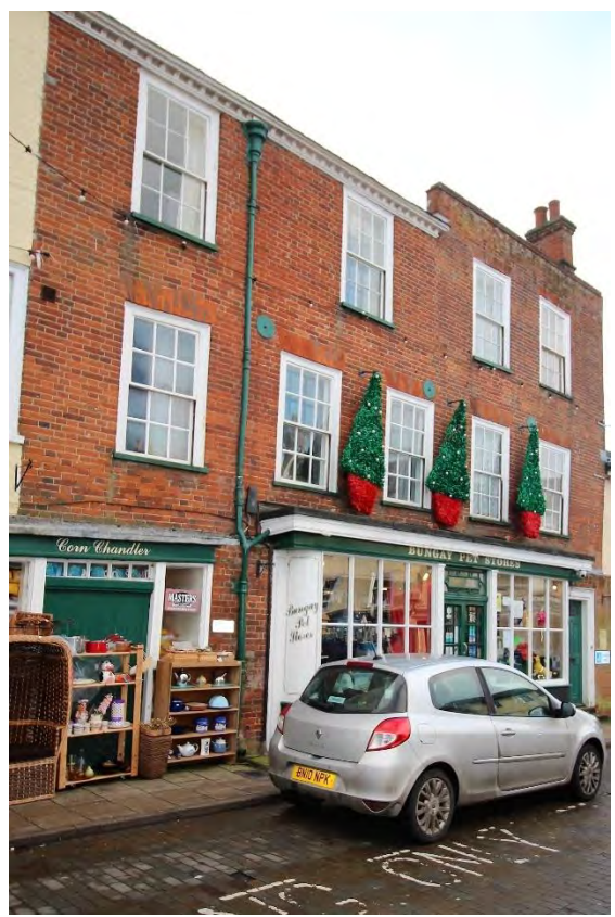
Nos.17-21 (Odd) Market Place

pilasters and entablature. Nineteenth century glazing bars, except to patterned fanlight. No.15 is described in the listing entry but its numbering is incorrect.