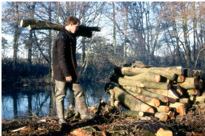
Coppicing as a form of woodland management (Rob Andrews)

In recent fen management workshops (November 2001 & September 2002), the opportunity has been taken to review all fen management activities. Experience with scrub removal over the last seven years has led to reinforcement of certain principles, and in some cases, refinements to future working practices have been suggested. The following list summarises the main recommendations and working practices for scrub clearance as discussed and agreed at the 2001 and 2002 fen workshops: