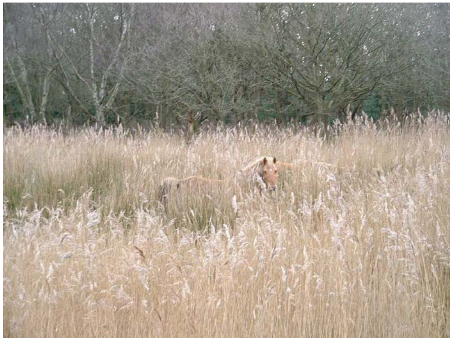
Konik ponies grazing wet fen

The Fen Management Strategy identified 2090ha of grazeable fen communities. Grazeable in the context of fens is defined as fen communities where a significant proportion of the component plants are palatable to grazing animals, and generally include rushes, sedges or grasses.