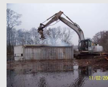
From top left (clockwise) Kori excavator, 'bird-eye' cutting head, incinerator without floats, incinerator with floats. (Tim Hanks).