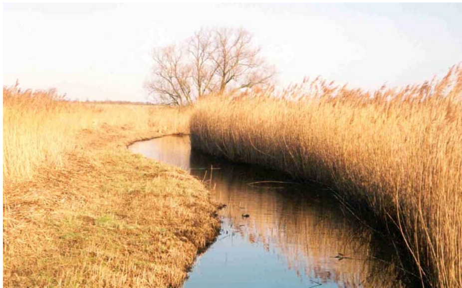
Fen dyke (Richard Starling)

The hydrological functioning of peat and the possible changes to this through compaction has already been discussed. However, it is clearly impossible to determine the level of change to a feature without first determining how it should function without interference. There is a general lack of information about the hydrological workings of the fen resource and thus we have little knowledge of how the fens may react to changes in hydrology whether caused by management or external influences such as sea level change.