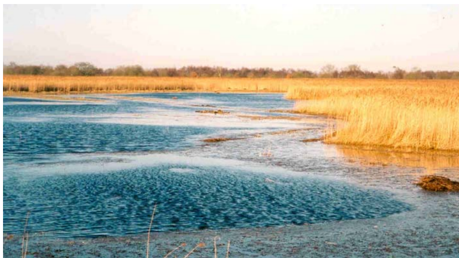
Flooded reedbed

Winter flooding has been a characteristic of Broadland hydrology for centuries. However, this has been exacerbated in recent decades by changes in the floodplain and catchment management and will be affected again by any future sea level rise. This flooding, which for many sites can be deep and prolonged, often prevents management from taking place during the winter months; this can be an issue for three months or more every year.