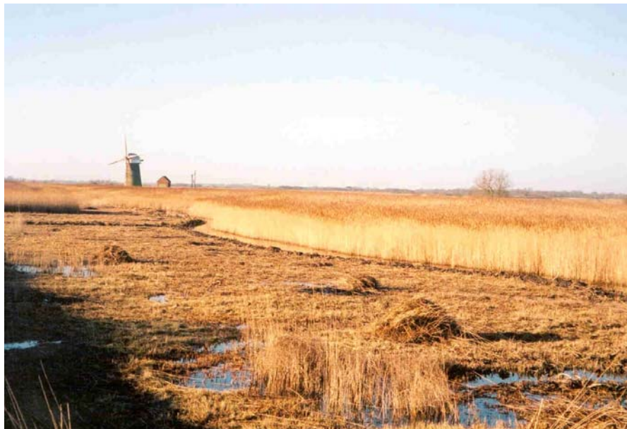
An area of fen managed by mowing