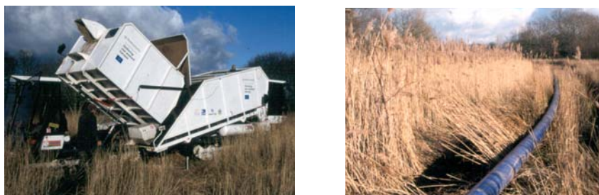
The fen harvester tipping into the blower & the blower pipeline

This three-year project resulted in the manufacture of a machine and associated components that could potentially cut, gather and remove fen vegetation from large areas with minimal environmental damage. Since the completion of the initial EU project, the harvester continues to work in the Broads, supported by English Nature and other local partners and managed and operated by the Broads Authority. These last seven years of fen harvester operation have provided evidence of what the fen harvester can achieve for fen management and some of the problems associated with its use.