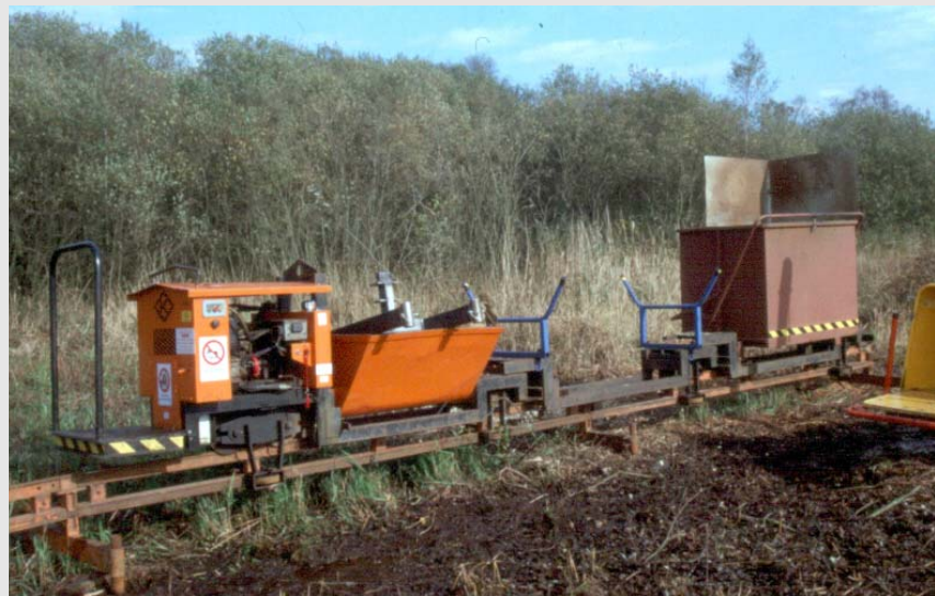
The Monorail (Rob Andrews)

Scrub is cut at the base of the trunk. The material is then either burned on site at a designated bonfire site or loaded into a chipping machine. If the scrub is chipped, a monorail system can be used to transport the material to the edge of the site for removal. The monorail consists of a 4" wide single rail that rests upon a simple 'H' frame. The legs of the frame can rest directly on the fen, or on wet sites, can be placed upon an inflated rubber tyre to prevent damage to the surface. A skip-like container is towed along the rail by a small diesel engine. The chipper blows directly into this skip, which when full, is towed back to the beginning of the monorail where it is tipped out. Whether cut manually or by chainsaw, all stumps are treated to prevent re-growth.