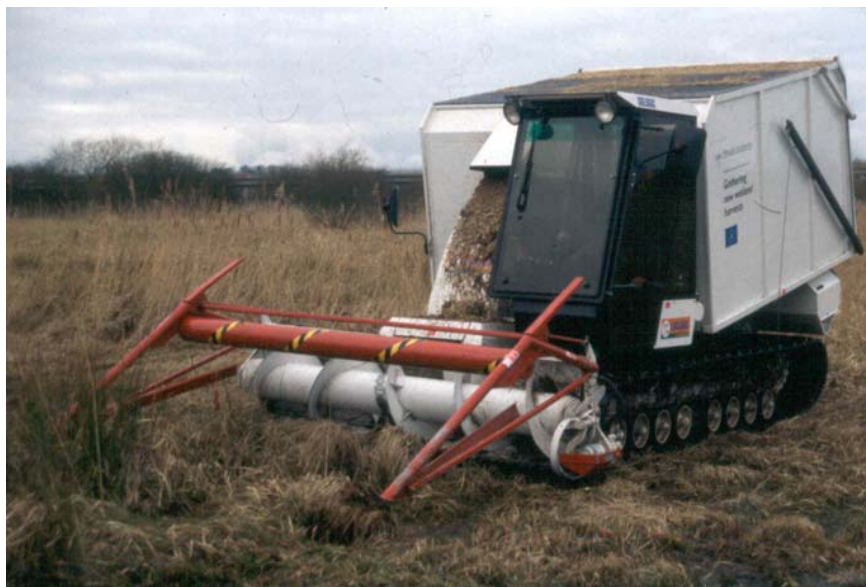
The fen harvester at work

When the Fen Management Strategy was published seven years ago, the design and manufacture of a large-scale mowing machine suitable for the fens was still in its inception. The Strategy had recognised that in order to maintain the current 2000ha of open fen and to restore a further 1000ha, a range of management techniques were required. In total, the Strategy suggested that approximately 1000ha of mixed tall herb fen could be managed through mowing, which on a suitable rotation would equate to approximately 250ha mown per year. At the time of the Strategy, conventional mowing machines would only have been able to mow and remove fen vegetation from a fraction of this amount.