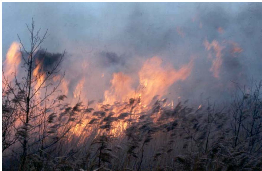
Standing burn of fen vegetation

Burning is a management method that periodically returns to the discussion table for consideration and has more recently been revisited at the fen workshop in September 2002. In reality, little has changed since the production of the Fen Management Strategy, with the same reservations being held by some ecologists over the potential damage of burning large areas to invertebrates. In addition, regular burning of large areas has its own set of practical issues such as the release of greenhouse gases and the danger of fire to near-by thatched properties. However, the technological and resource difficulties associated with other management methods do encourage the examination of all alternatives.