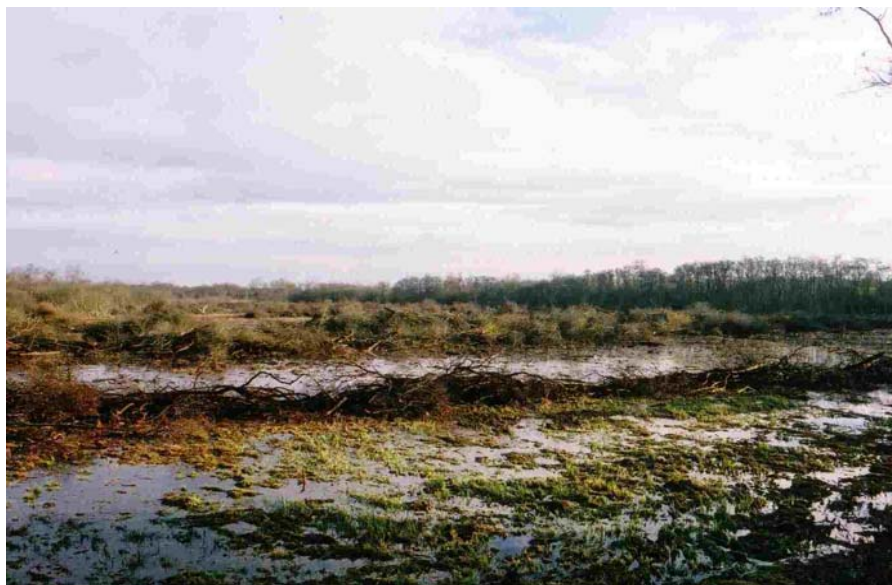
Ground disturbance following restoration (Tim Hanks)

Much effort in recent years has been directed towards the large-scale removal of scrub that has invaded open fen habitat. In many cases, the methods employed to remove scrub involve either pulling trees out of the peat with an excavator, or cutting the trees down with a chainsaw, leaving the stumps behind. Either technique can result in the fen being unsuitable for follow-up management owing to the presence of holes and disturbed peat, or the presence of stumps over which machinery such as the harvester cannot pass. In the case of holes and unstable substrate caused by the removal of the whole tree, many years may be needed for the fen surface to 'heal' before either the harvester or grazing animals can venture onto the site to manage the resulting open fen vegetation. New methods are being investigated whereby large-scale scrub removal is combined with stump grinding to avoid problems such as those noted above (see page 6).