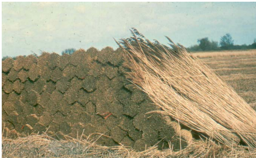
Commercial reed stacked and ready for transport

For many decades, crops of reed and sedge were harvested from the fens as part of a productive rural economy. This industry declined significantly following the Second World War, which in turn resulted in a rapidly dwindling number of marshmen working the fens. Today, only some fifteen commercial cutters work across the length and breadth of the Broads, several of whom are beyond or approaching retirement age; between them they harvest less than 200ha of fen. These numbers remain threatened with further losses owing to a variety of factors that are undermining the viability of the industry, so that Norfolk reed and sedge could potentially become a product of the past (see 'rejuvenating the industry' on page 16). The repercussions for the conservation interest of the fens of such a loss would be considerable, with the cessation of management on many sites, which have been maintained through commercial harvesting for decades.