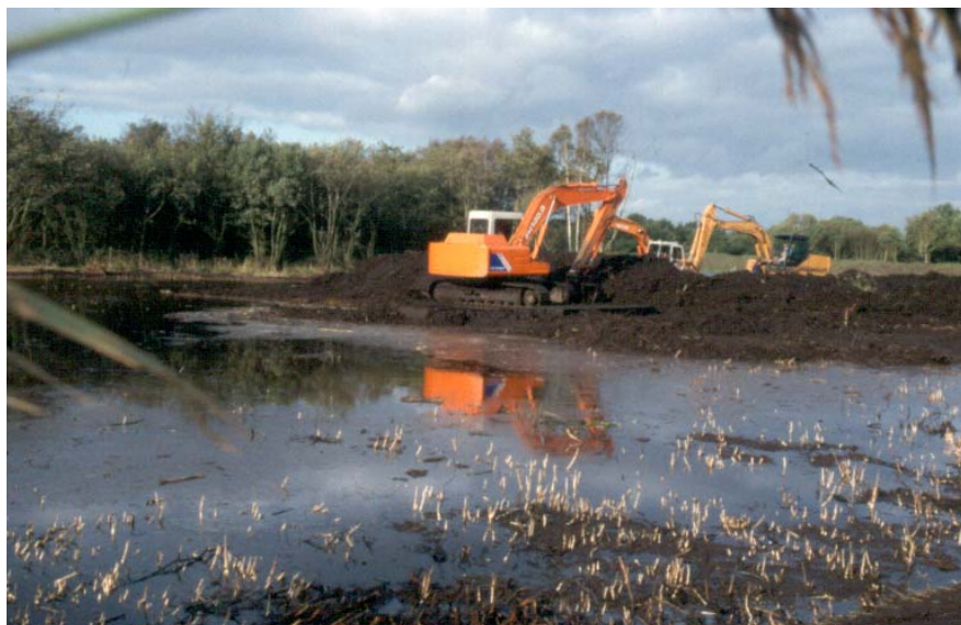
Large-scale peat removal at East Ruston

Arresting natural succession within a wetland system can be achieved through scrub clearance as described in the previous section. However, further work can be undertaken to achieve an even earlier phase of successional development, whereby bare peat or open water is reintroduced to the fen environment. This can be achieved through the removal of peat, either in defined excavations, or across a wider area; both methods are described below.