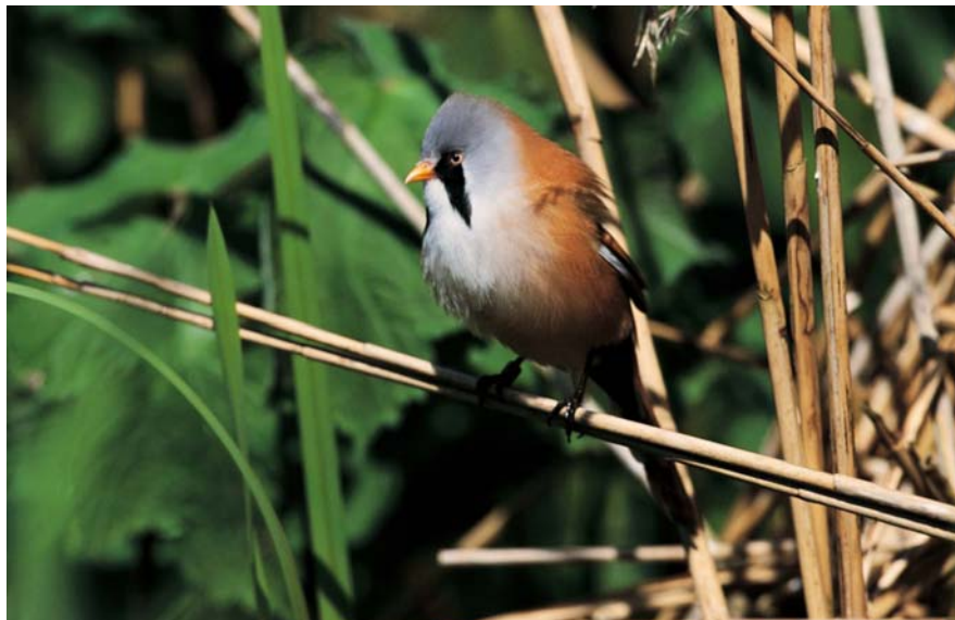
Bearded tit

Under the Wildlife & Countryside Act (1981), it is an offence to disturb, damage or destroy a bird's nest that is in use. This has implications for fen management work, which may disturb birds during the breeding season. Therefore, the fen harvester largely stops work from mid-April to July and the operators continually monitor worksites throughout the remainder of the summer. (This 'quiet' period has been defined in consultation with the RSPB and English Nature). However, this does mean that the harvester is unable to take advantage of the drier conditions of late spring and early summer, thus reducing the total amount of fen that can be harvested each year. Commercial cutting continues during the bird breeding season as the areas mown are generally small and nest sites can be readily observed and avoided. Low intensity grazing is not deemed to be disturbing to breeding birds.