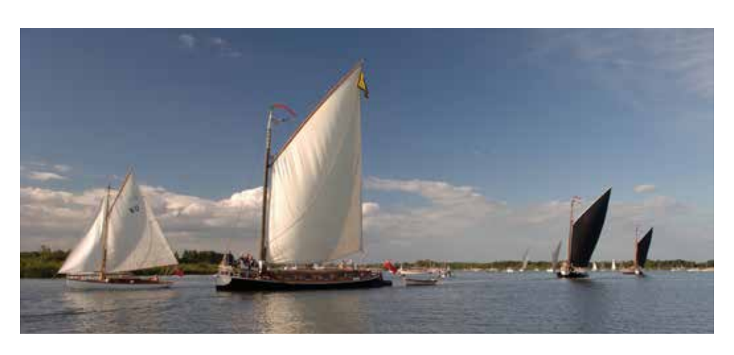
The Broads "A breathing space for the cure of souls"