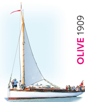
OLIVE 1909 wherry yacht