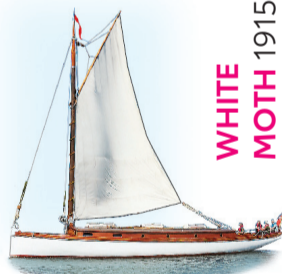
WHITE MOTH 1915 wherry yacht wherryyachtcharter.org