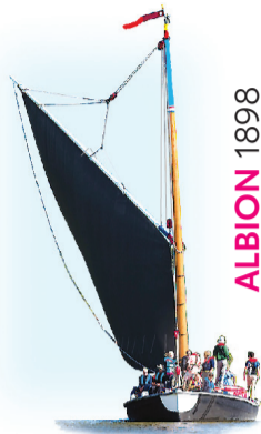
ALBION 1898 trading wherry wherryalbion.com

When the Norfolk Wherry Trust formed in 1949, it tried to start ALBION sailing again with cargo, transporting timber, grain and sugar beet on the route between Norwich and Great Yarmouth.