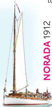
NORADA 1912 wherry yacht