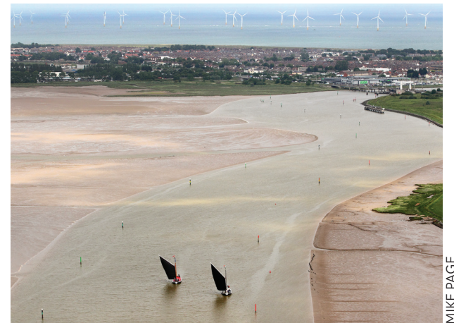
Crossing Breydon Water at slack water – note how the navigation channel runs through extensive mudbanks

Check the map here to make sure you know what to do. Keep everyone inside the boat or cockpit during the crossing. Concentrate on what you are doing. The channel has some bends in it, but don't take shortcuts. Never go outside the red and green navigation posts. If you get stuck, try and reverse. If that doesn't work, call your boatyard.