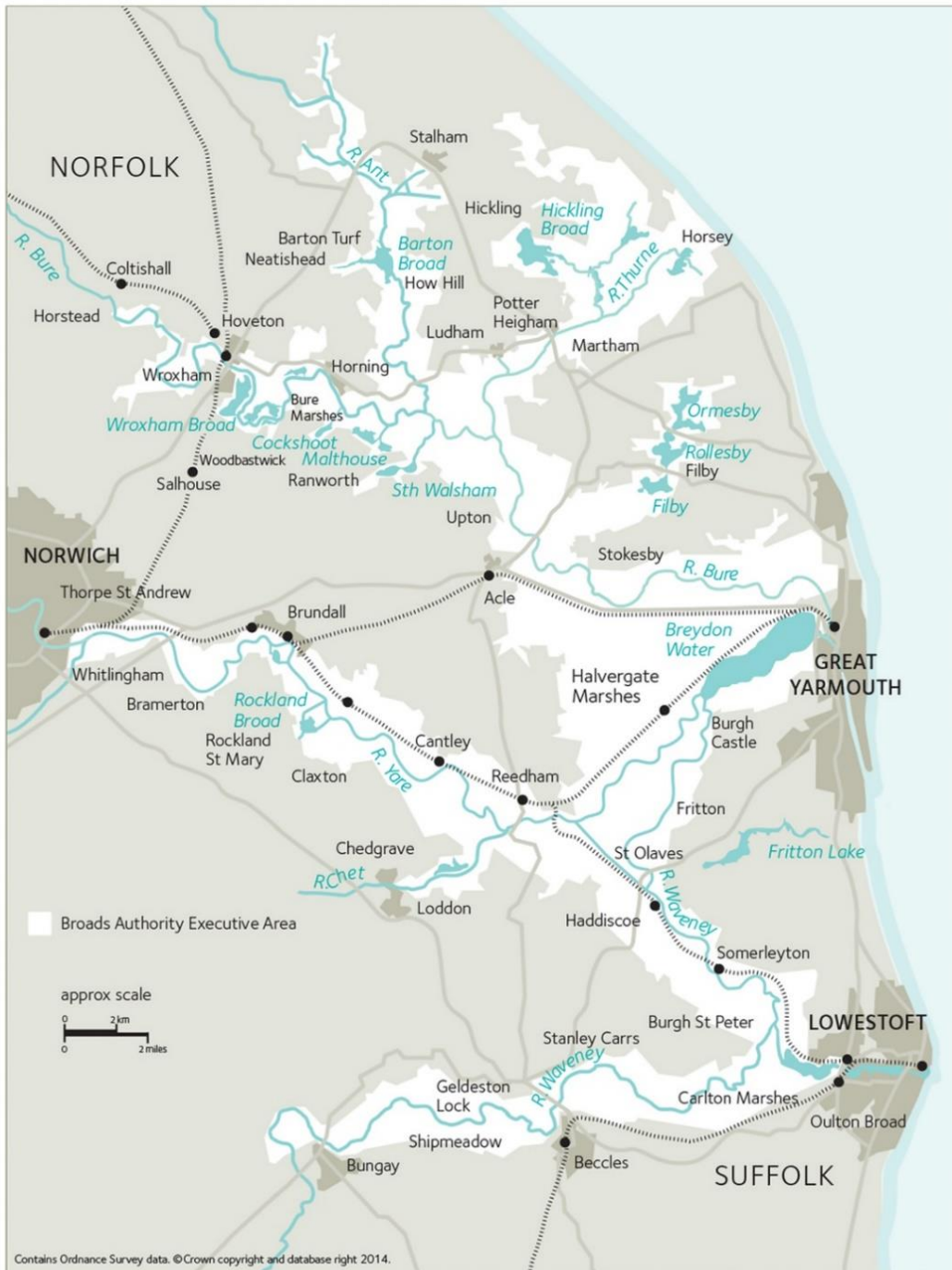
The Broads executive area, at around 303km 2 , sits at the end of the much larger Broadland Rivers Catchment (c.3200km 2 )

A map of the Broads with more information is on p2 of Broadcaster 2022 by Countrywide Publications